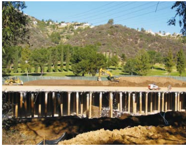
The new Chevy Chase Reservoir in the Chevy Chase Country Club golf course is expected to be completed in 2010. Demolition work on the old reservoir began in early January 2008.

So, the next time you turn on a faucet in your home, know that there are many people working diligently to keep your water safe and healthful for you to drink.