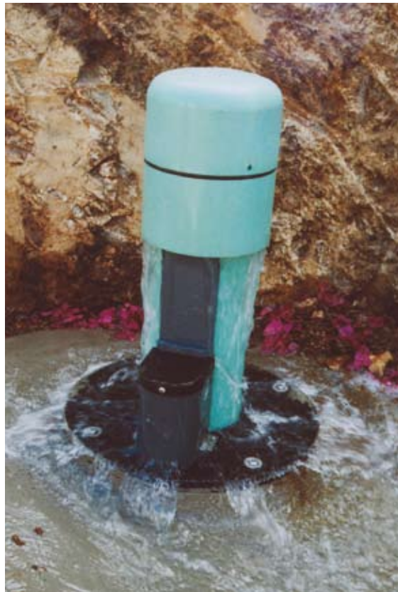
Automatic Flushing Device

More information about contaminants and potential health effects can be obtained by calling the USEPA's Safe Drinking Water Hotline (1-800-426-4791).