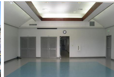
Dunsmore Community Room