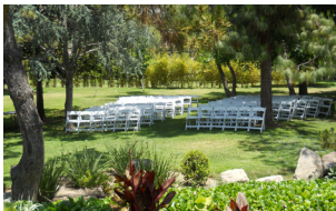
Brand Friendship Garden

*All wedding venues require a conditionally refundable deposit, liability insurance, and will be charged $20 per hour staff fees.