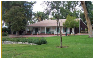
Casa Adobe De San Rafael