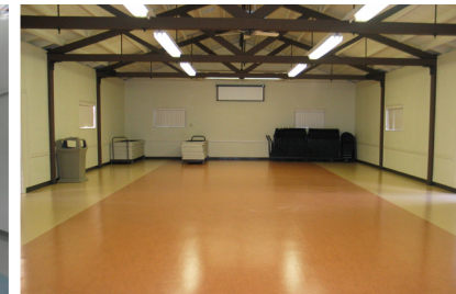
Joe Bridges Clubhouse