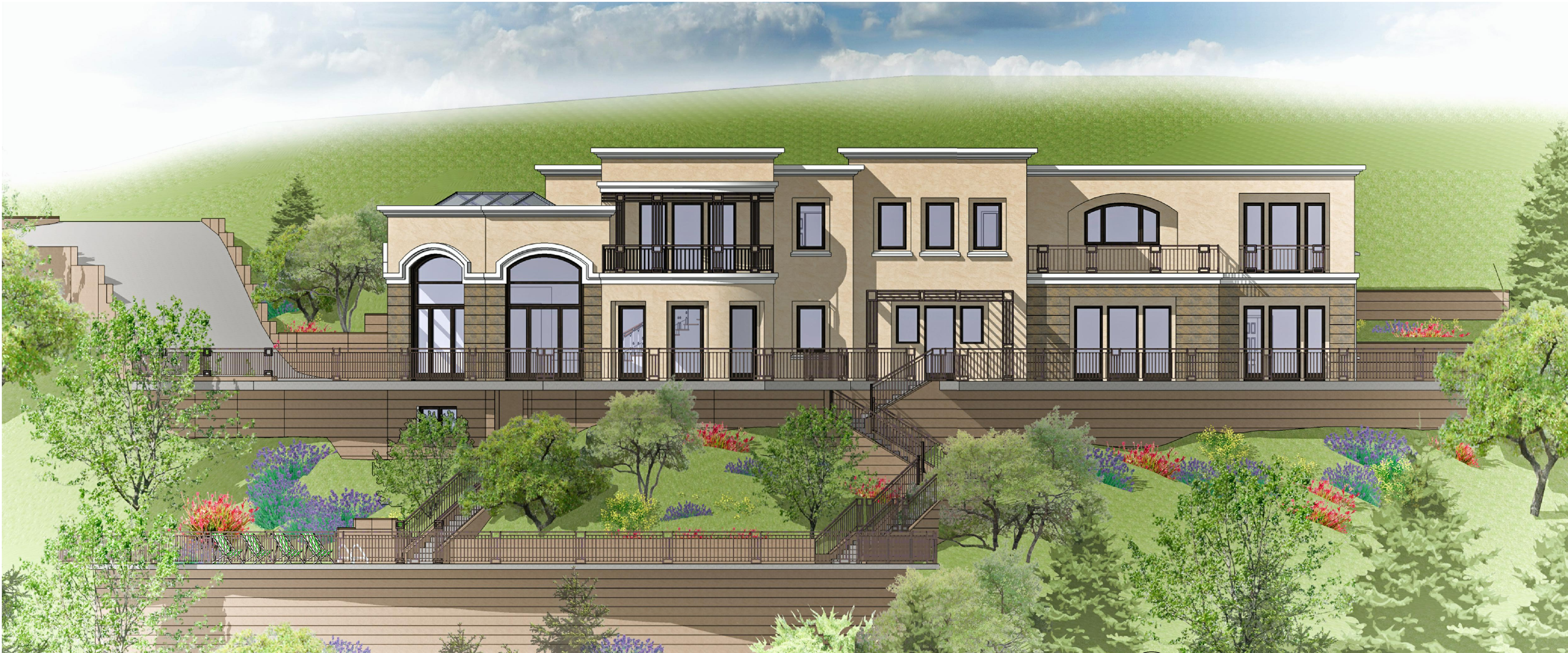
2 SOUTH ELEVATION 3/16" = 1'-0"