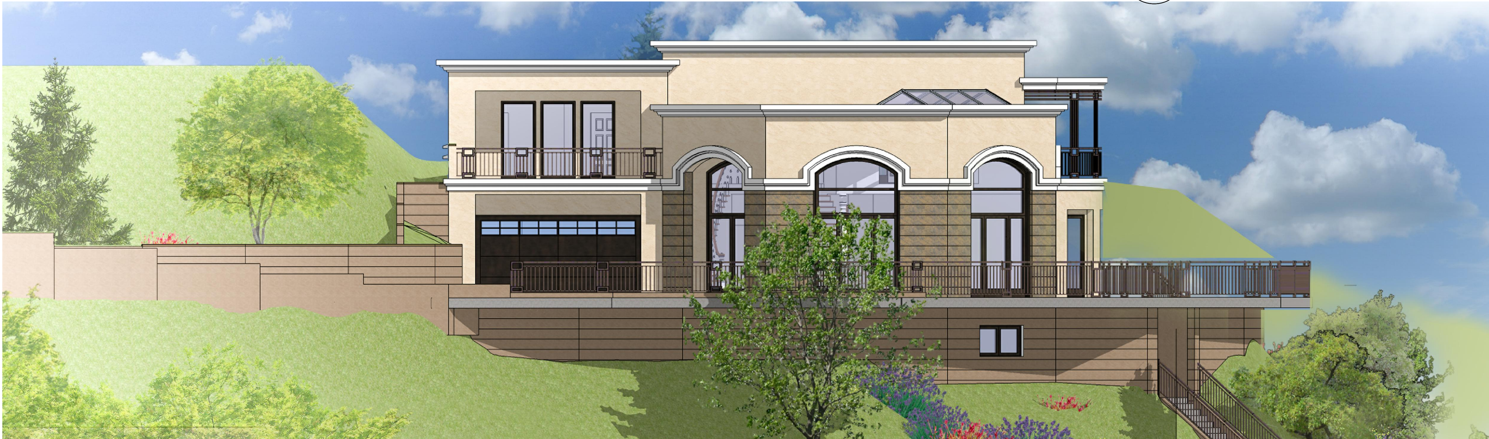
1 WEST ELEVATION 3/16" = 1'-0"

EDWARD HAGOBIAN & ASSOC. INCORPORATED ARCHITECTS