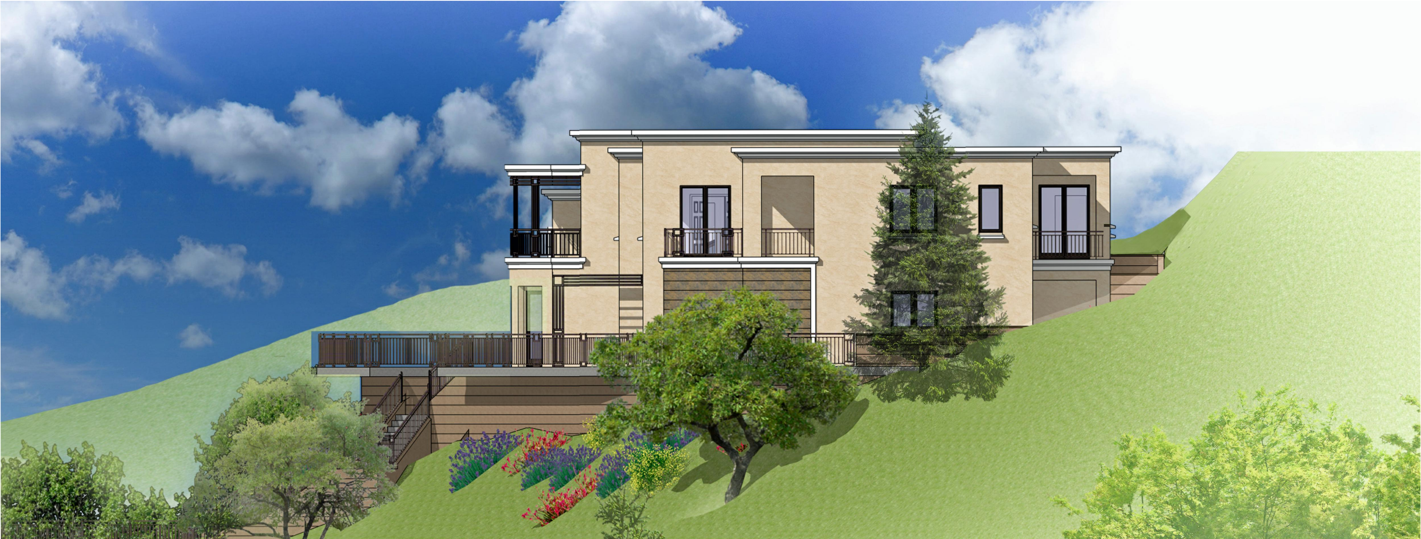
1 EAST ELEVATION 3/16" = 1'-0"

EDWARD HAGOBIAN & ASSOC. INCORPORATED ARCHITECTS