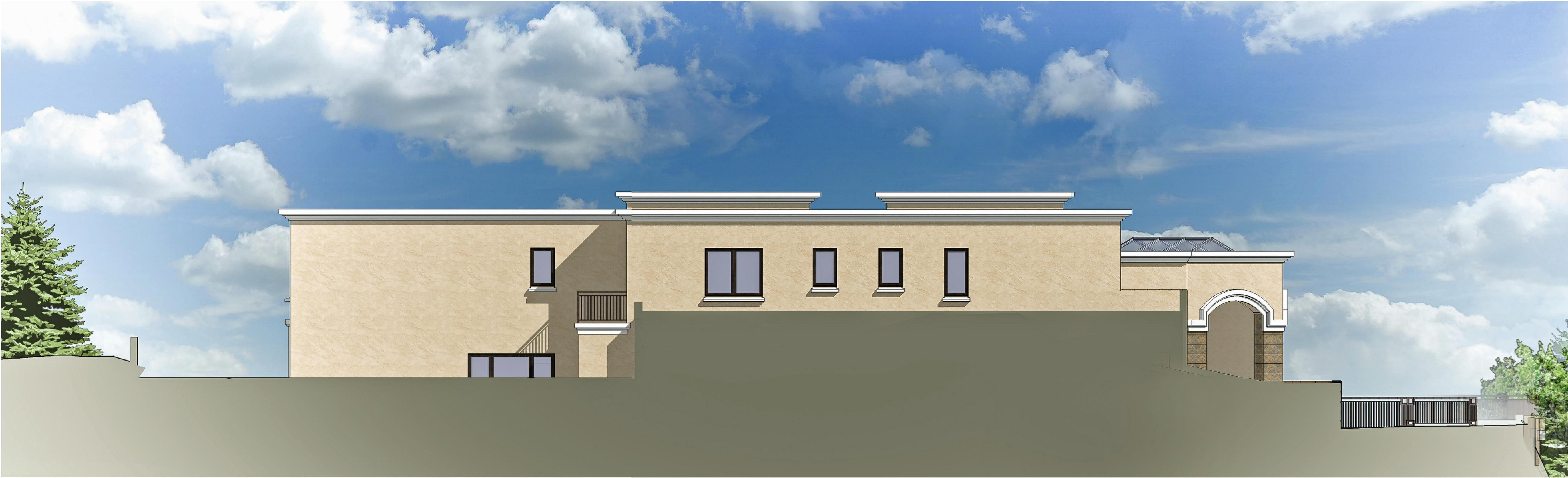
2 NORTH ELEVATION 3/16" = 1'-0"