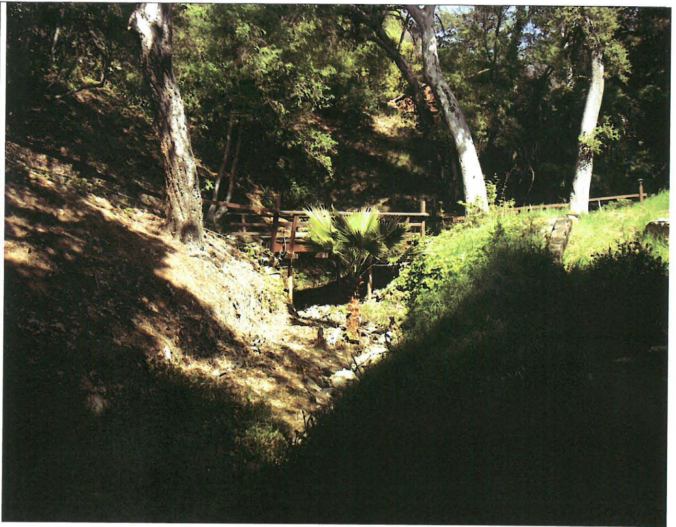
Photo 3. View of creek, facing east (upstream). Note clearly defined top of bank on both sides. The large-diameter tree to the right is a coast live oak; the other two are western sycamore.