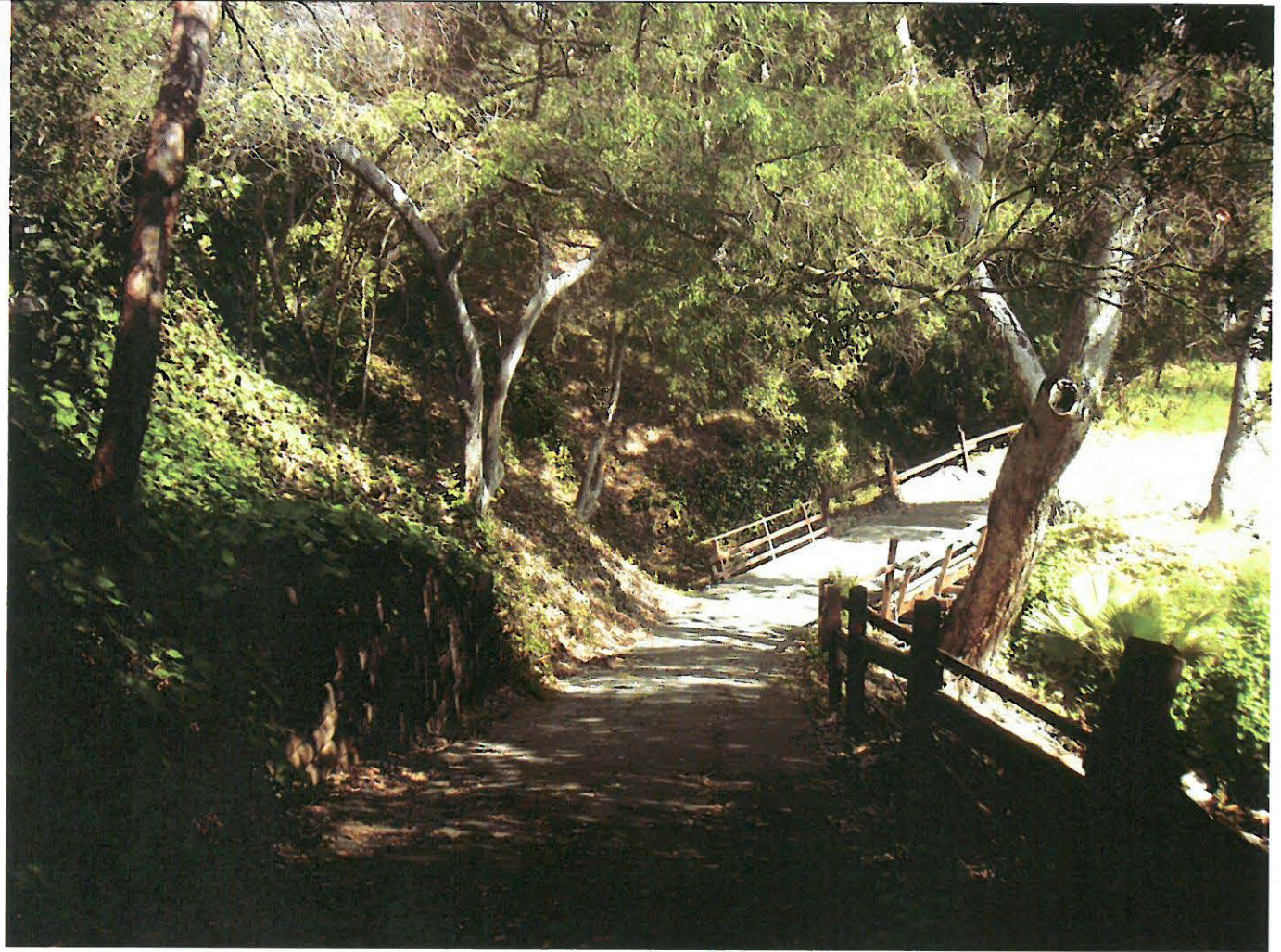
Photo 1. Viewing down the existing driveway toward the bridge over the creek (viewing generally east). Note the non-native acacia trees to left (north) and one western sycamore to right. Photo was taken from the gate at the top of the driveway.