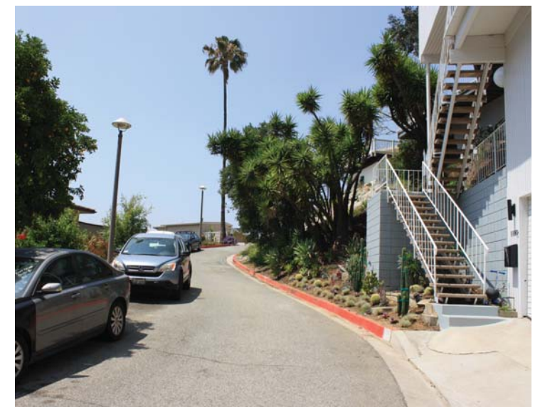
4 Neighborhood Landscape