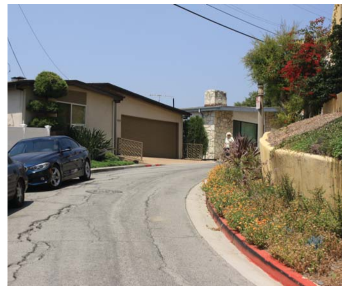
3 Neighborhood Home