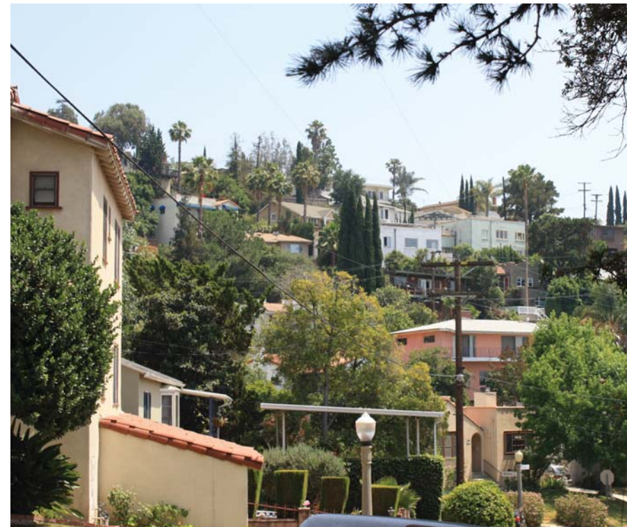
1 Neighborhood View