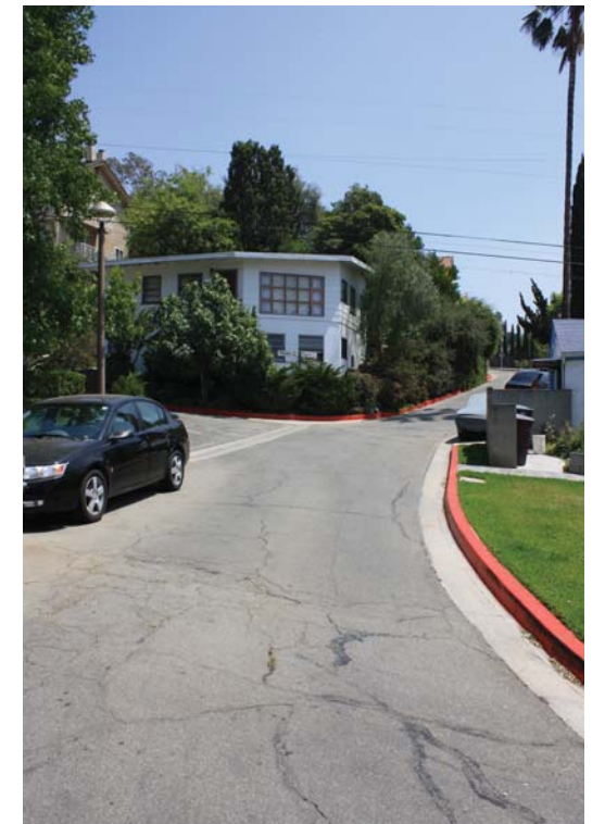
2 Neighborhood Street View