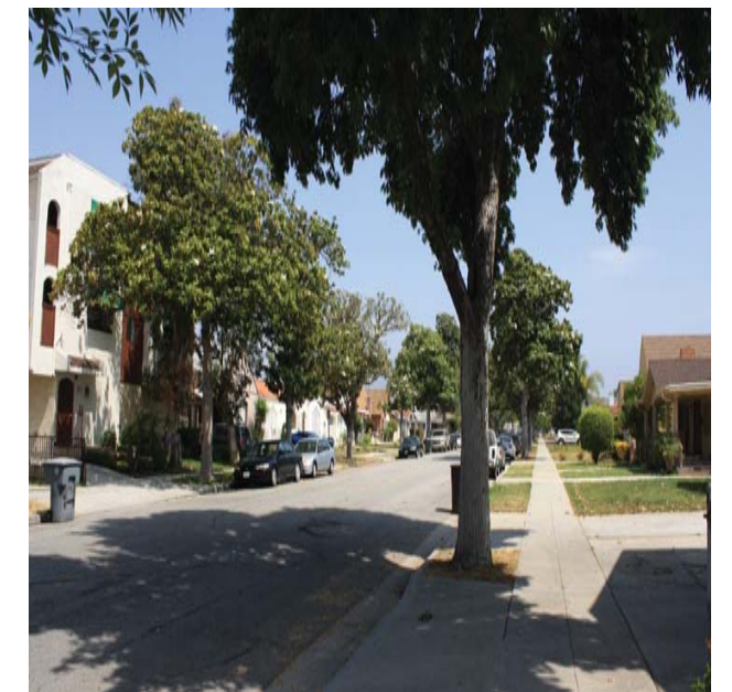
4 Neighborhood Street