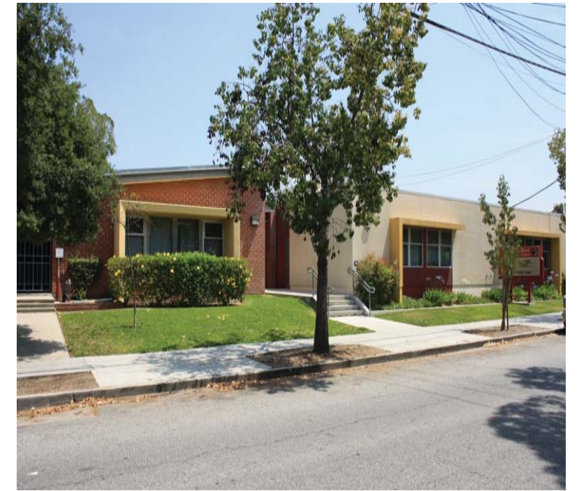
2 Horace Mann Elementary School