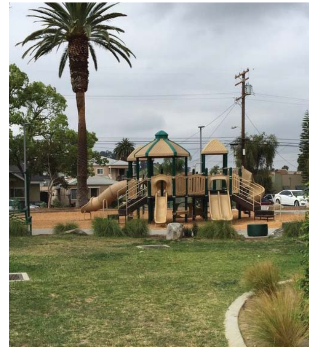
1 Maple Park