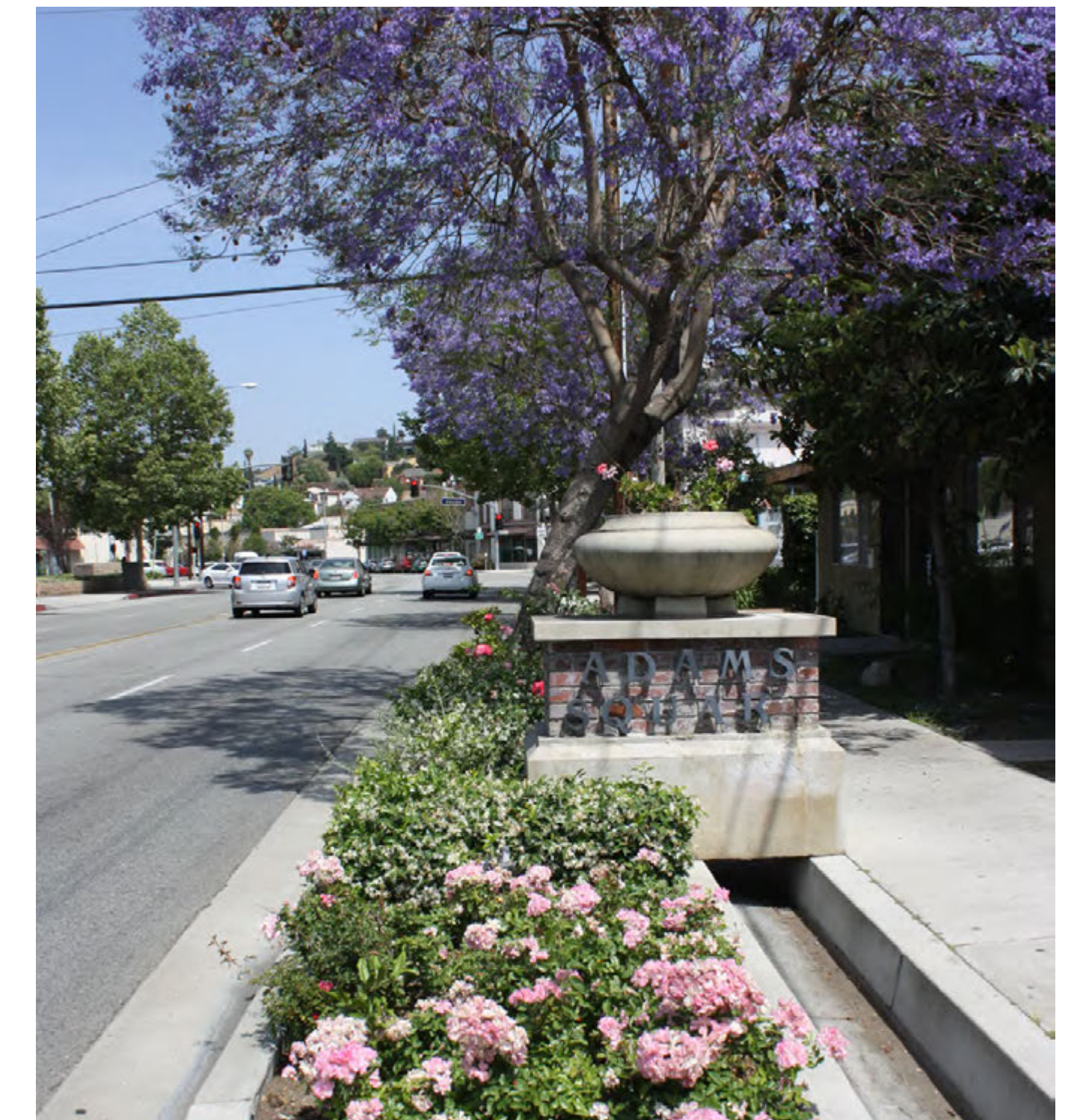
2 Chevy Chase Dr.