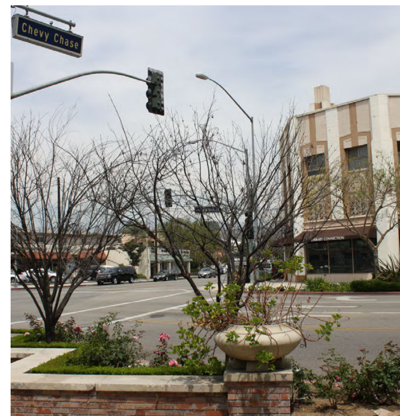
3 Library Connection