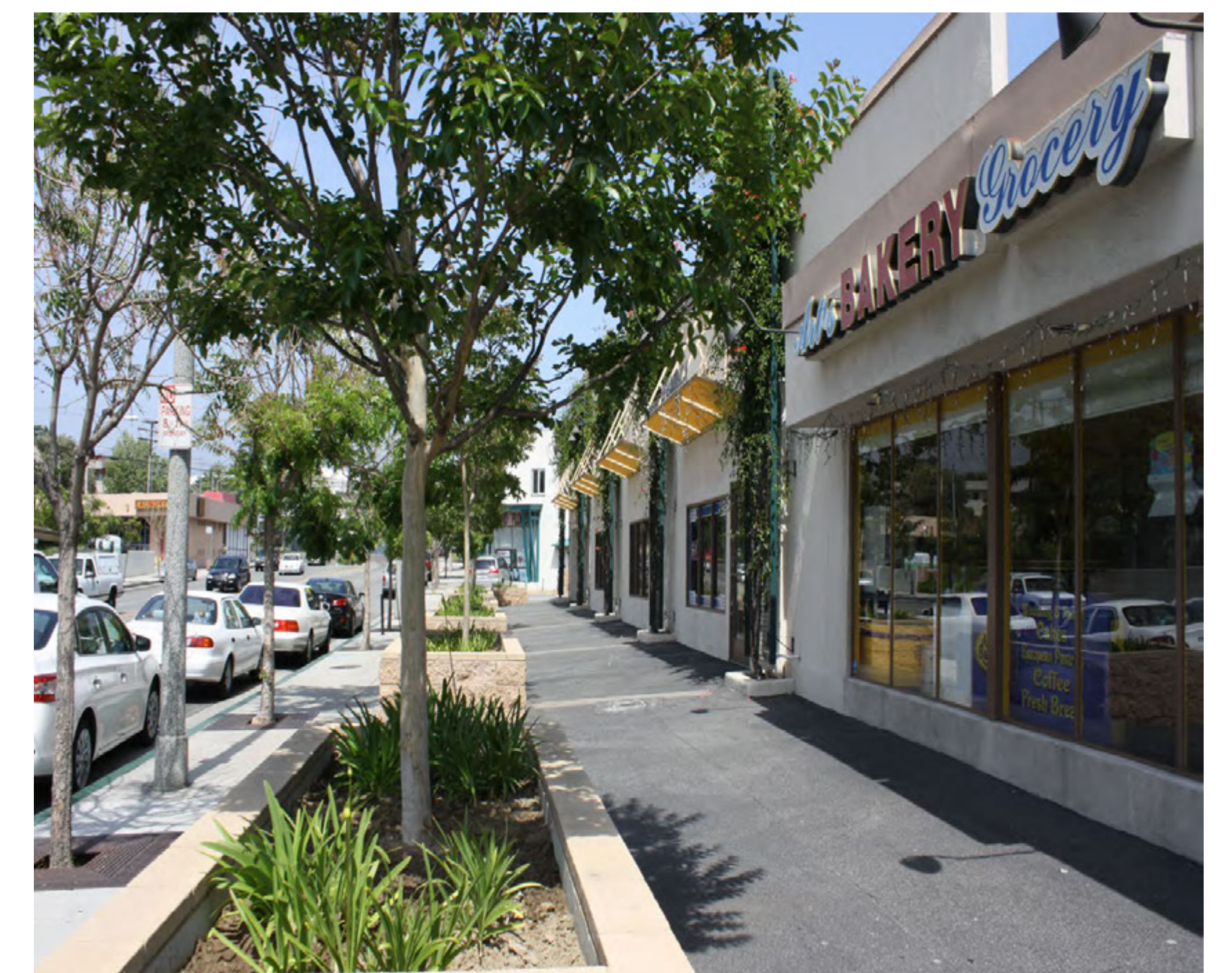
4 Chevy Chase Storefront