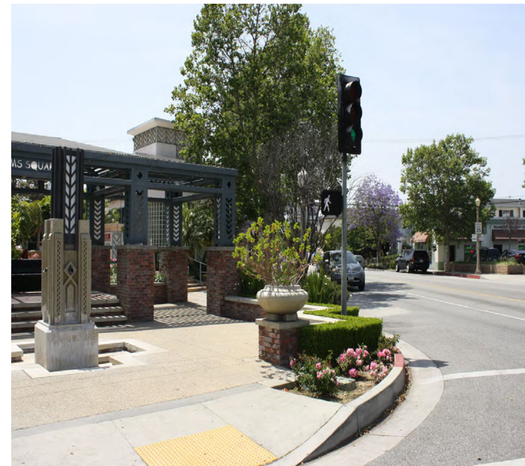
1 Adams/Chevy Chase Dr.