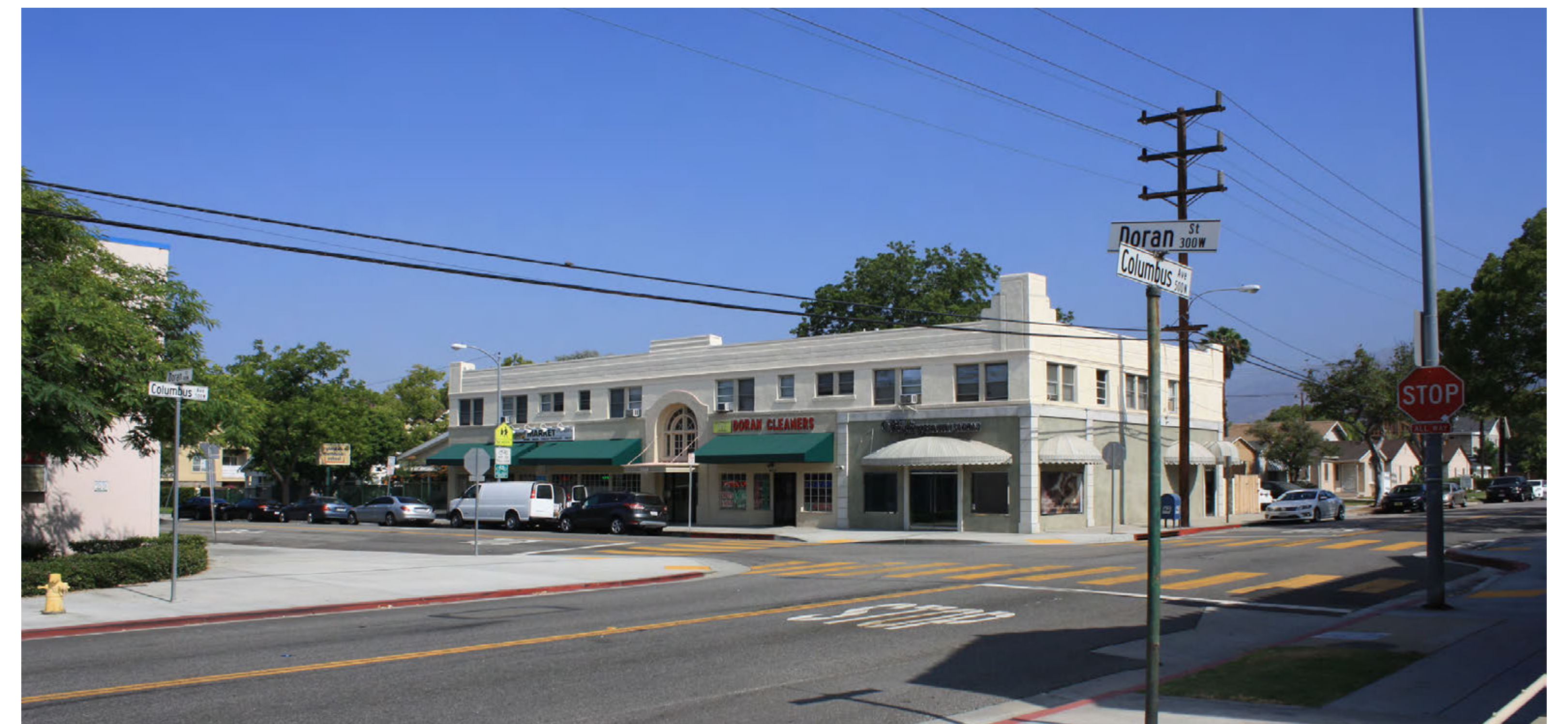
1 Doran/Columbus Intersection