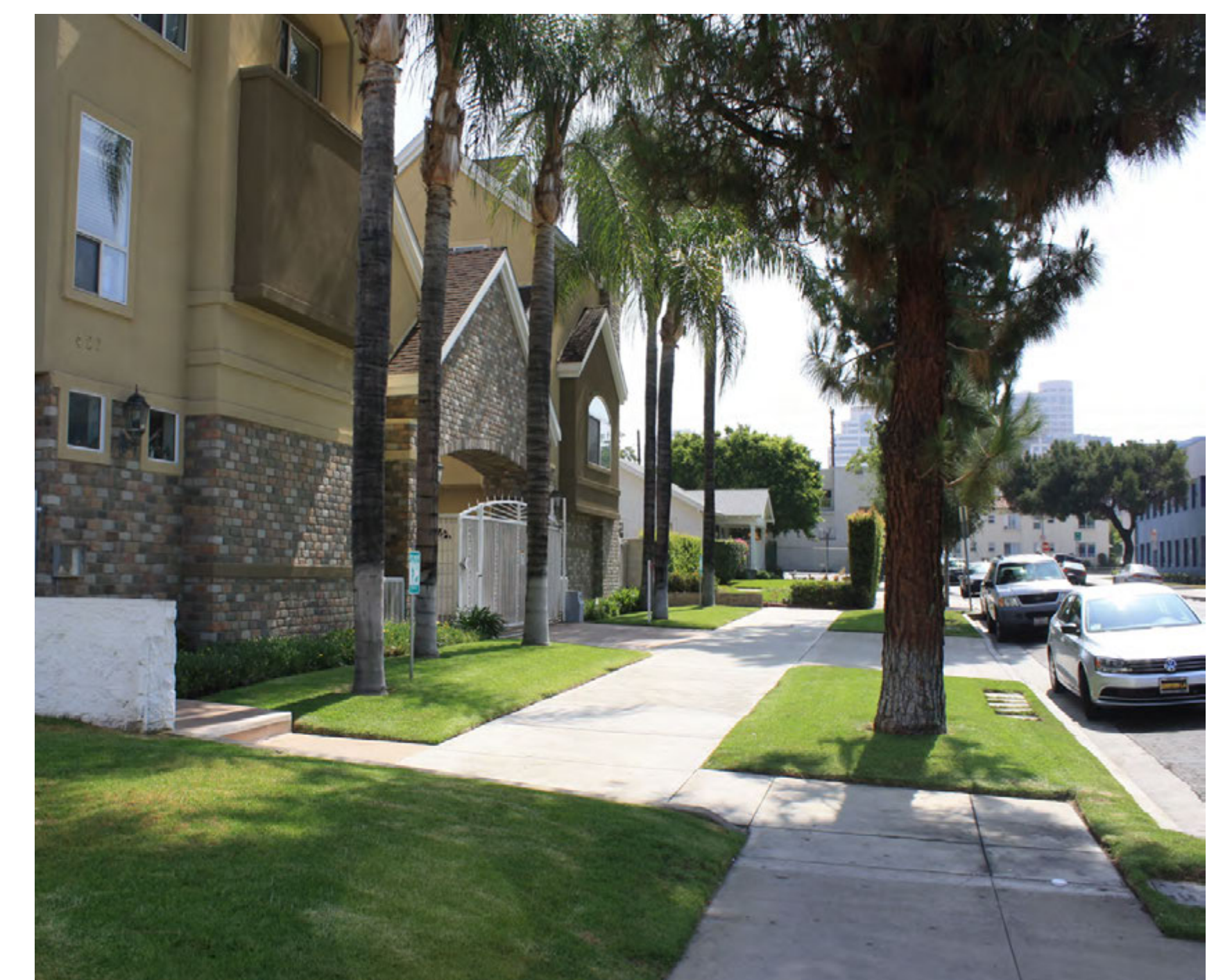
3 W Doran Street