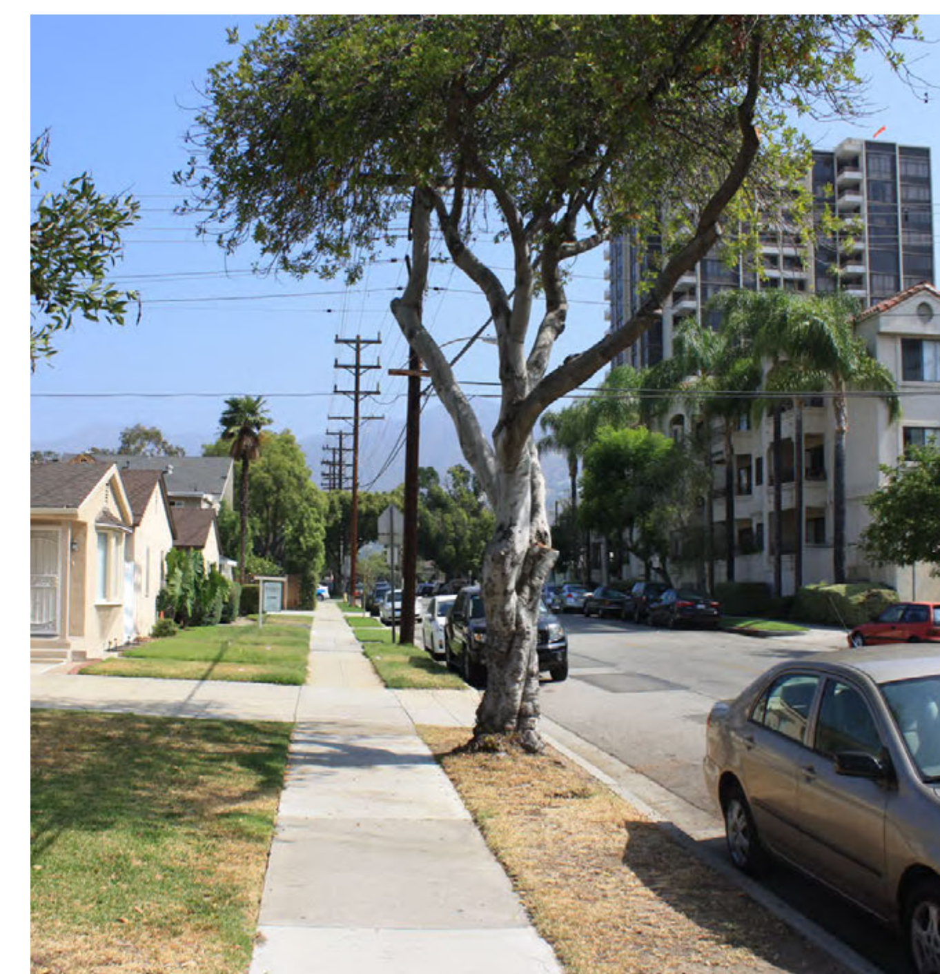
2 N Columbus Avenue