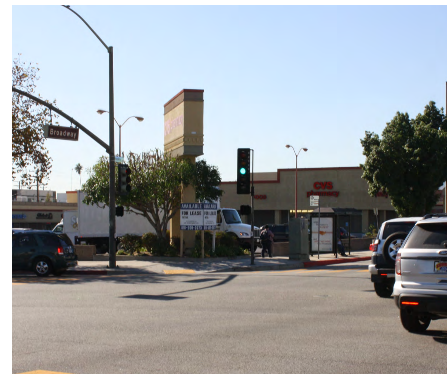
3 CVS Pharmacy Shopping Center