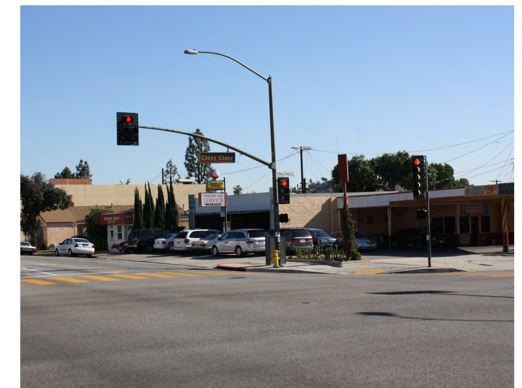
4 Broadway / Chevy Chase