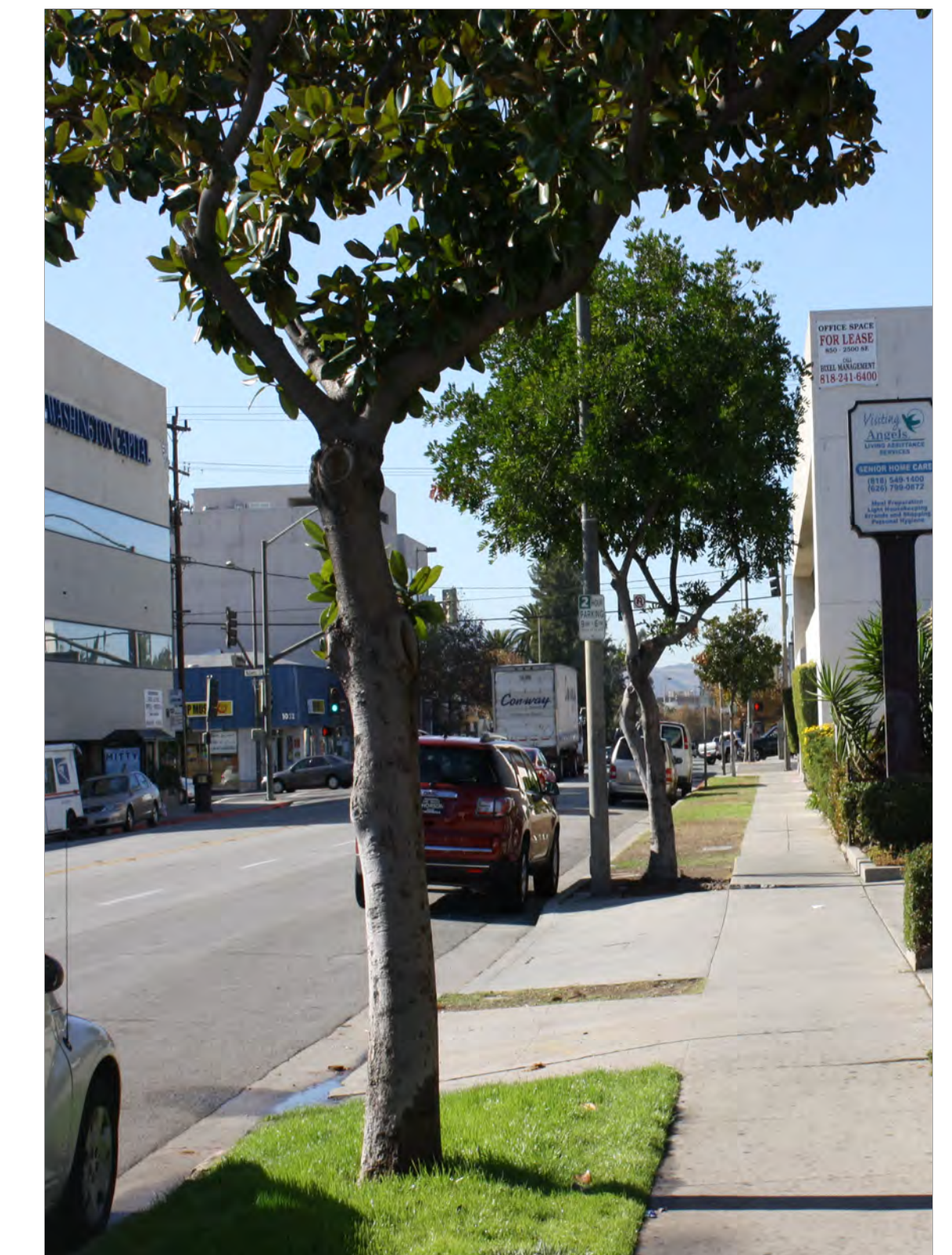
2 Broadway Sidewalk