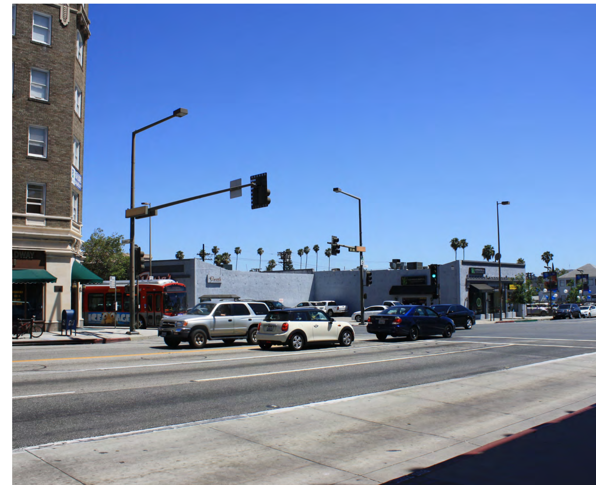
1 Broadway / Glendale