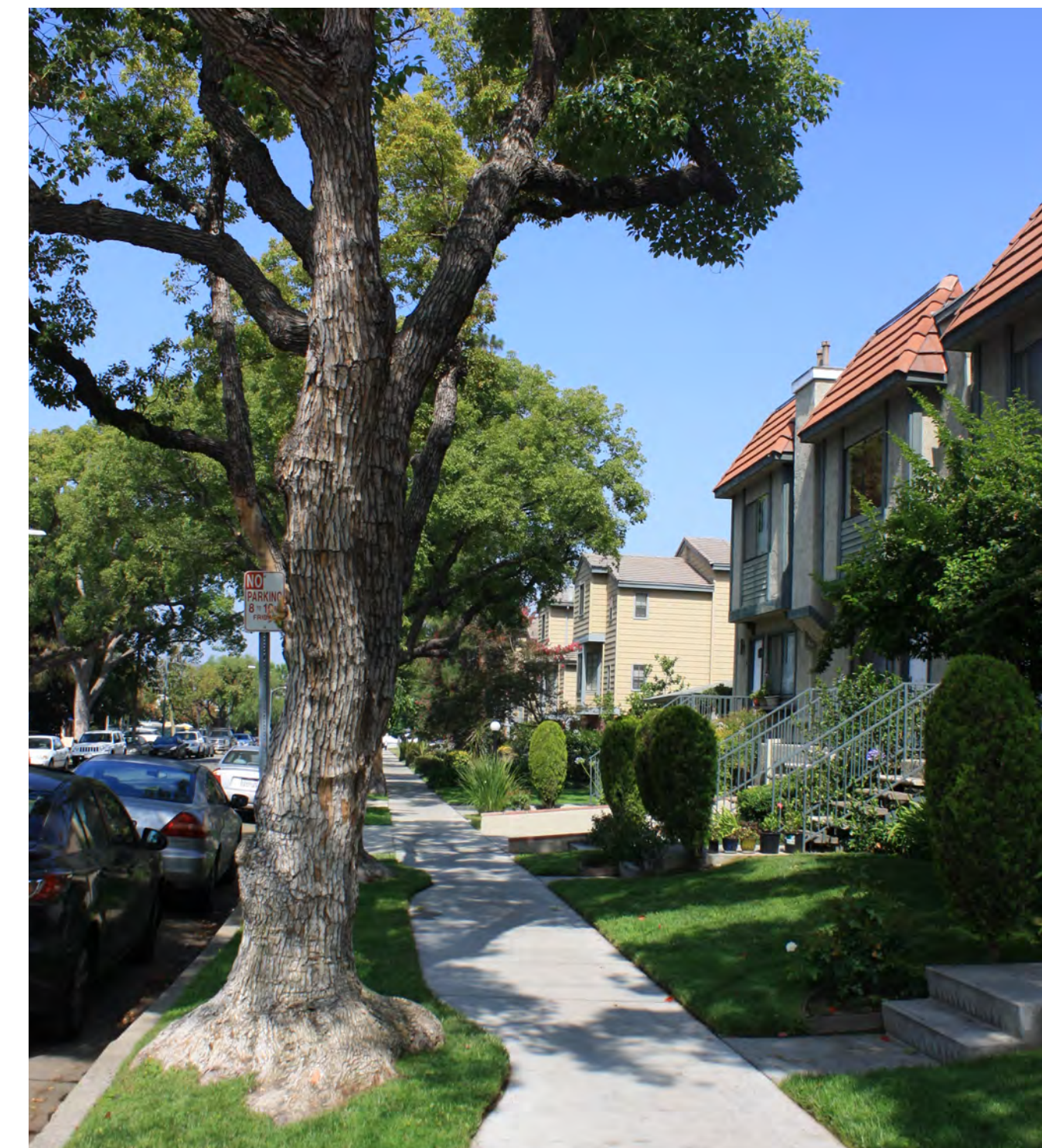
1 Pioneer Dr/Columbus Avenue