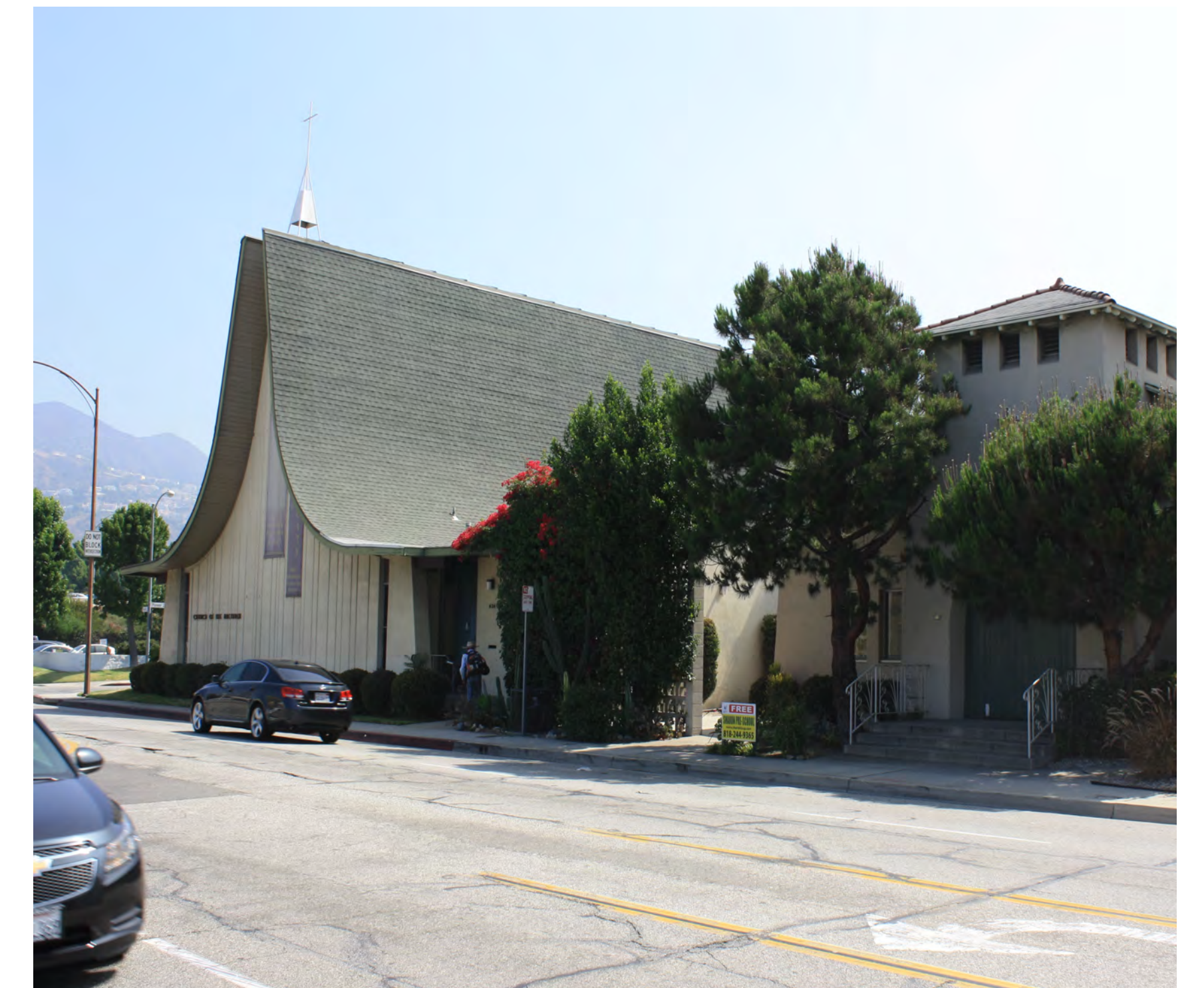
2 Pacific Avenue/Pioneer Dr