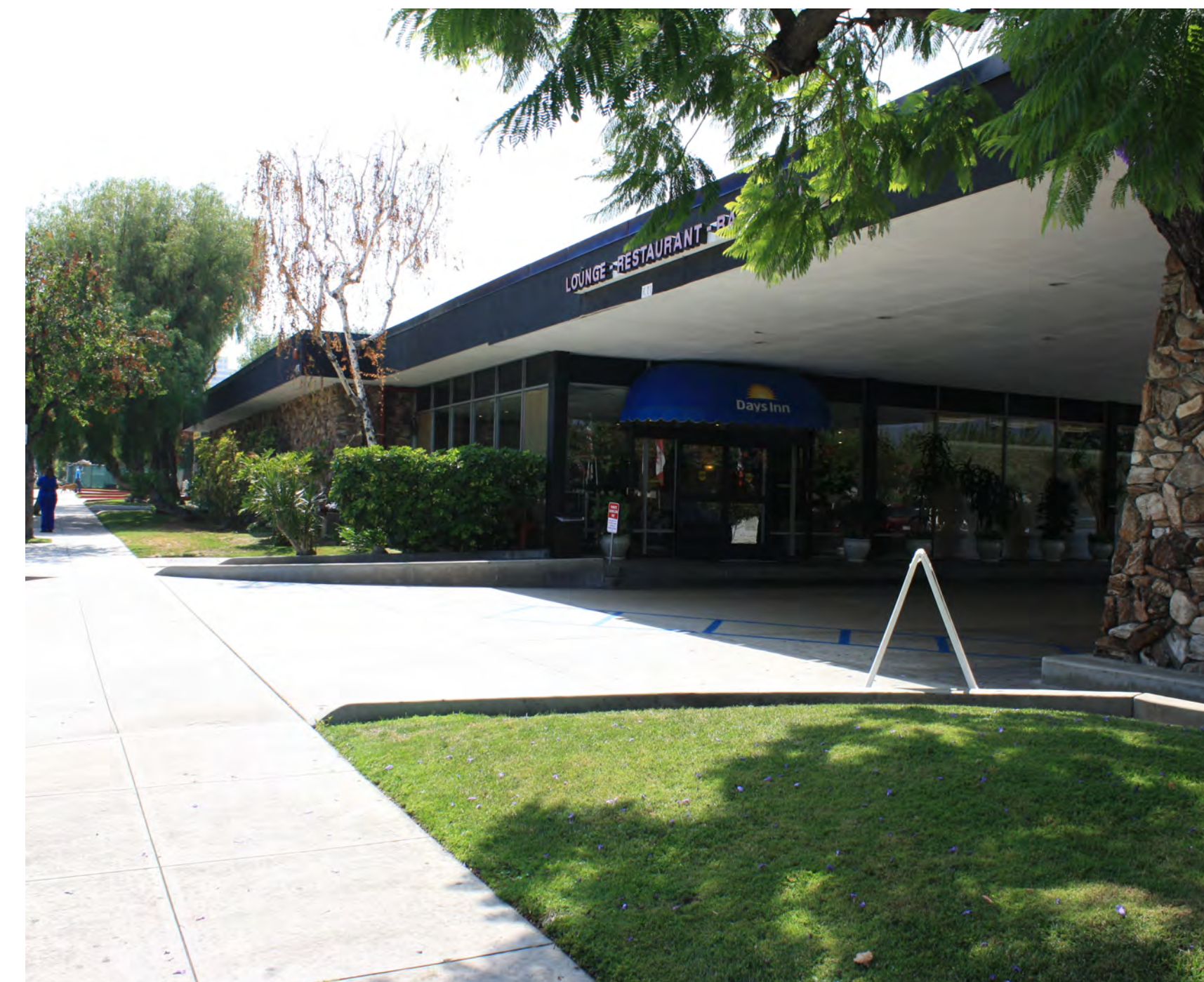
3 Pioneer Dr/Pacific Avenue