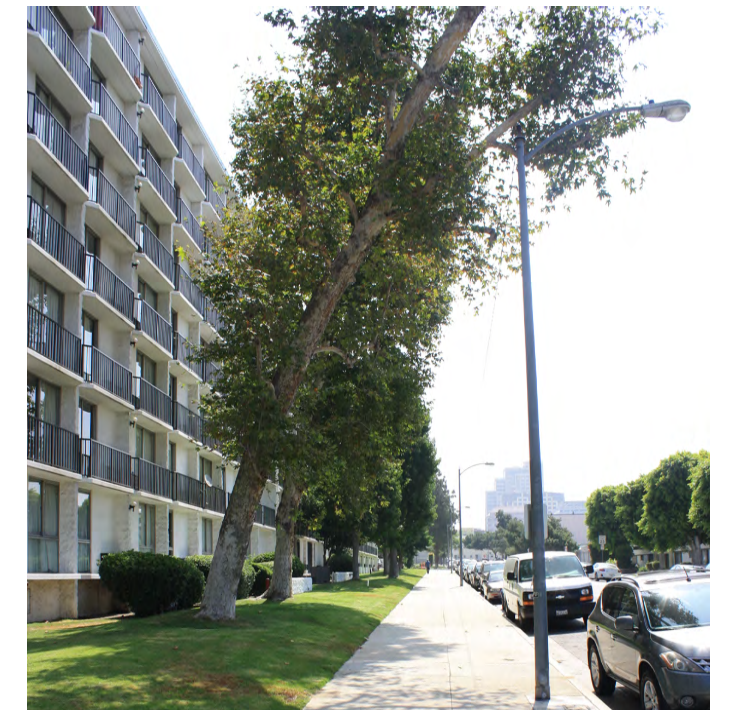
4 Doran/Pacific Avenue