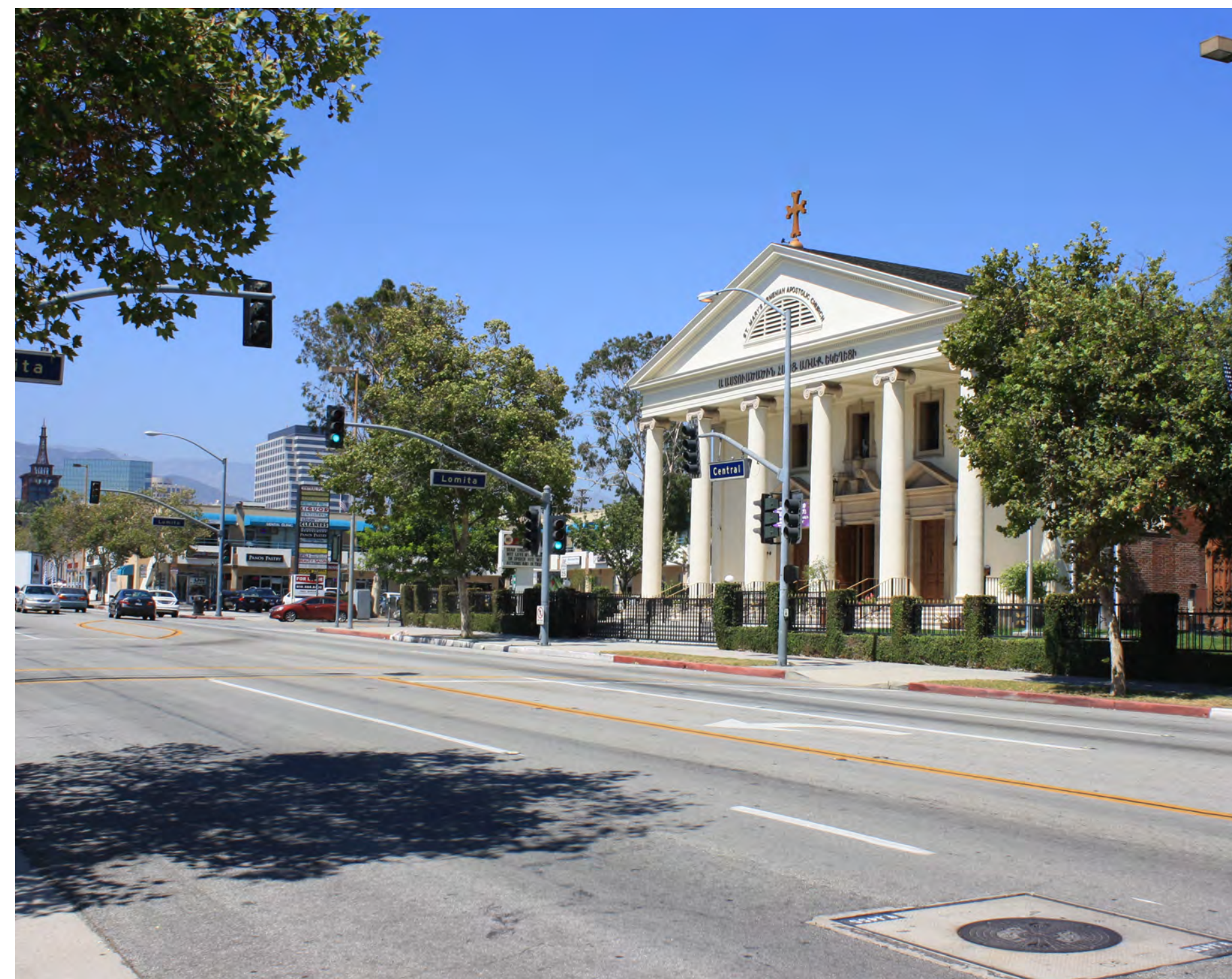
1 St. Mary's Armenian Church