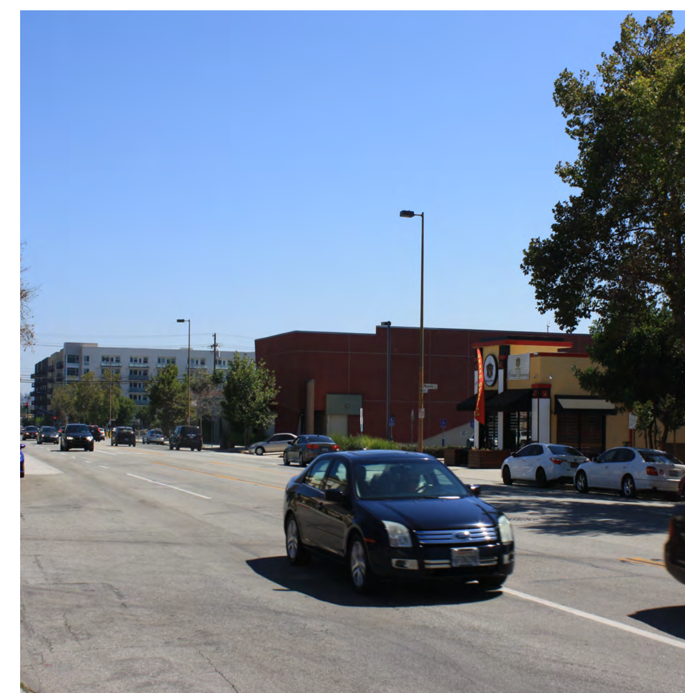
4 Central / Magnolia