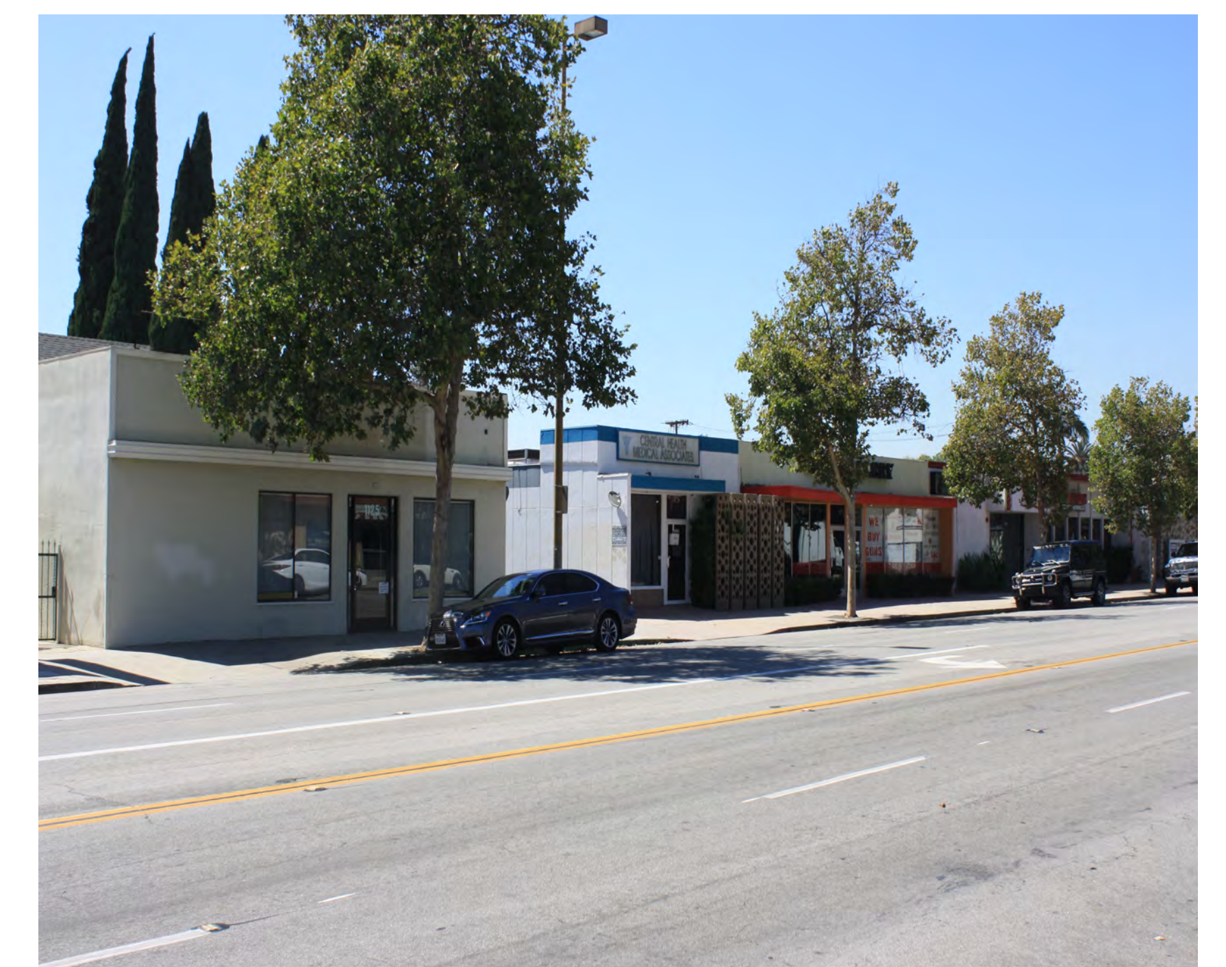
6 Central Between Chevy Chase / Palmer