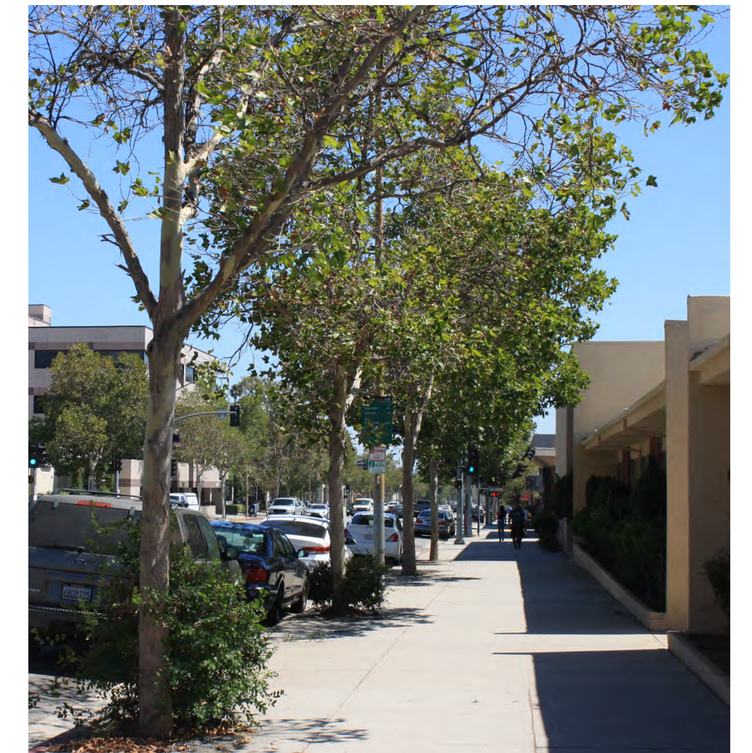
5 Central Sidewalk Condition