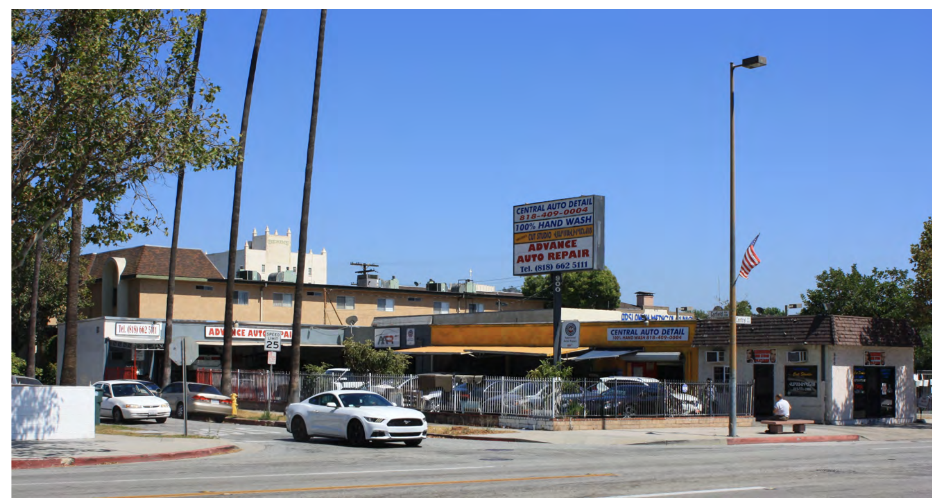
2 Central / Garfield