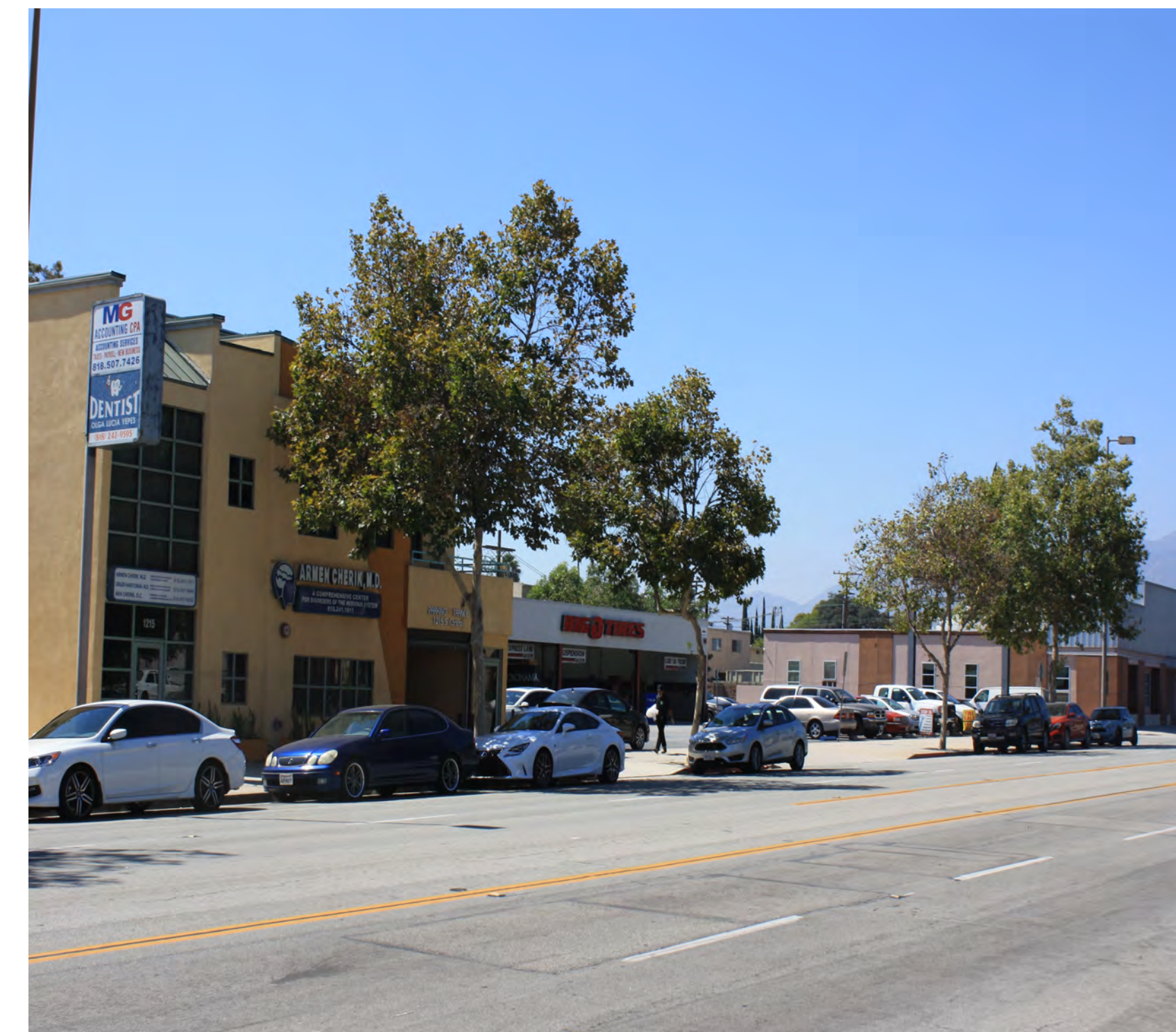
3 Central / Palmer