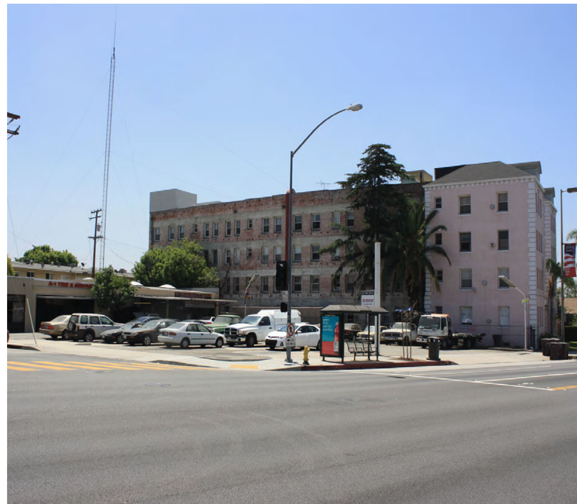
1 Glendale / Lomita