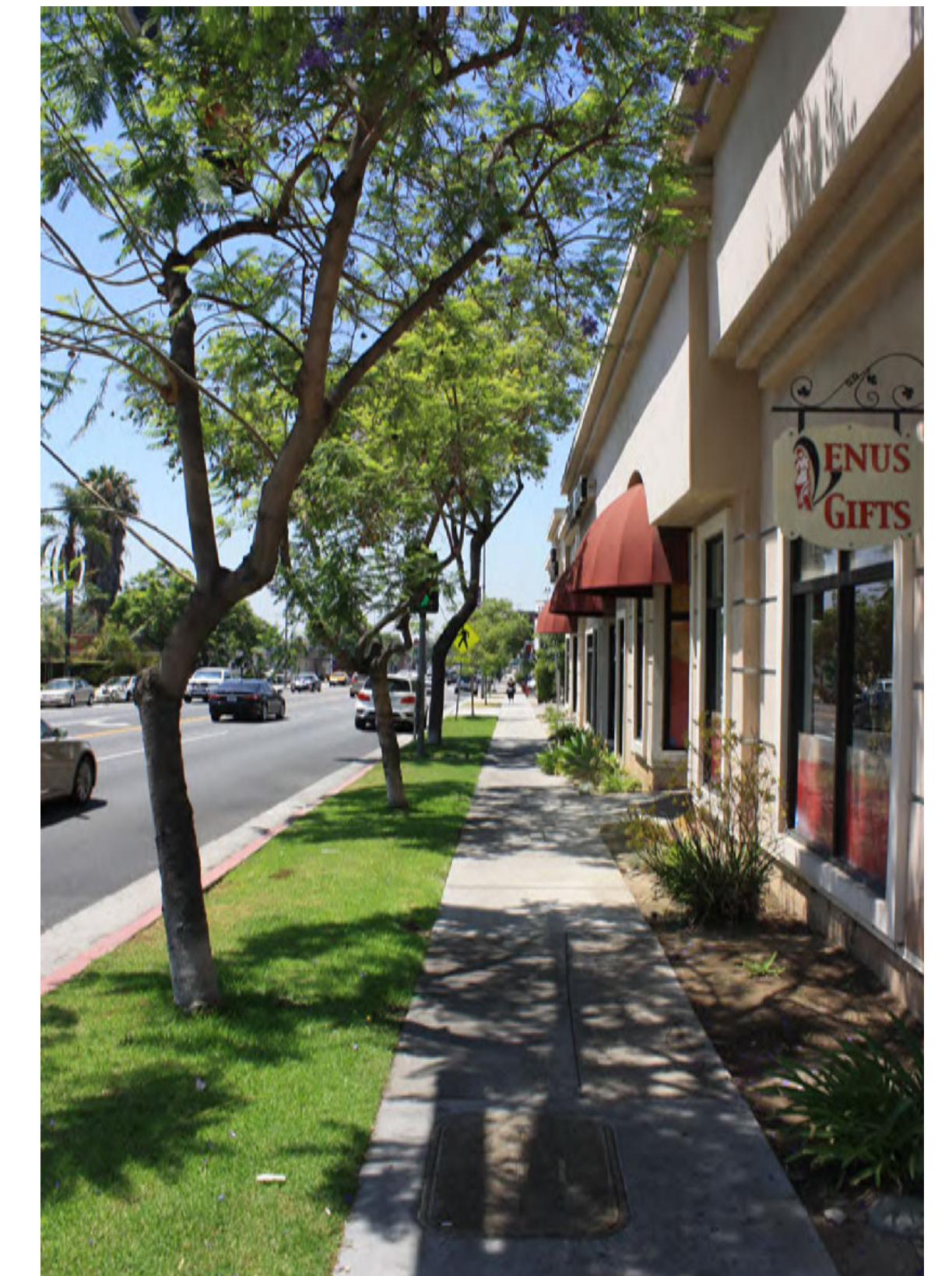
5 South Glendale Sidewalk