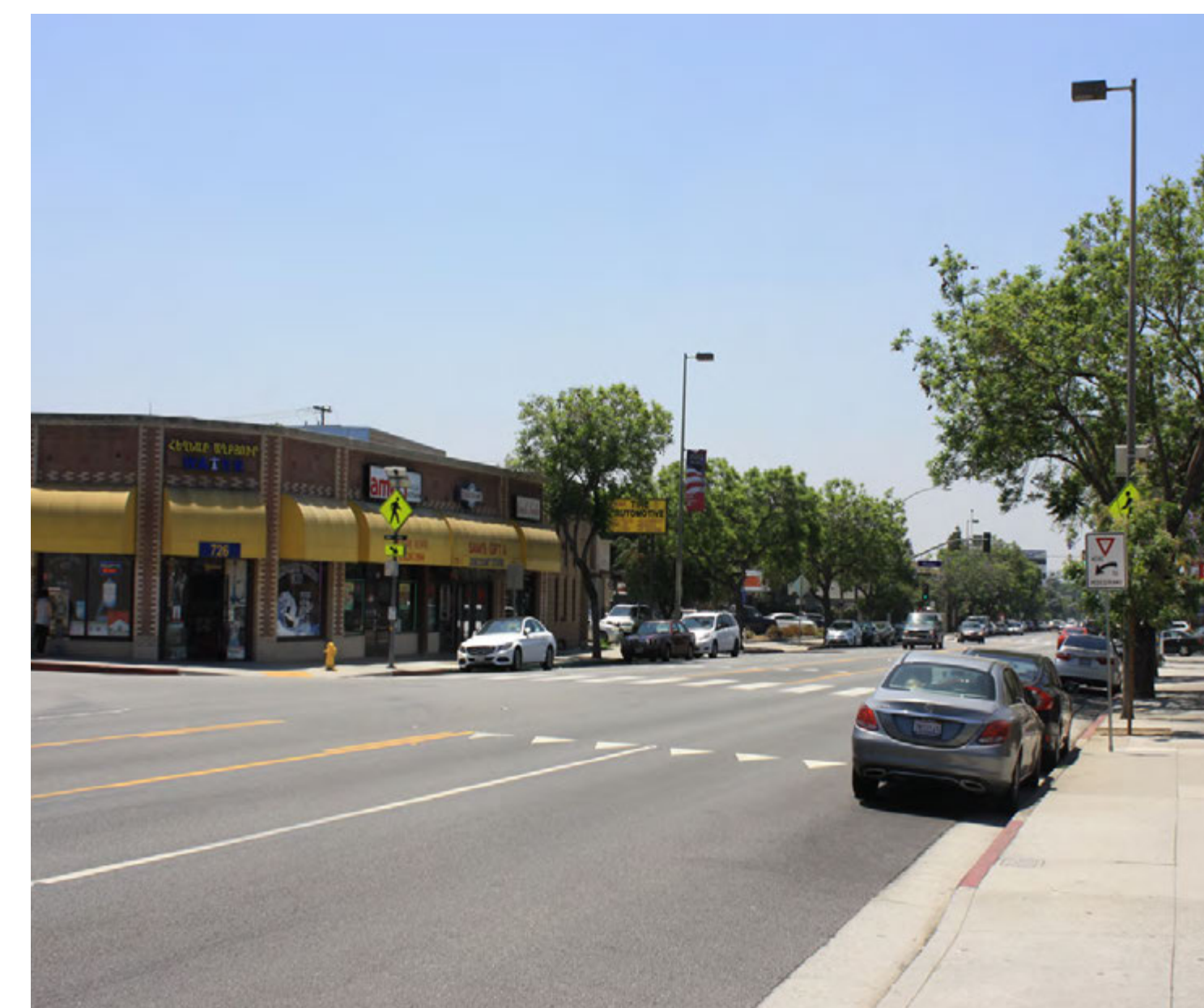
4 Glendale / Raleigh