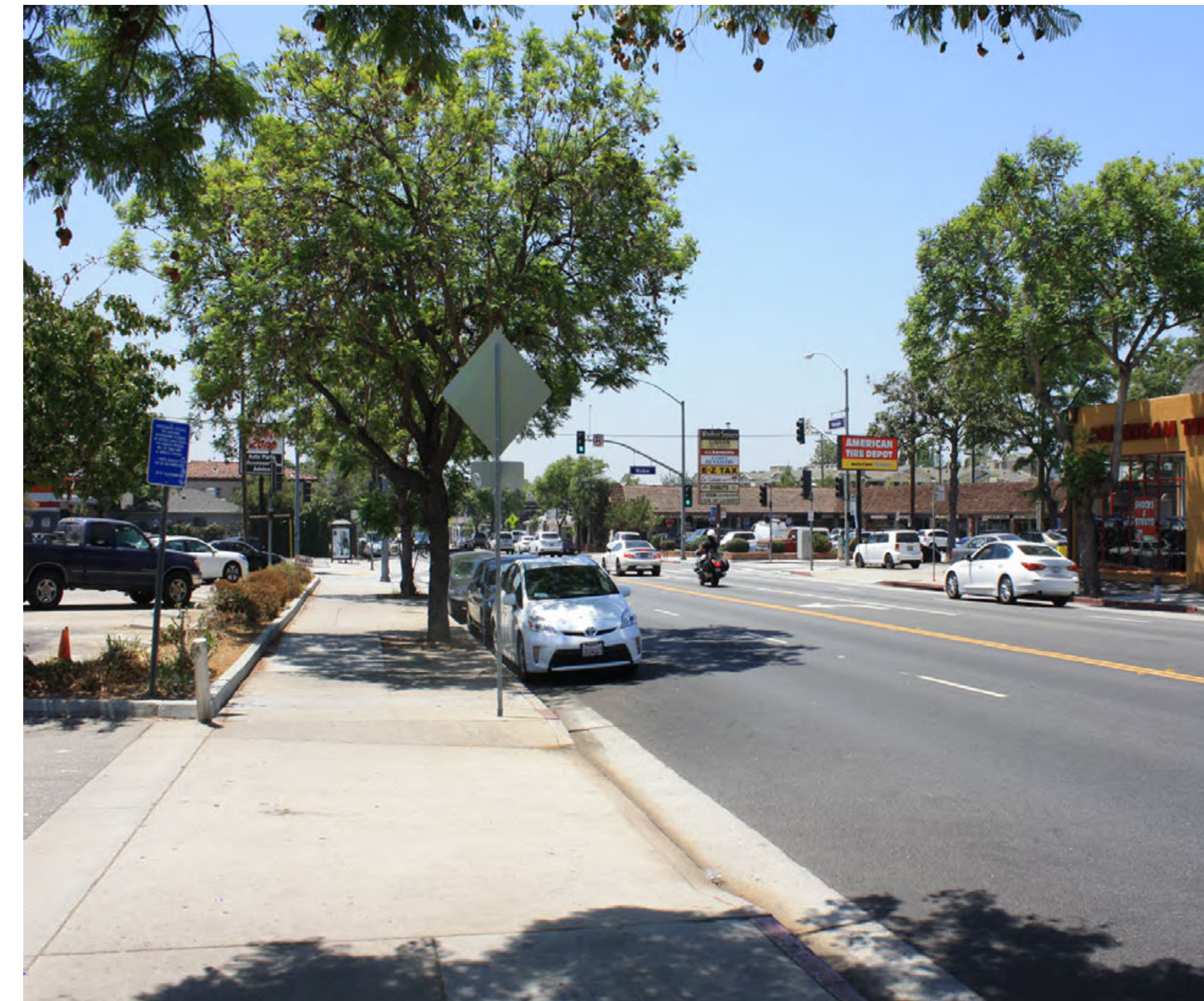
3 Glendale / Windsor