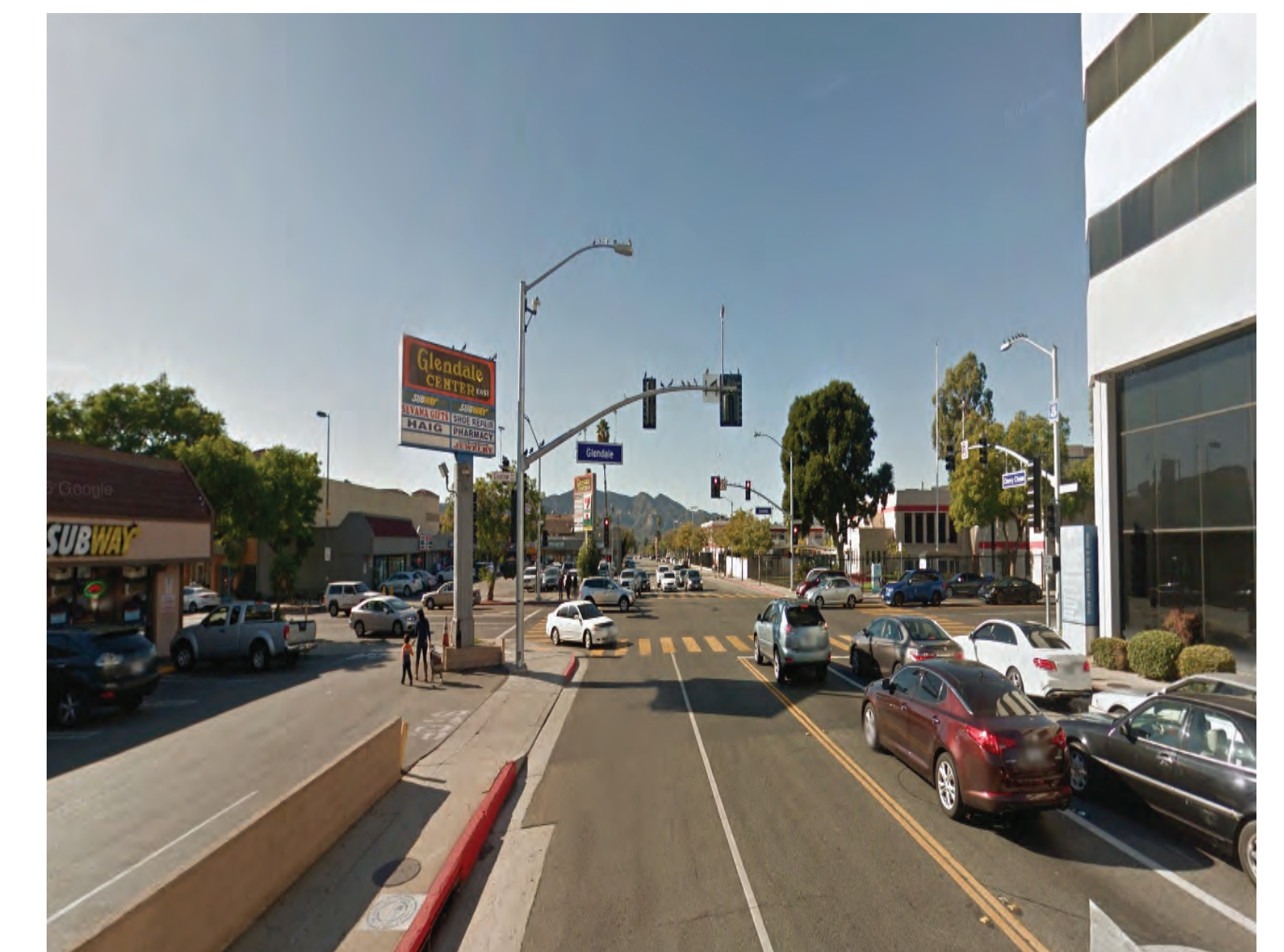
6 Glendale / Chevy Chase