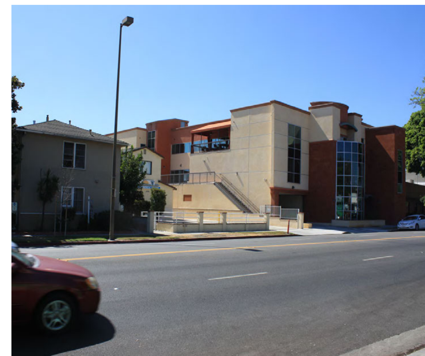
4 New v.s. Old