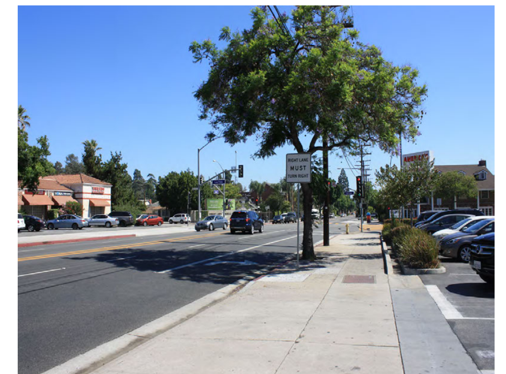
6 Glendale / Cerritos