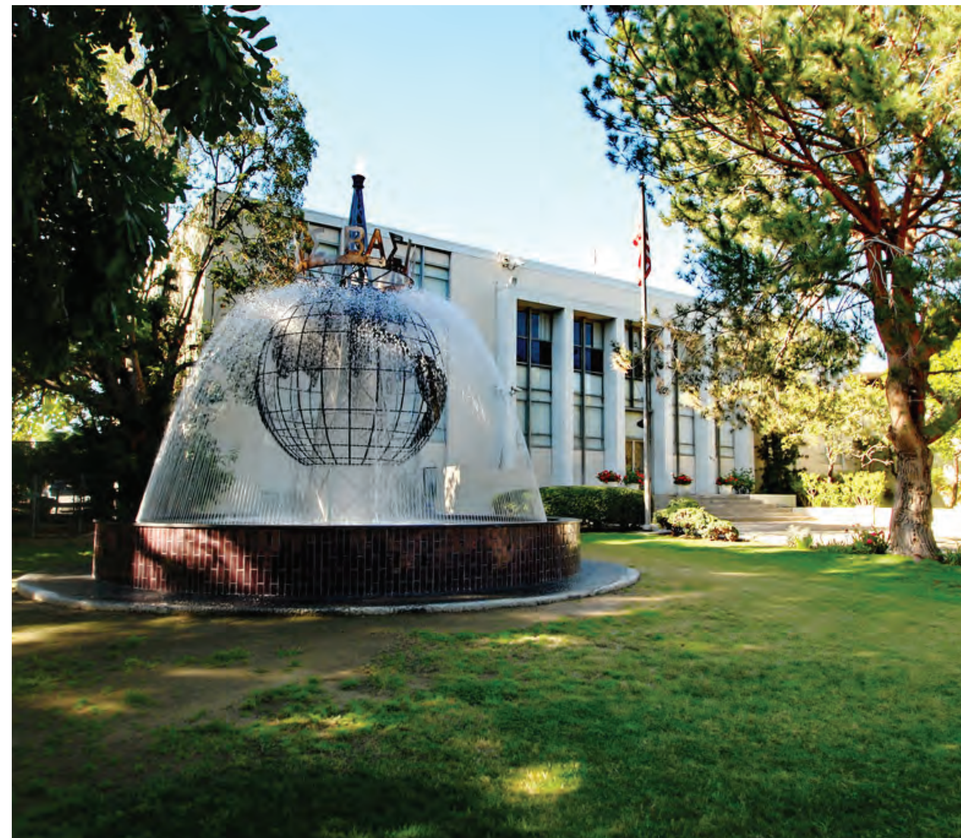
1 Faith Center Church