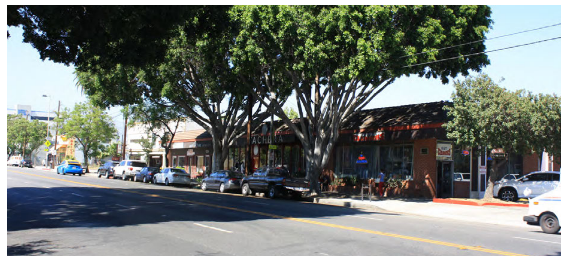
2 Glendale Avenue Storefronts