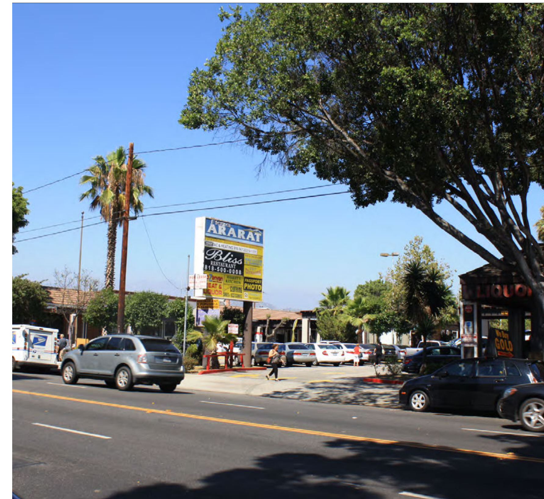
3 Plaza Ararat