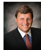
Mayor Ara Najarian