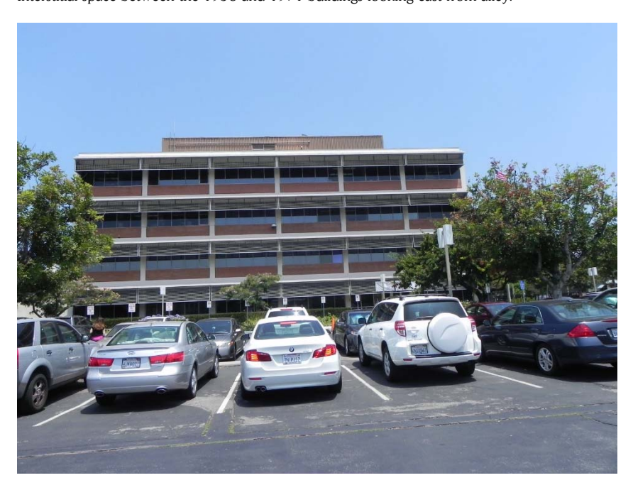
South (primary) façade of the 1971 administration building looking north from the parking lot.