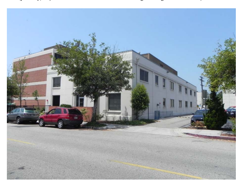
1938 warehouse building looking southwest from N. Jackson Street.