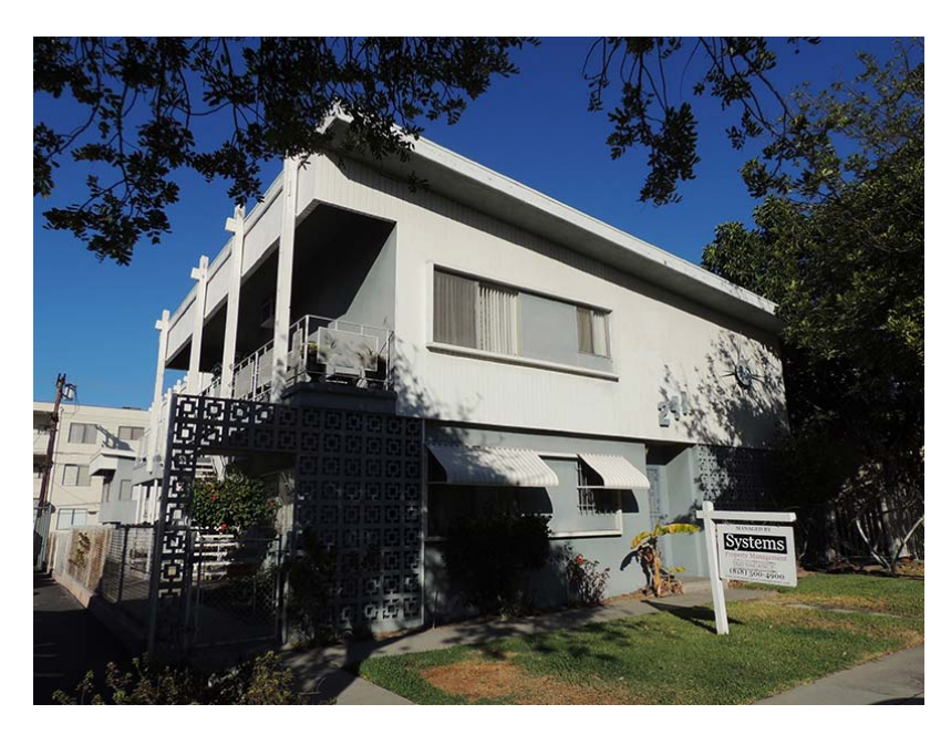
East façade of the apartment building looking northwest from N. Jackson Street.