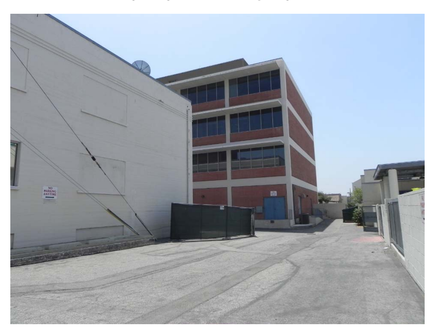
Looking south from alley to north façade of the 1971 administration building.