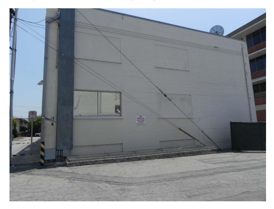
West façade of the 1938 warehouse building looking east from alley.