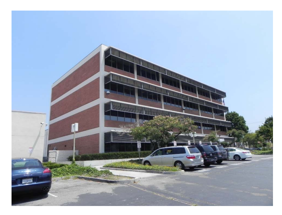
1971 administration building looking northeast from the parking lot.