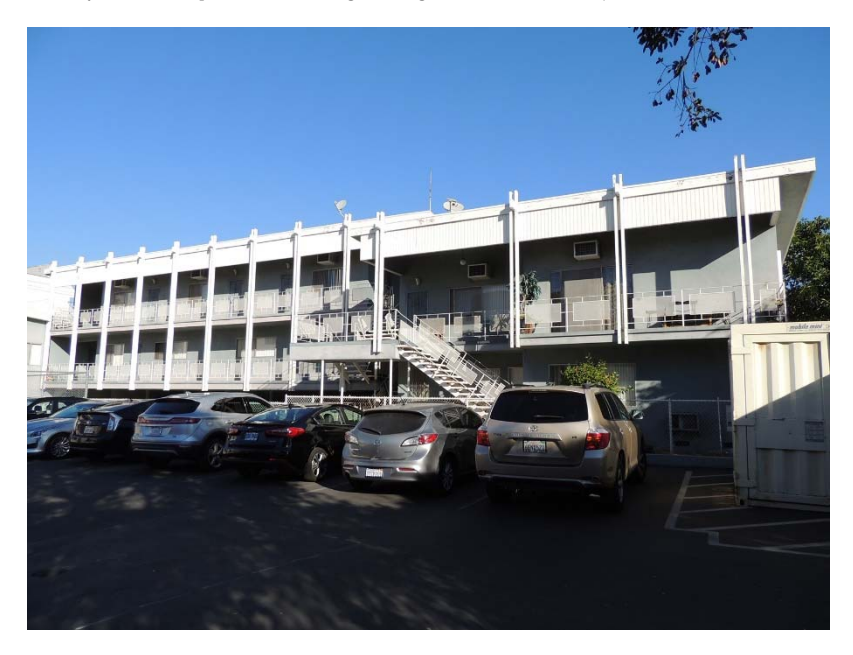
South façade of the apartment building looking north from the neighboring parking lot.