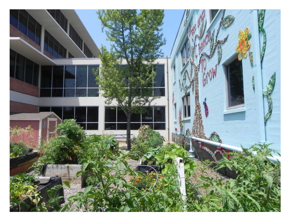
Interstitial space between 1938 and 1971 buildings with connecting hyphen. Looking west from N. Jackson Street.