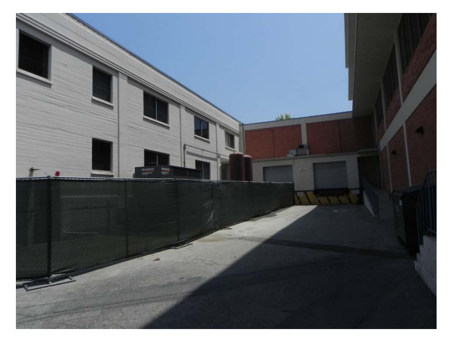
Interstitial space between the 1938 and 1971 buildings looking east from alley.