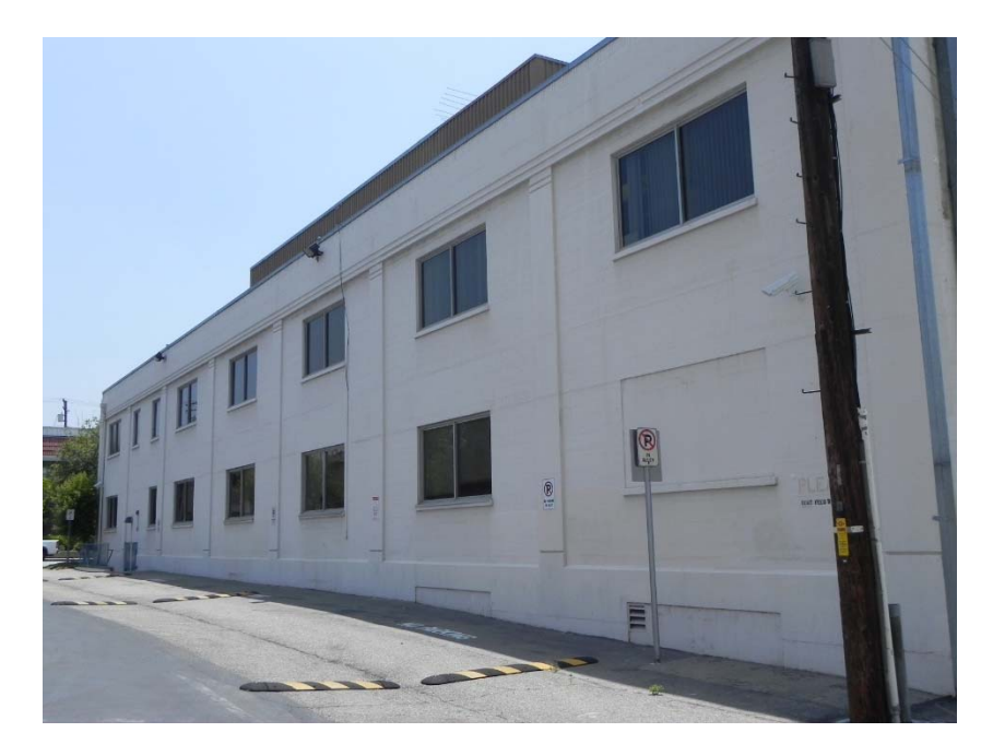
North façade of the 1938 warehouse building looking southeast from alley.