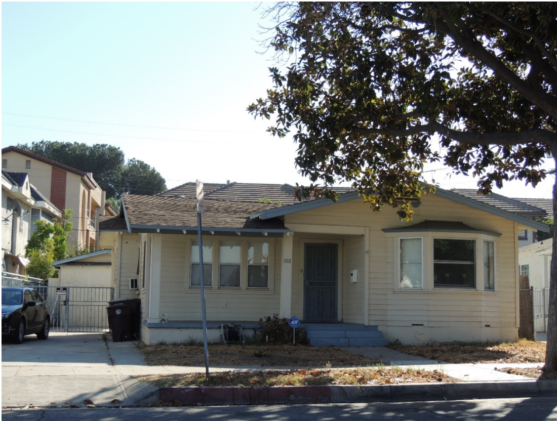
1118 N. Columbus Avenue, view facing southeast.