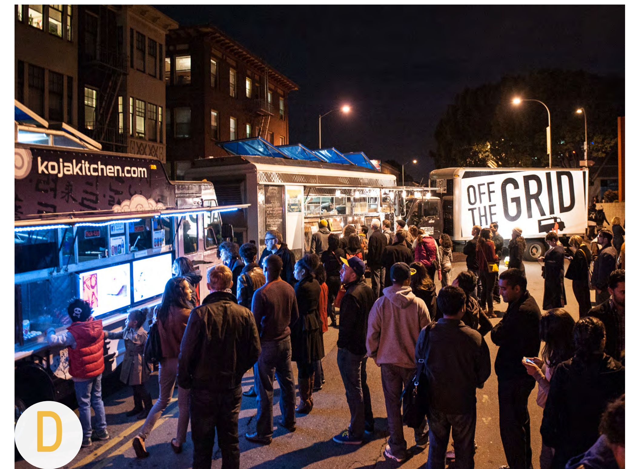
D Food Truck Festival