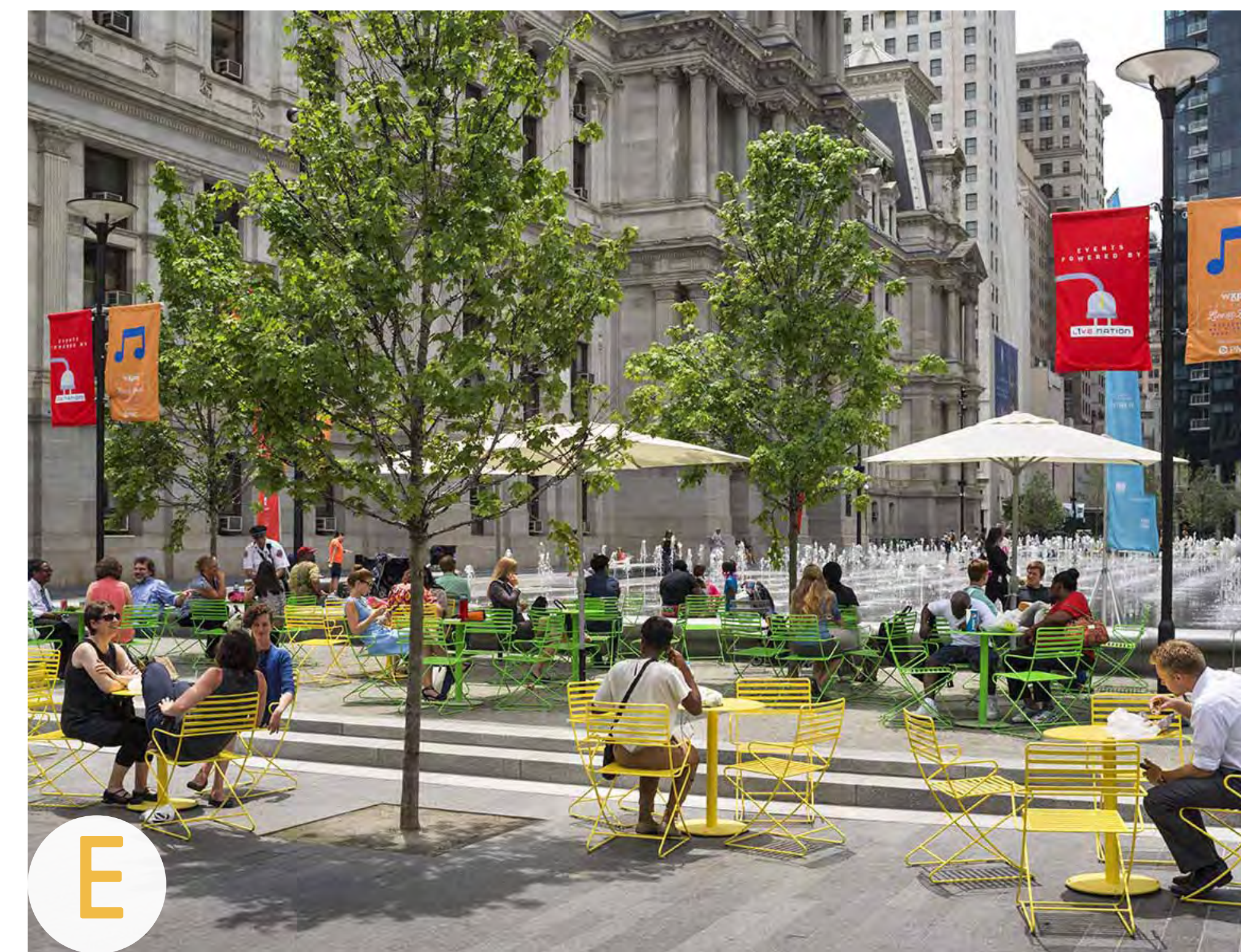
E Café Plaza