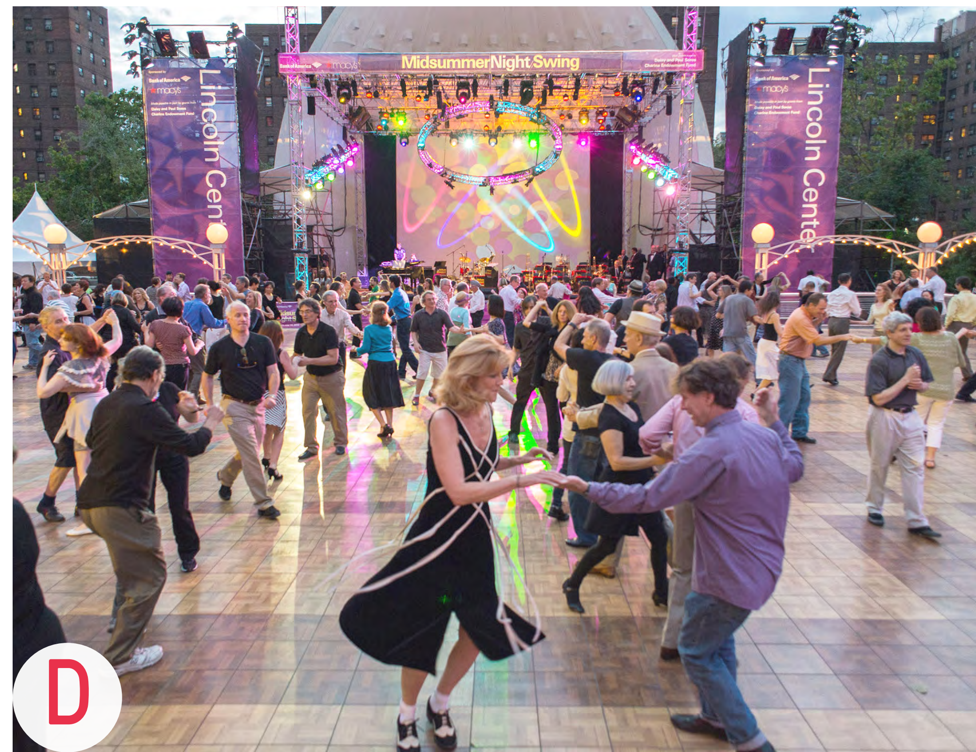
D Themed/Cultural Festival