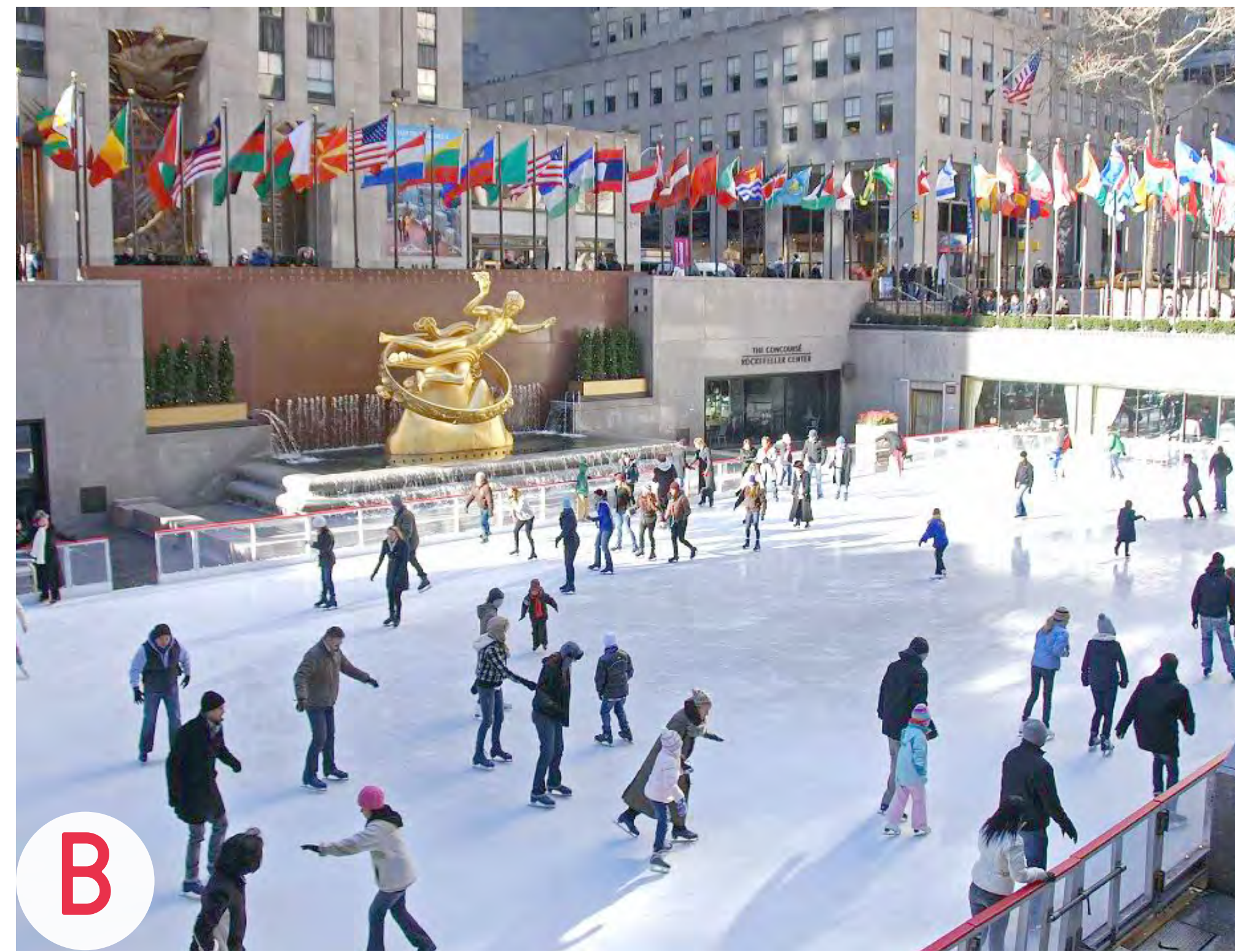
B Ice Skating