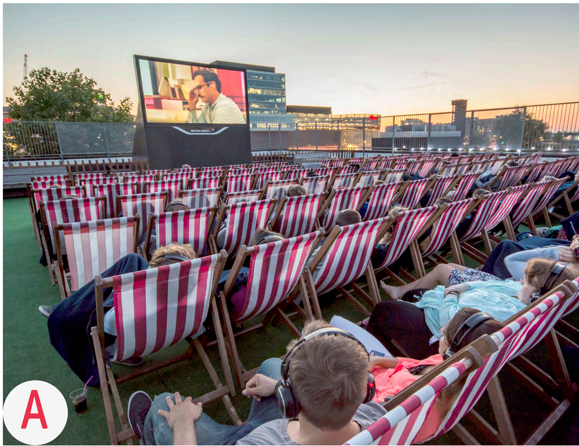
A Outdoor Movie

2. When thinking about future food and eating opportunities at Central Park, which of the following options appeal most to you?