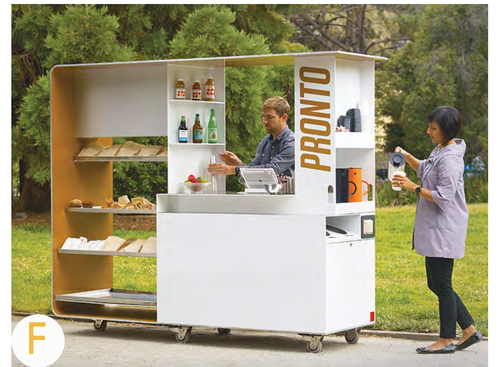
F Retail/Food+Beverage Kiosk