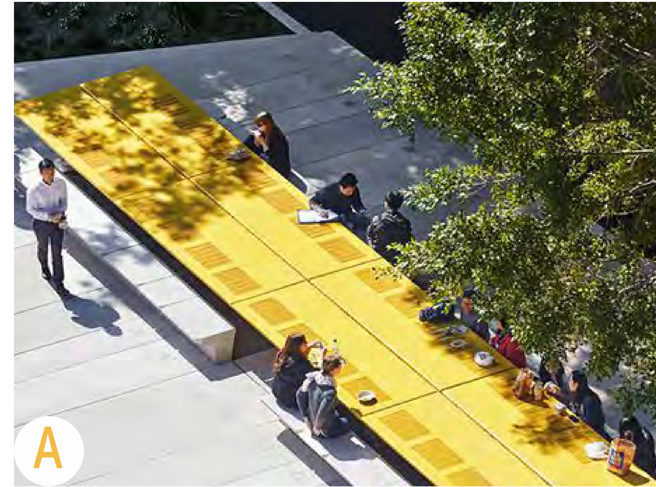
A Communal Picnic Table