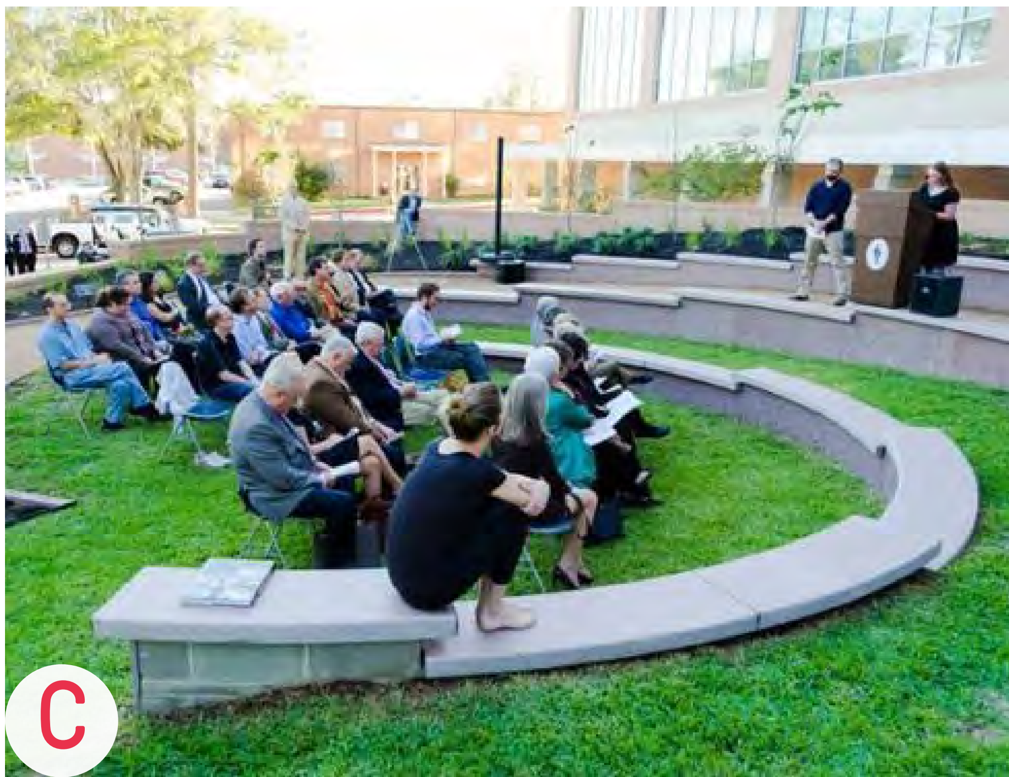
C Educational Outdoor Class