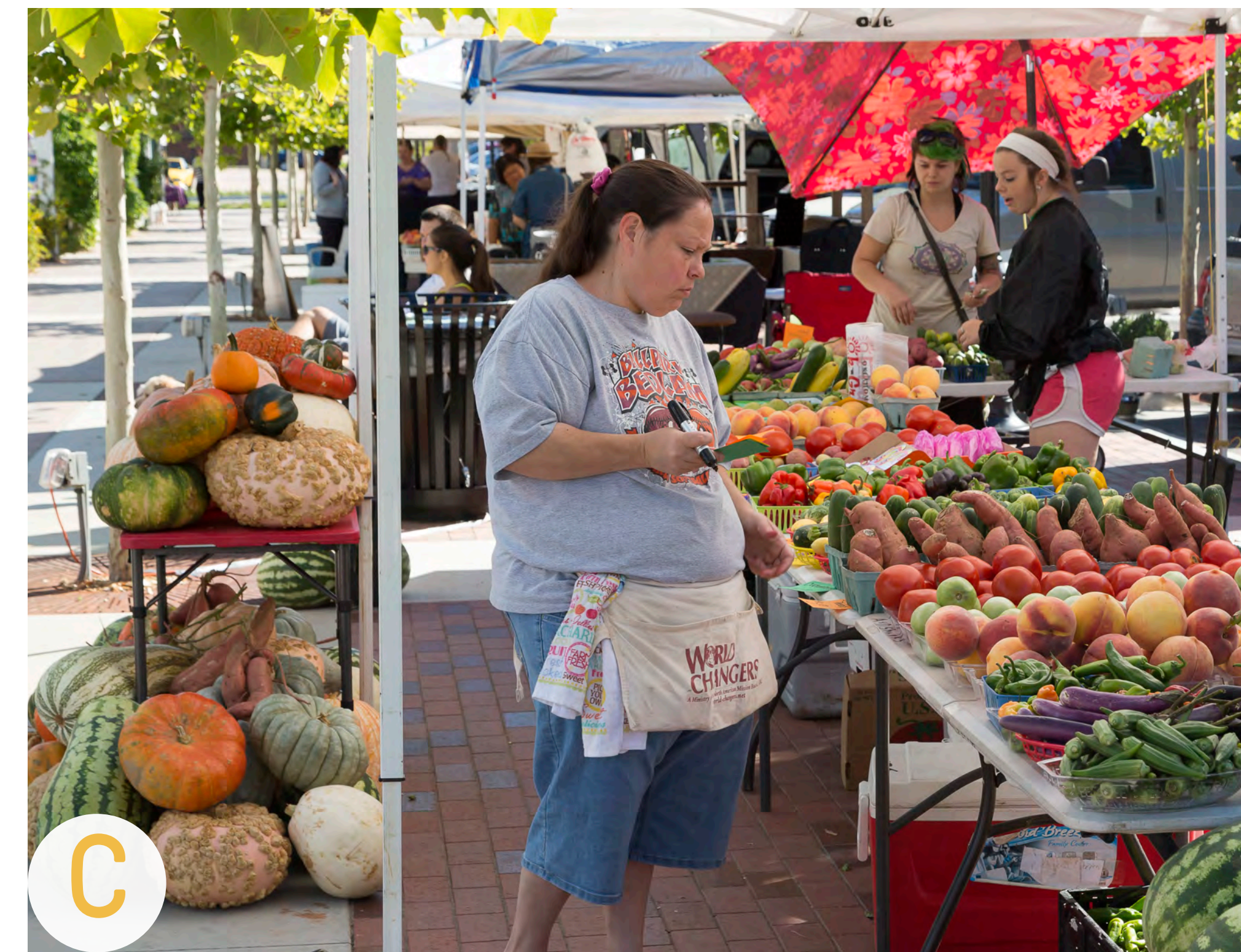
C Farmer's Market