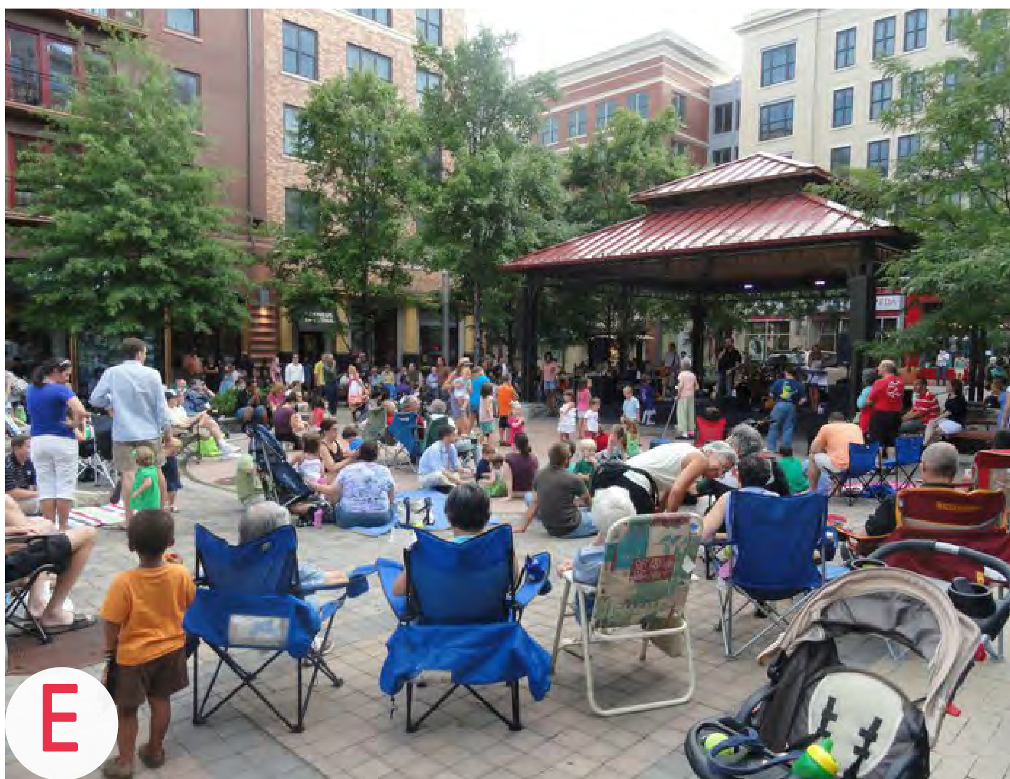
E Theater Performance