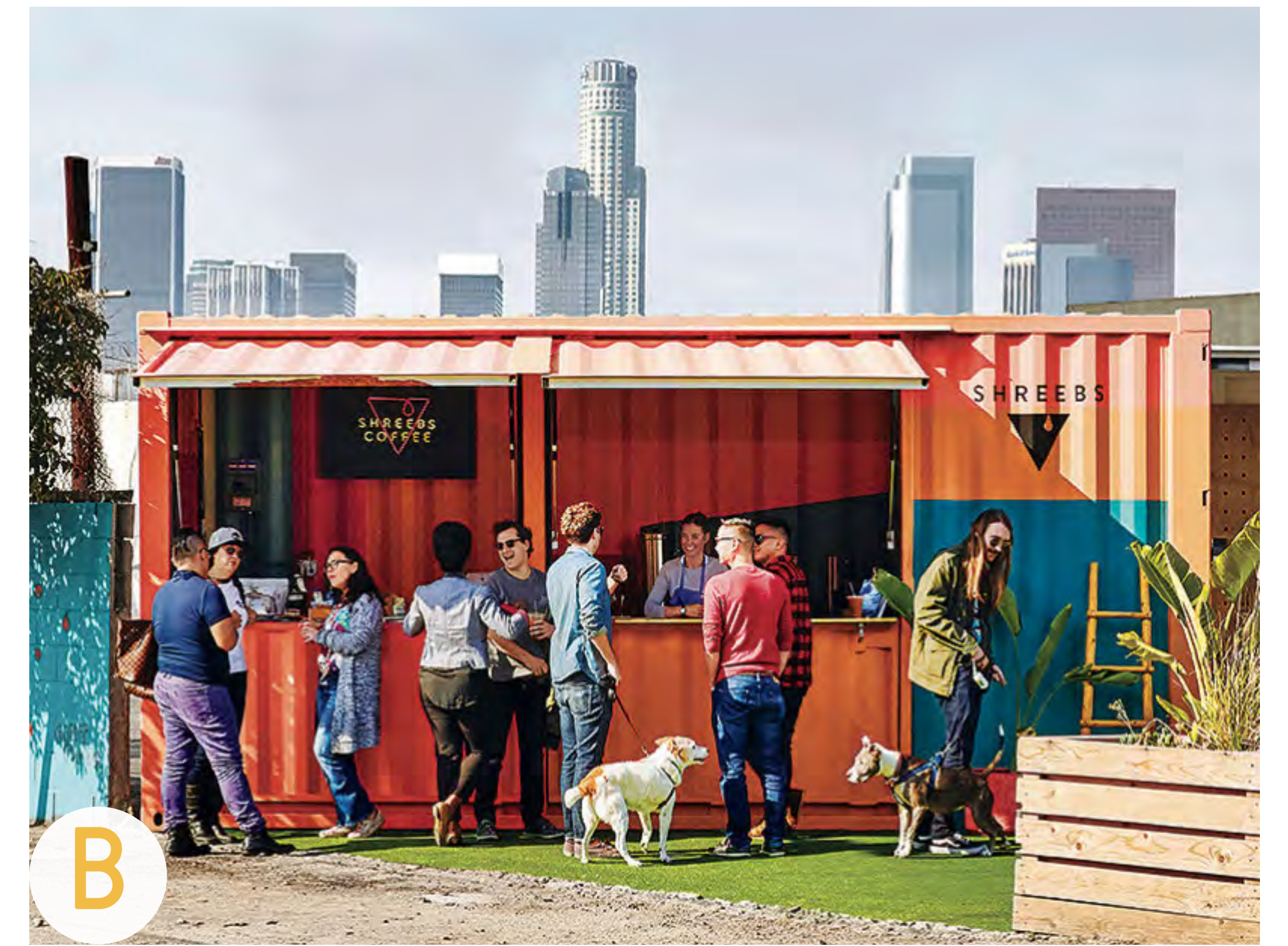
B Pop-Up Café