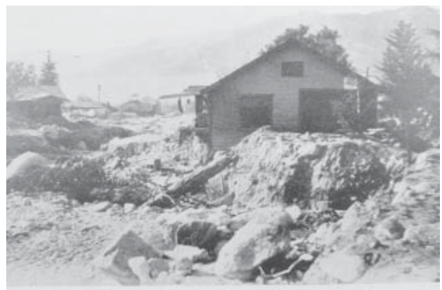
Where Death Walked-Altura Street, Looking South

The Verdugo Wash is the main stream in the City, separating Glendale into quadrants defined by the southeast to south-flowing stream, and cutting through the rising block of similar bedrock that we now refer