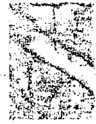
Map 4-24 Publicly and Privately Held Open Space

To be changed from privately owned property to developed park land per GPA 2005-01 and ZC 2005-01