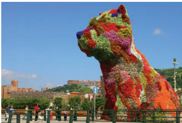
ABOVE: Public art as a community benefit