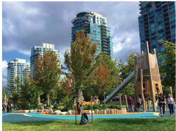
ABOVE: Providing a diverse housing mix as a community benefit