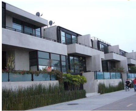
Window and door type, material, shape and proportion should complement architectural design