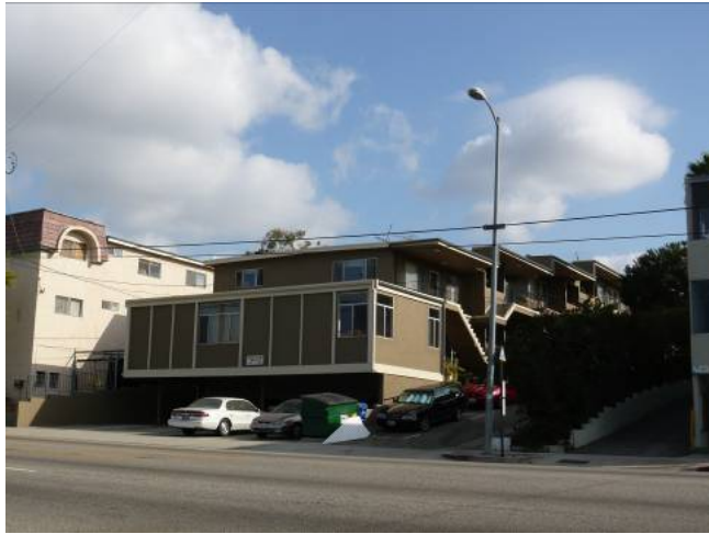
Building steps up as the site slopes up