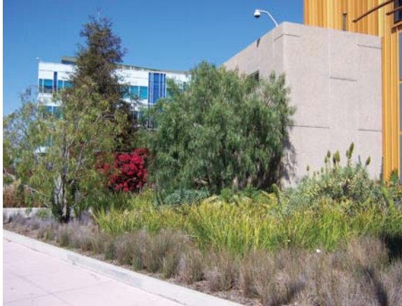
Landscape design provides ample area to contain stormwater runoff