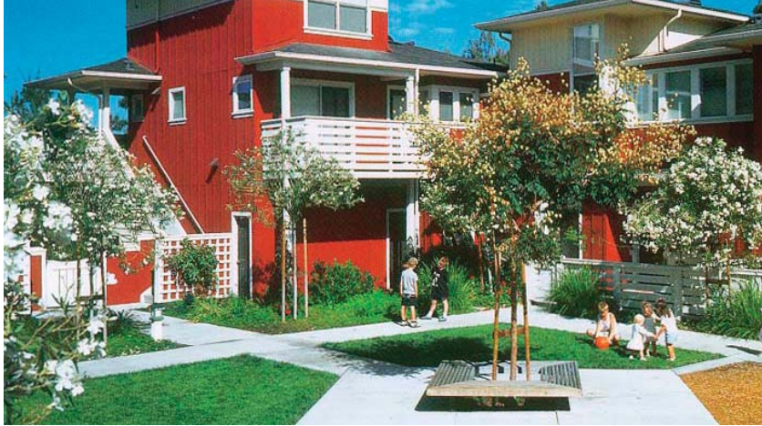
Building is broken up into different elements surrounding outdoor space, breaking down the size and appearance of the massing

Mass and Scale-New projects should fit well with surrounding building fabric. While new proposals need not copy existing development, mass and scale should respect adjacent building context.