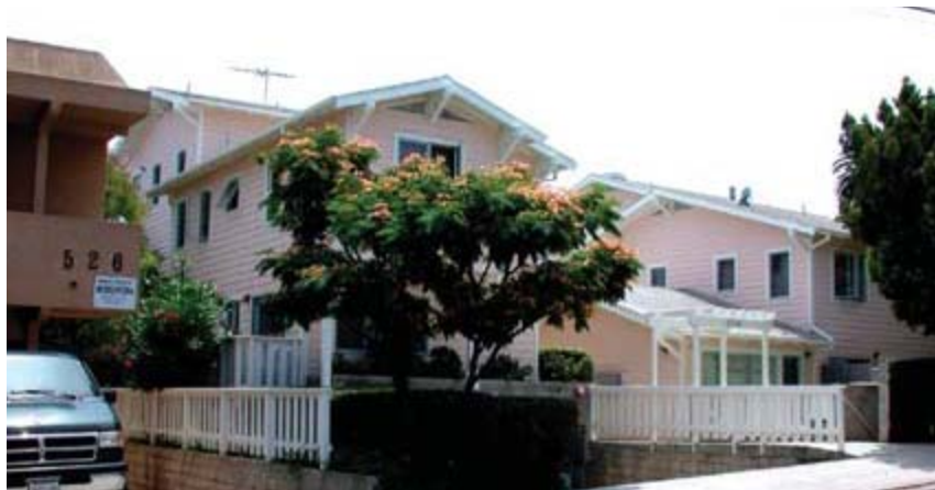
Landscaping and canopy tree with building set back from sidewalk enhances the street and the building

Site Planning - Site planning involves a careful analysis of the opportunities and constraints of the site, including existing site features such as mature trees, topography, and drainage patterns. The components of site development extend beyond building placement and configuration, including topography, surrounding uses, retaining walls, landscape design, hardscape considerations, and parking.