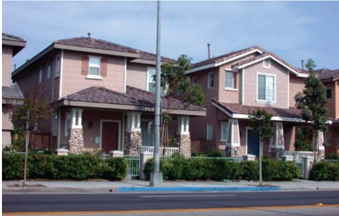
Units are designed as separate buildings facing the street rather than a single building frontage