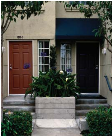
Well-defined entries give residents a sense of home