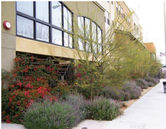
Landscaping highlighting ground floor entries