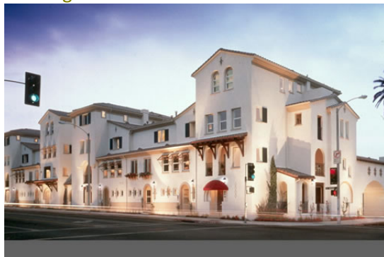
Details of windows and doors should reflect the overall design idea of the building.