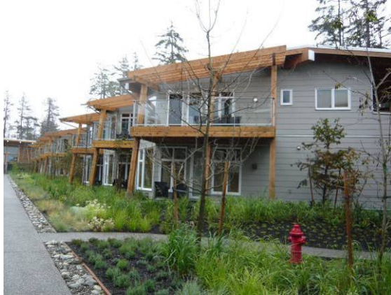
Landscaping for common open space complements the building while enhancing the outdoor area