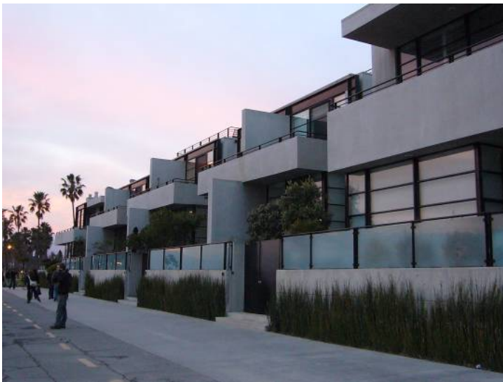
Contemporary design provides separate units defined by strong architectural elements