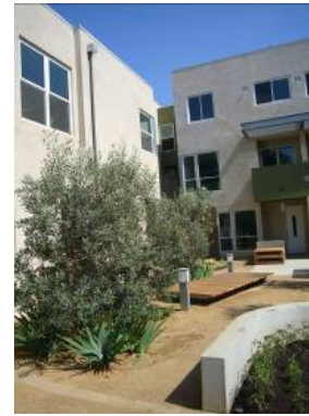
Building designed as separate elements surrounding outdoor space