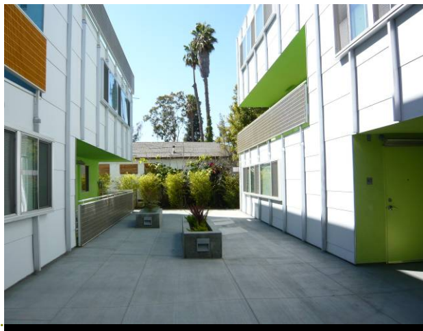
Building design is reinforced with color, material and detail