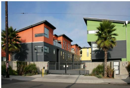
Building design is reinforced with color, material and detail