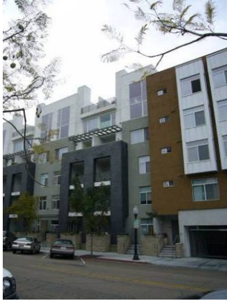
Building design is reinforced with color, material and detail