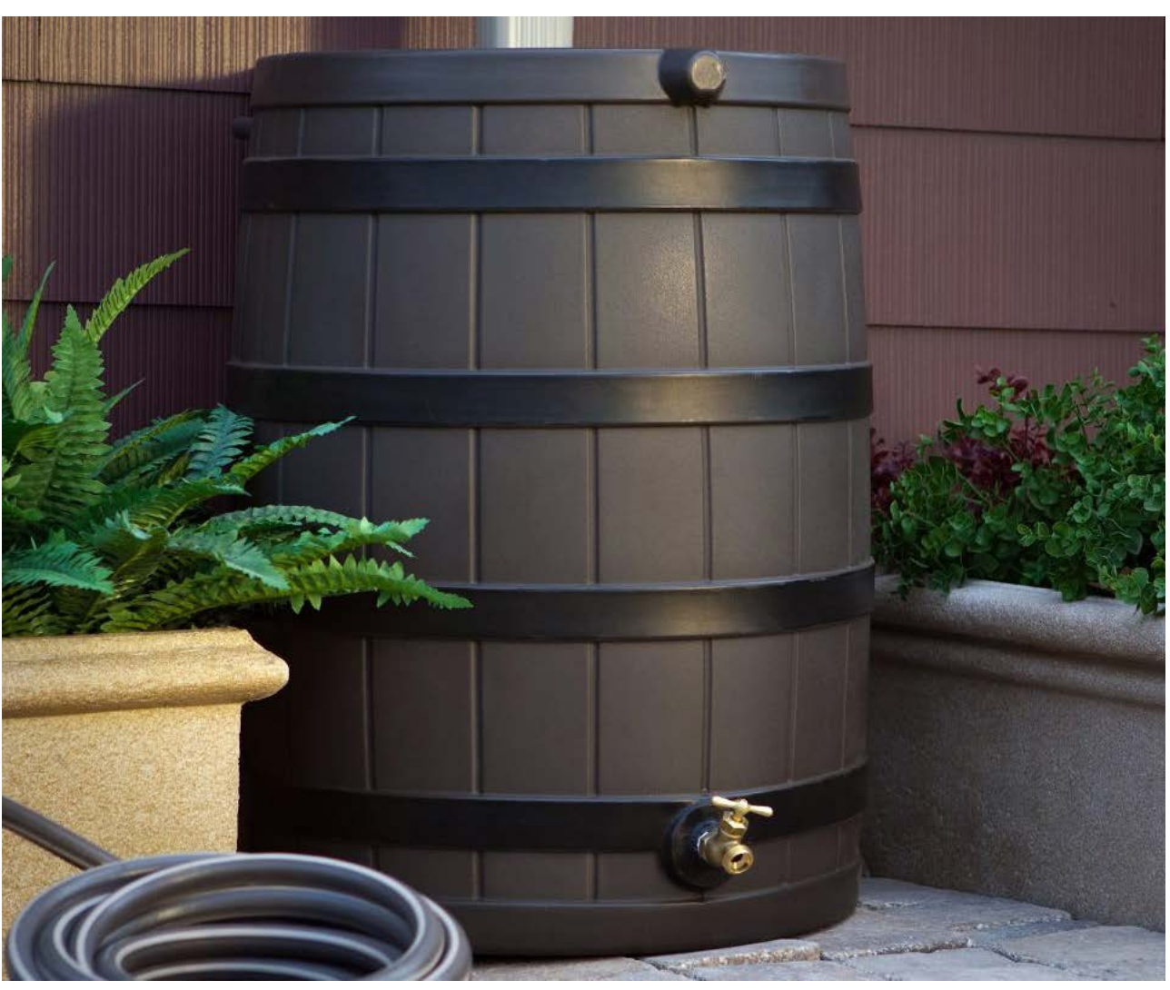
Rain Barrel Distribution Event