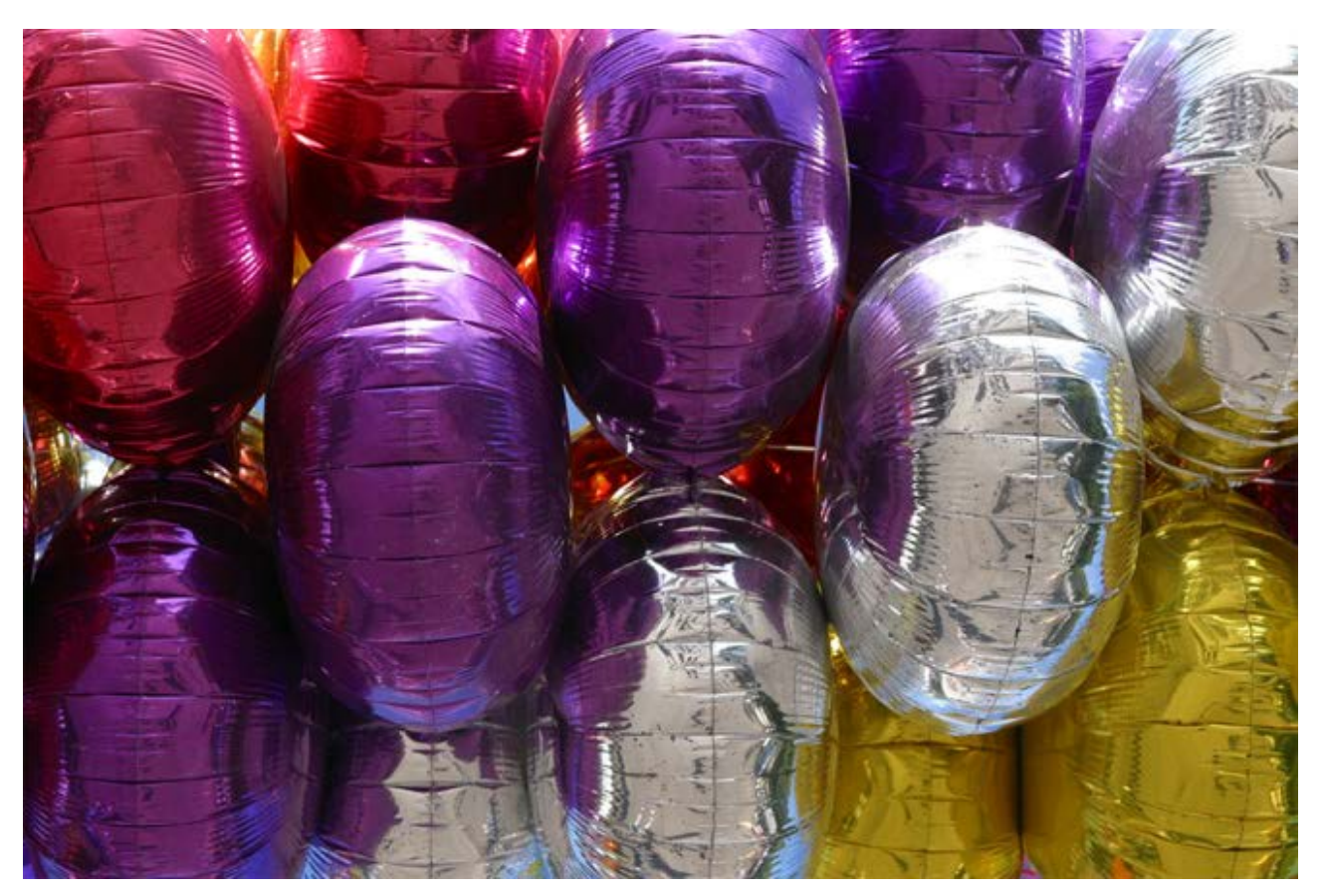
Mylar Balloon Ordinance

The Glendale City Council adopted a new ordinance which prohibits the sale of Mylar balloons in the city of Glendale. Starting on November 13, Mylar balloons can only be sold in Glendale if they are inflated with air and affixed to a decorative structure such as a post or balloon arch. This ordinance aims to help reduce the number of power outages caused from Mylar balloons in Glendale. Mylar balloons can cause power outages when they are let go and get caught in power lines.