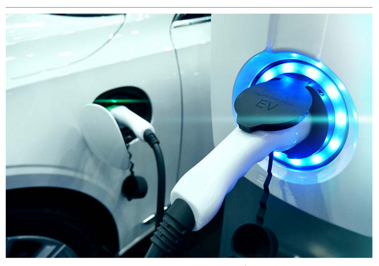
GWP Partners with CARB to offer $1,500 off Electric Vehicles