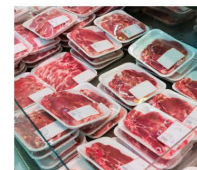
MEATS & SEAFOOD