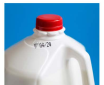
DAIRY & EGGS