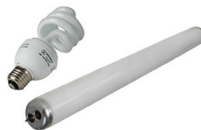
Fluorescent Bulbs & Tubes