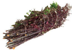
Tree Limbs (Less than 6 inches in diameter)