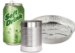
Aluminum, Metal, Scrap Metal, & Tin