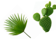
Cactus & Palm Fronds