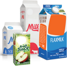
Beverage & Food Cartons