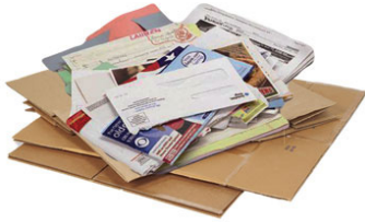
Cardboard (flattened) & Paper