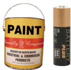
Paint & Batteries