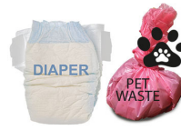
Animal Waste & Diapers