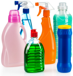
Automotive Fluids & Household Cleaners