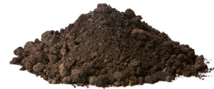
Dirt and Rock (Up to 5 gallons)