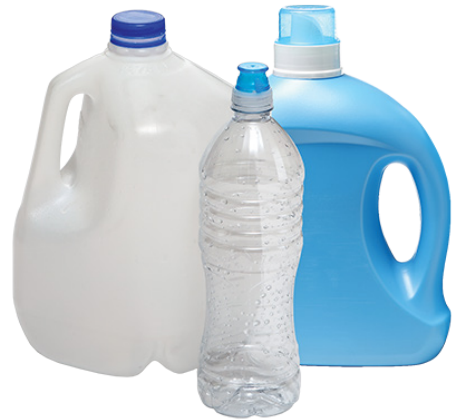
Containers, Jugs, and Plastic Bottles