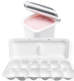
Egg Cartons (Plastic) and Yogurt Containers