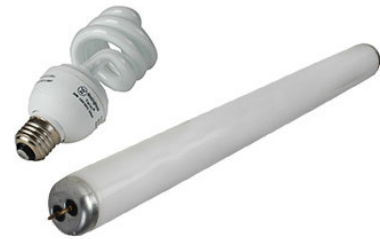
Fluorescent Bulbs & Tubes

For a complete list of hazardous waste materials that can be collected, visit: