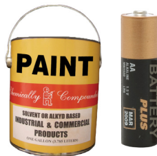
Paint & Batteries