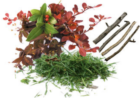
Garden Trimmings, Grass Clippings, Leaves, and Shrub Trimmings