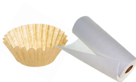
Food-Soiled Paper Products