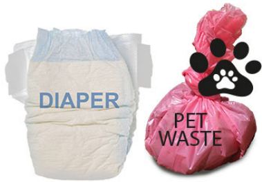
Animal Waste and Diapers