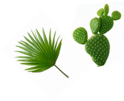
Cactus and Palm Fronds