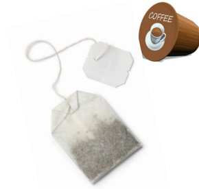
Tea Bags and Coffee Pods