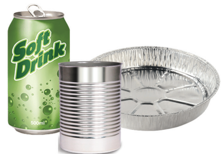
Aluminum, Metal, Scrap Metal, and Tin