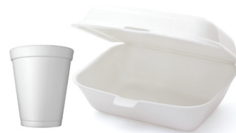
Food Storage Containers (Clear or polystyrene)