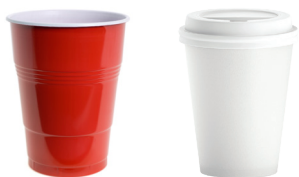
Single-Use Plates, Cups and Utensils (Plastic or compostable)