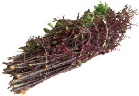
Tree Limbs (Less than 6 inches in diameter)