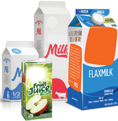
Beverage and Food Cartons