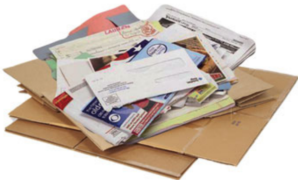
Flattened Cardboard and Clean Paper