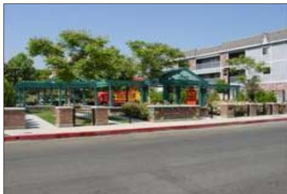
Accessible Route from the Public Right of Way

Finding: There is an accessible route from the public right of way to the accessible entrance of the facility.