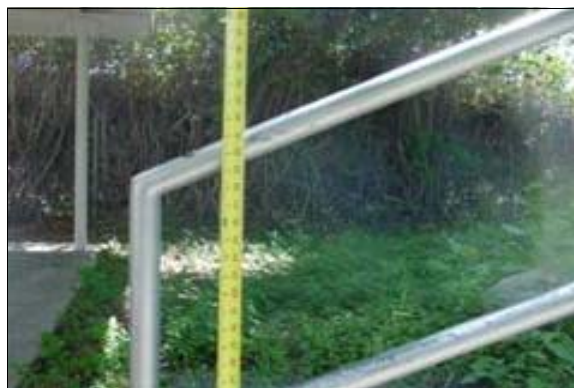
Exterior Stairs Next to the Women's Restroom

Finding: The handrails do not provide 12-inch extensions beyond the top and bottom treads. The handrails are mounted at a height greater than 38 inches.