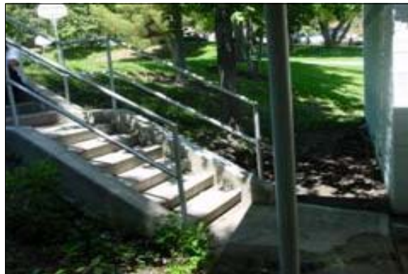
Exterior Stairs Next to the Women's Restroom

Finding: The width of the exterior stairway is less than 48 inches.