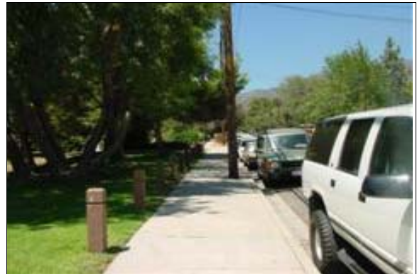
Accessible Route from the Public Right of Way

Finding: There is an accessible route from the public right of way to the accessible entrance of the facility.