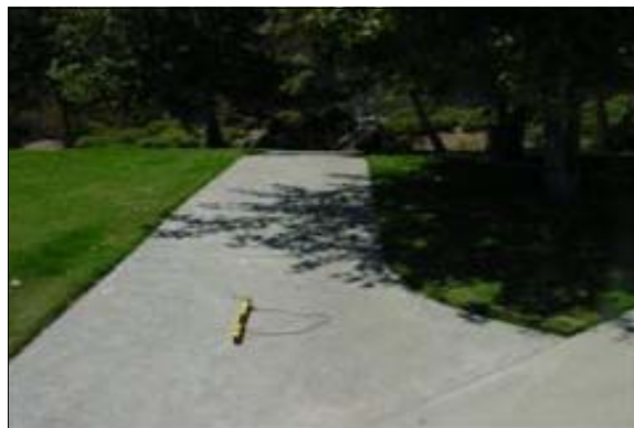
Path of Travel to the Tennis Courts

Finding: There are slopes greater than 5% on the primary path of travel from the public right of way to the tennis courts.