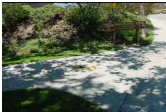
Accessible Route from the Public Right of Way

Finding: There are slopes greater than 5% on the primary path of travel to the park.