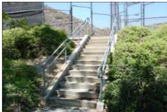
Exterior Stairs to the Tennis Courts

Finding: There is no detectable striping on each tread of the exterior stairway.