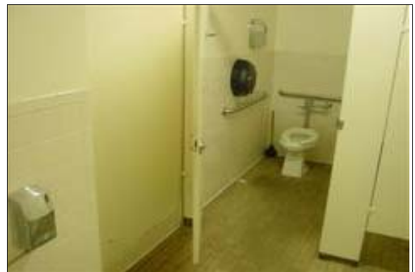
Men's Restroom at the Clubhouse