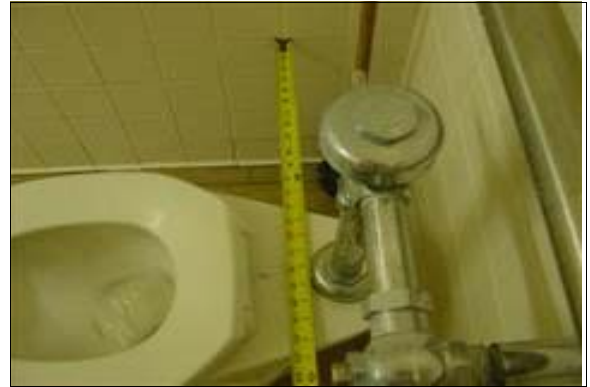
Men's Restroom at the Clubhouse

Full Rec: Relocate the toilet or stall side wall so that the distance from the centerline of the toilet to the nearest side wall in the stall designated to be accessible in the restroom is exactly 18 inches (see ADAAG Figure 28).