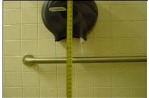
Men's Restroom at the Clubhouse