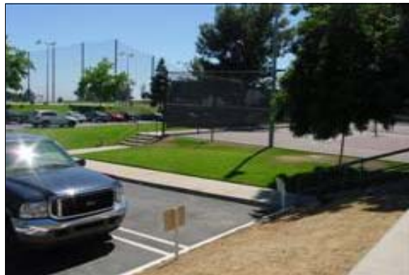
Tennis Courts 1 and 2

Finding: There are only stairs on the path of travel to the tennis courts, preventing access to individuals with mobility impairments.