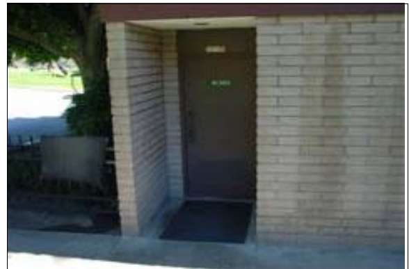
Women's Restroom at the Clubhouse

Full Rec: Securely fasten the mats or replace with a mat that grips to the underlying floor surface to provide a firm, stable, continuous and relatively smooth path of travel surface (see CBC 1124B.3 and ADAAG 4.5.3). Mats along the primary path of travel shall provide beveled edges on all sides to prevent roll over.