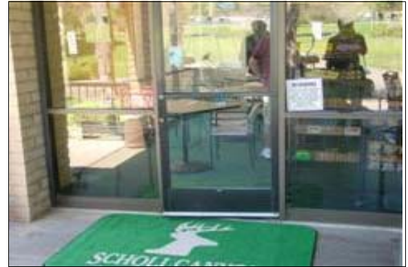
Path of Travel to the Scholl Canyon Café

Full Rec: Securely fasten the mats or replace with a mat that grips to the underlying floor surface to provide a firm, stable, continuous and relatively smooth path of travel surface (see CBC 1124B.3 and ADAAG 4.5.3). Mats along the primary path of travel shall provide beveled edges on all sides to prevent roll over.