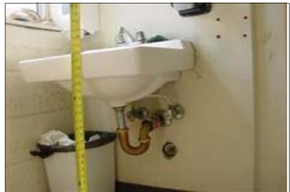
Unisex Restroom at the Maintenance Building

Full Rec: Insulate or otherwise configure pipes under the lavatory designated to be accessible in the restroom to protect against contact (see ADAAG 4.19.4). Make certain there are no sharp or abrasive surfaces under the lavatory.