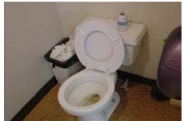
Unisex Restroom at the Maintenance Building

Full Rec: Relocate the flush control on the toilet in the restroom so that it is on the wide (approach) side of the toilet area (see ADAAG 4.16.5). Flush controls shall be hand-operated or automatic mechanisms.