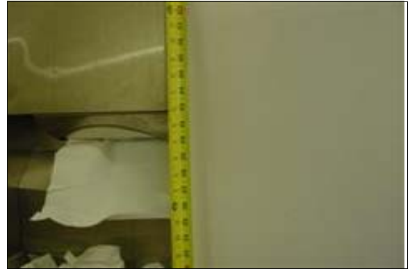
Men's Restroom at the Clubhouse

Full Rec: Relocate the paper towel dispenser in the restroom to a maximum height of 40 inches for all the controls and operating mechanisms (see CBC 1115B.9.2).