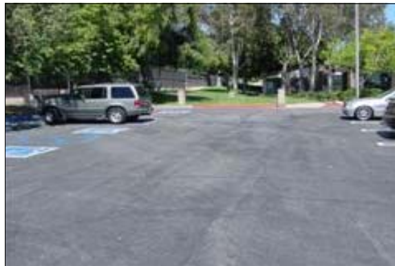
Curb Ramp Next to the Accessible Parking Spaces

Citations: CBC 1127B.5.3; ADAAG 4.7.2 & 4.29