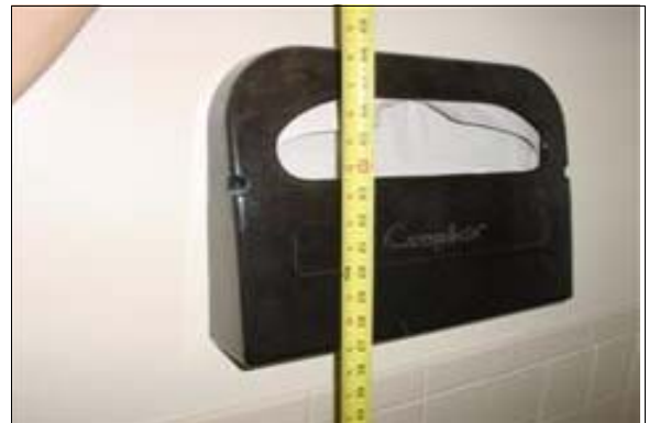
Women's Restroom at the Clubhouse

Full Rec: Relocate the seat cover dispenser in the stall designated to be accessible in the restroom so that the height is no greater than 40 inches above the finished floor (see CBC 1115B.9.2). Make certain that the location of the seat cover dispenser does not interfere with the use of a grab bar and provides sufficient clear floor space.