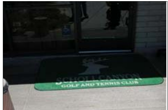
Path of Travel to the Club House