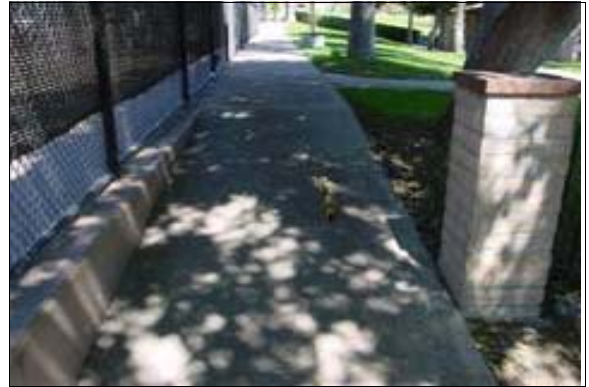
Path of Travel to the Tennis Courts 1 thru 4

Finding: There are slopes greater than 5% on the primary path of travel to tennis courts 1 thru 4.