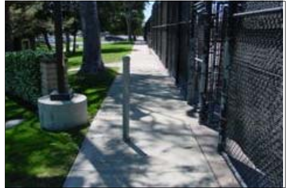
Path of Travel to Tennis Courts 8, 9, and 10

Full Rec: Securely fasten the mats or replace with a mat that grips to the underlying floor surface to provide a firm, stable, continuous and relatively smooth path of travel surface (see CBC 1124B.3 and ADAAG 4.5.3). Mats along the primary path of travel shall provide beveled edges on all sides to prevent roll over.