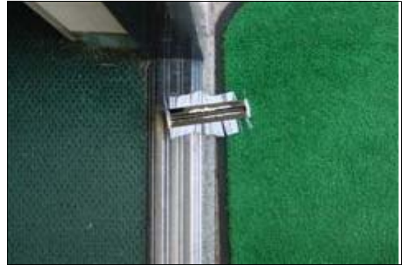
Scholl Canyon Club House

Full Rec: Bevel a slope 1 inch in 2 inches to the door threshold of the entrance door (see ADAAG 4.13.8).