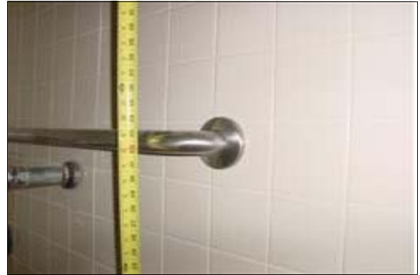
Women's Restroom at the Clubhouse

Finding: The height of the back grab bar in the stall designated to be accessible of the restroom is less than 33 inches above the finished floor.