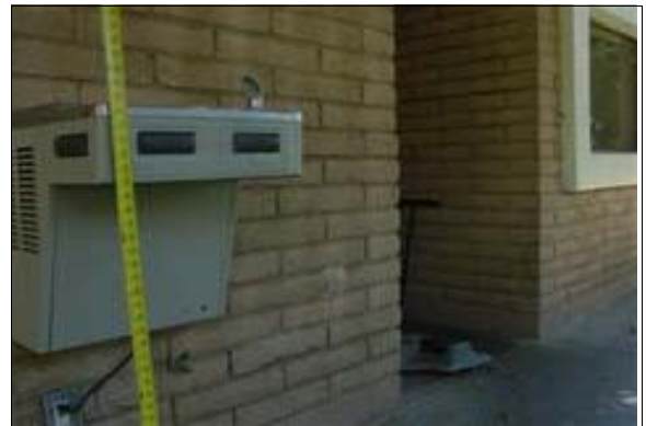
Drinking Fountain Outside of the Restrooms