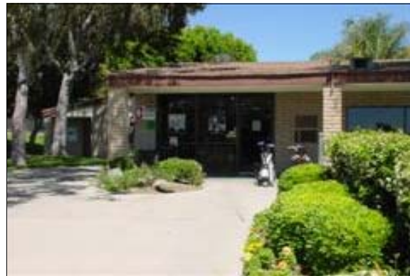
Scholl Canyon Club House