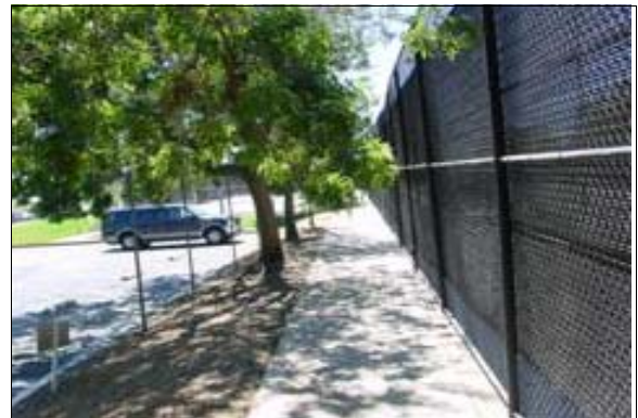
Path of Travel to the Tennis Courts

Full Rec: Maintain grass or landscaping adjacent to primary path of travel walkways to eliminate any encroachment into the accessible route.