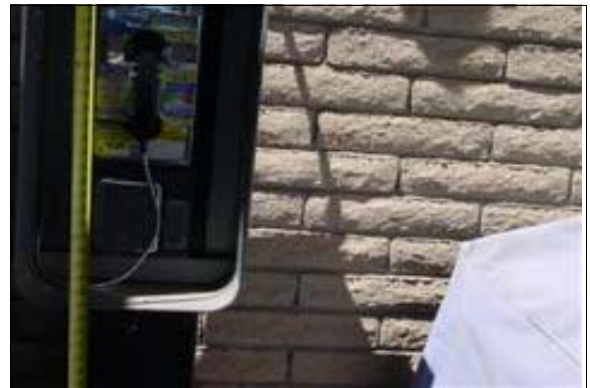
Pay Telephone Outside of the Café

Full Rec: Electrical outlets within or adjacent to the telephone enclosure are required at pay telephones designed to accommodate a portable text telephone.