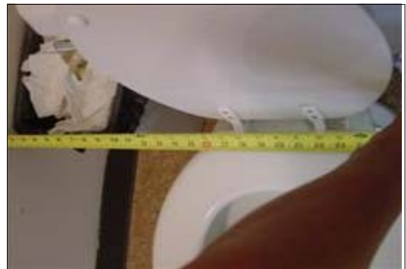
Unisex Restroom at the Maintenance Building

Full Rec: Relocate the toilet so that the distance from the centerline of the toilet to the nearest side wall in the restroom is exactly 18 inches (see ADAAG Figure 28).