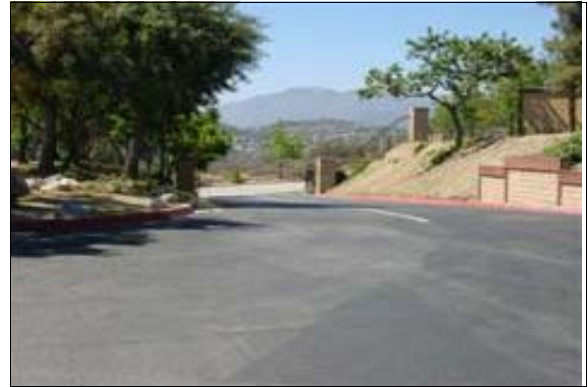
Accessible Route from the Public Right of Way

Full Rec: Stripe a crosswalk not less than 48 inches wide on the path of travel to the accessible entrance of the facility. Provide a level surface that does not exceed a slope greater than 5%. Cross slopes shall not exceed 2%. Detectable warnings should be placed at the entrance and exit of the crosswalk.