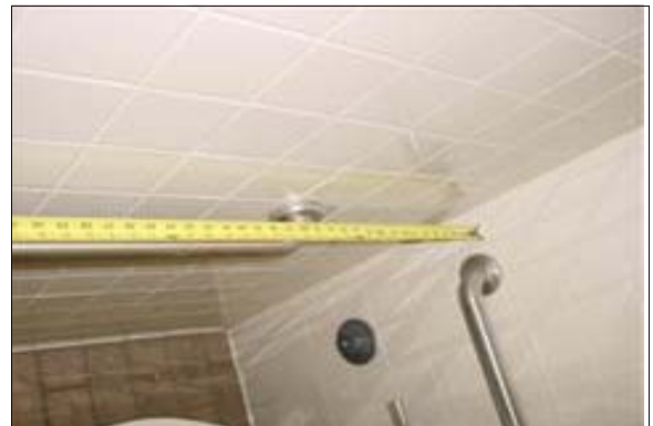
Women's Restroom at the Clubhouse

Finding: The distance from the end of the side grab bar to the back wall in the stall designated to be accessible in the restroom is greater than 12 inches.