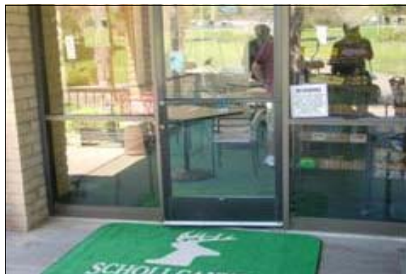
Scholl Canyon Café