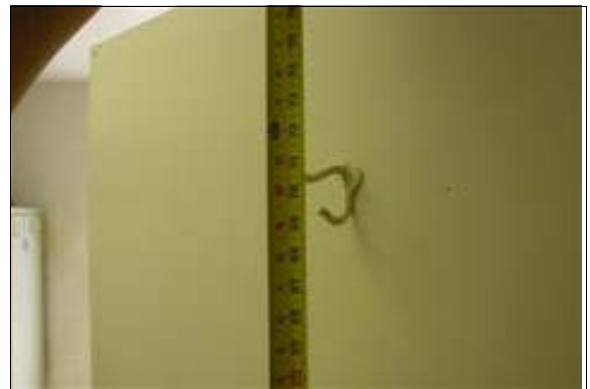
Unisex Restroom at the Maintenance Building

Full Rec: Remount the coat hook in the restroom to a maximum height of 48 inches above the floor surface.