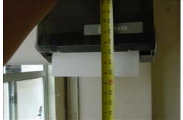
Unisex Restroom at the Maintenance Building

Full Rec: Relocate the paper towel dispenser in the restroom to a maximum height of 40 inches for all the controls and operating mechanisms (see CBC 1115B.9.2).