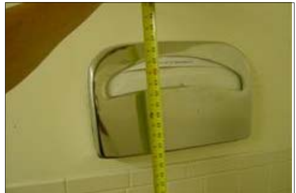
Men's Restroom at the Clubhouse

Full Rec: Relocate the seat cover dispenser in the stall designated to be accessible in the restroom so that the height is no greater than 40 inches above the finished floor (see CBC 1115B.9.2). Make certain that the location of the seat cover dispenser does not interfere with the use of a grab bar and provides sufficient clear floor space.