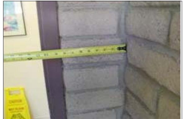
Men's Restroom at the Clubhouse

Full Rec: Consult a design professional to determine if it is technically feasible to provide at least 24 inches of latch side clearance at the entrance door (see ADAAG 4.13.6 and Figure 25). Otherwise, install an automatic door opening device to the primary entrance complying with ADAAG 4.13.12 and ANSI/BHMA A156.10, 1985, standards.