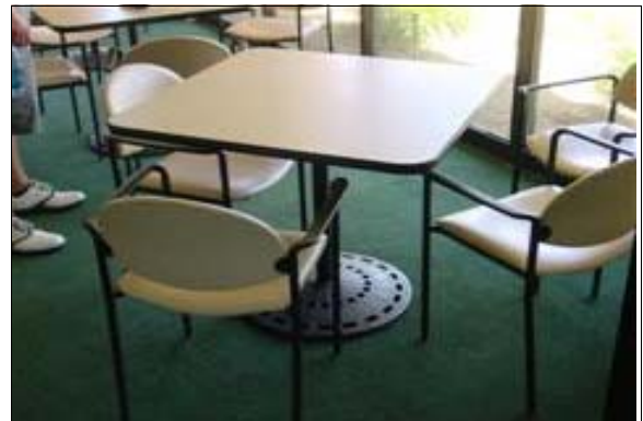
Scholl Canyon Café

Citations: CBC 1122B.3; ADAAG 4.32.2; ADAAG 4.32.5(2)