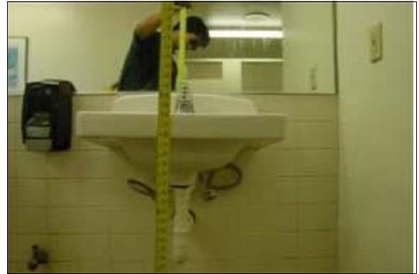
Men's Restroom at the Clubhouse

Full Rec: Relocate or replace the lavatory designated to be accessible in the restroom to provide a maximum rim surface height of no greater than 34 inches above the finished floor (see ADAAG 4.19.2).