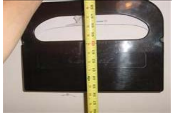
Unisex Restroom at the Maintenance Building

Full Rec: Relocate the seat cover dispenser in the restroom so that the height is no greater than 40 inches above the finished floor (see CBC 1115B.9.2). Make certain that the location of the seat cover dispenser does not interfere with the use of a grab bar and provides sufficient clear floor space.