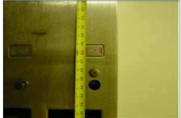
Women's Restroom at the Clubhouse

Full Rec: Relocate the feminine products dispenser in the restroom to a maximum height of 40 inches for all the controls and operating mechanisms (see CBC 1115B.9.2).