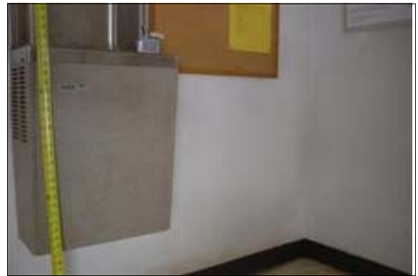
Drinking Fountain at the Maintenance Building