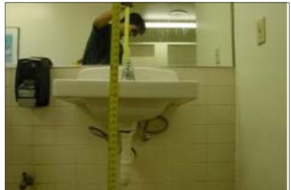
Men's Restroom at the Clubhouse

Full Rec: Insulate or otherwise configure pipes under the lavatory designated to be accessible in the restroom to protect against contact (see ADAAG 4.19.4). Make certain there are no sharp or abrasive surfaces under the lavatory.