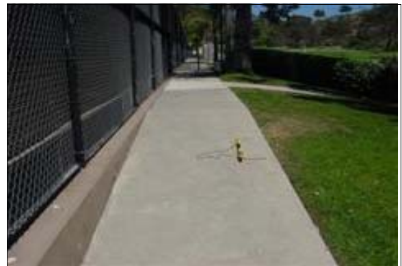
Path of Travel to Tennis Courts 7 thru 10

Full Rec: Resurface the path of travel to provide a level surface that does not exceed a slope greater than 5%. Cross slopes shall not exceed 2%.