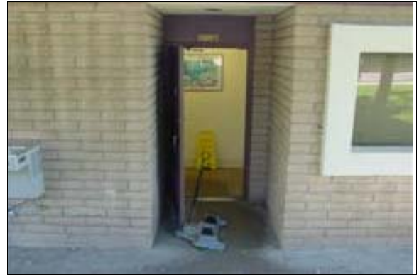
Men's Restroom at the Clubhouse

Full Rec: The restroom is designated accessible and should be made accessible for the facility. Post signage centered 60 inches above the ground surface on the latch side of the entrance door identifying the restroom as accessible upon completion of the following items (see CBC 1115B., ADAAG 4.1.2(7) and ADAAG 4.1.6(3)(e). Signage shall include Braille and raised lettering, the gender or unisex use symbol and the ISA symbol. Post Title 24 gender use signage on the door @ 60" o.c. a.f.f.