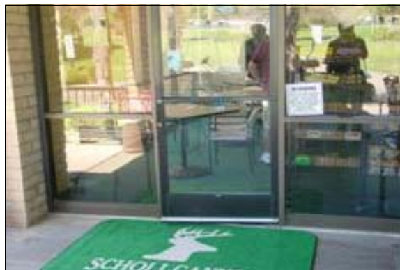
Scholl Canyon Café