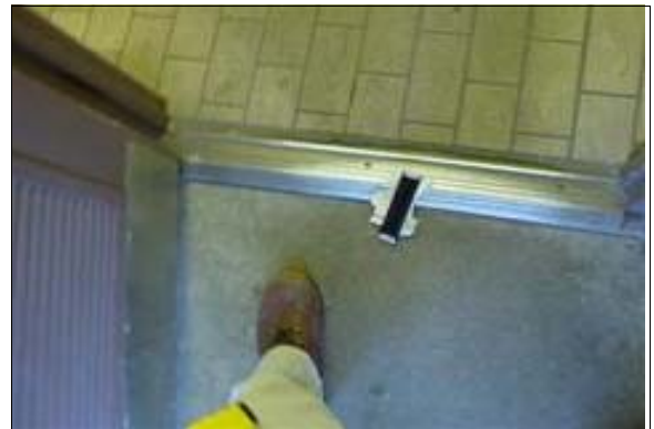
Men's Restroom at the Clubhouse

Full Rec: Modify or replace the threshold to provide a smooth transition. The threshold should not exceed a beveled 1/2 inch. Provide a 60 inch level landing in the direction of the door swing.