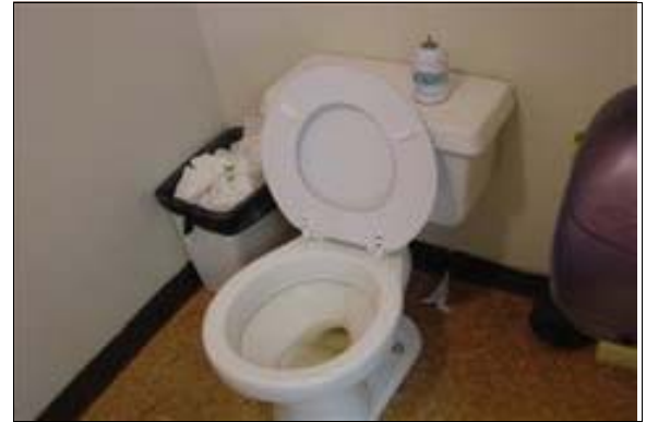
Unisex Restroom at the Maintenance Building

Full Rec: Install one 36-inch back grab bar and one 42/48-inch side grab bar in the restroom. Grab bars shall be mounted at a height of 33 inches above the finished floor. Grab bars must be able to support a point load of at least 250 pounds and shall be less than the allowable shear stress of the grab bar material.