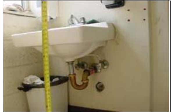
Unisex Restroom at the Maintenance Building

Full Rec: Raise or replace the lavatory designated to be accessible in the restroom to provide at least 27 inches at 8 inches under the apron. Make sure to provide at least 29 inches of clear knee space between the finished floor and bottom of the lavatory apron and a rim surface height no greater than 34 inches (see ADAAG 4.19.2).