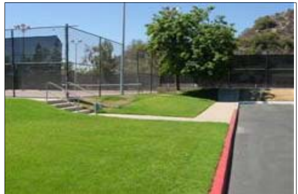
Exterior Stairs to the Tennis Courts

Finding: There is no detectable striping on each tread of the exterior stairway.