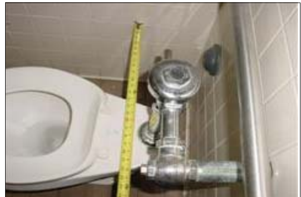
Women's Restroom at the Clubhouse

Full Rec: Relocate the flush control on the toilet in the stall designated to be accessible in the restroom so that it is on the wide (approach) side of the toilet area (see ADAAG 4.16.5). Flush controls shall be hand-operated or automatic mechanisms.