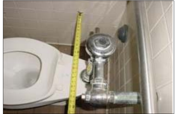
Women's Restroom at the Clubhouse

Full Rec: Relocate the toilet or stall side wall so that the distance from the centerline of the toilet to the nearest side wall in the stall designated to be accessible in the restroom is exactly 18 inches (see ADAAG Figure 28).