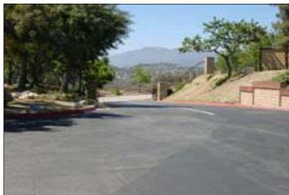
Accessible Route from the Public Right of Way

Finding: There is no accessible route from the public right of way to the accessible entrance of the facility. The accessible route crosses vehicular traffic.