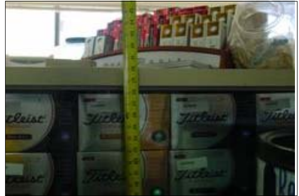
Scholl Canyon Club House

Full Rec: Lower at least a 36 inch wide portion of the sales counter to a maximum height between 28 and 34 inches (see CBC 1122B.4).