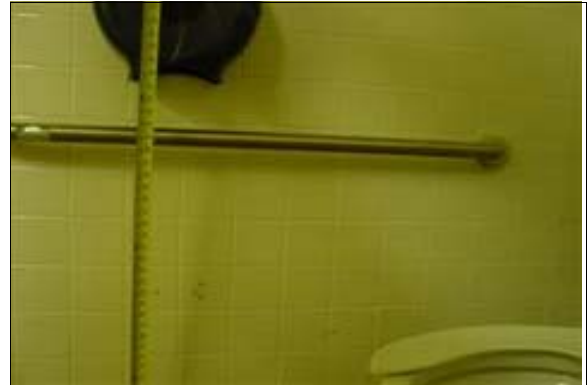
Women's Restroom at the Clubhouse

Full Rec: Remount the toilet paper dispenser in the stall designated to be accessible in the restroom so that it does not interfere with the use of the side grab bar (see ADAAG 4.16.6 and Figure 29(b)). Toilet paper dispensers must allow continuous paper flow.