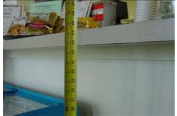
Scholl Canyon Café

Citations: CBC 1122B.4; ADAAG 4.32.4; ADAAG 4.32.5(3)