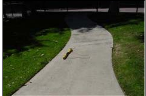
Path of Travel to the Tennis Courts

Full Rec: Resurface the path of travel to provide a level surface that does not exceed a slope greater than 5%. Cross slopes shall not exceed 2%.