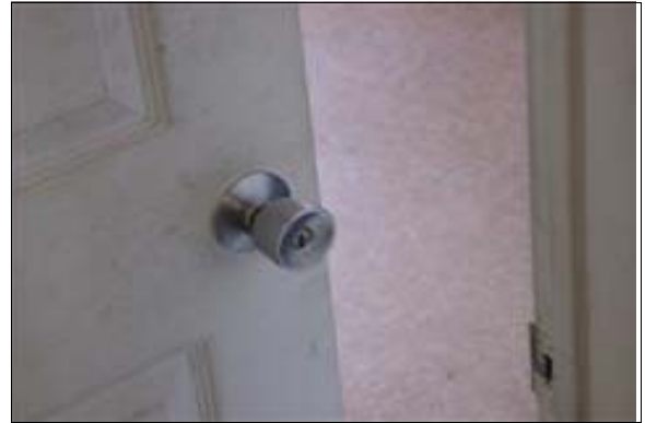
Unisex Restroom at the Maintenance Building

Full Rec: Replace the door hardware mounted on the restroom complying with ADAAG 4.13.9. Make certain accessible door hardware is mounted no higher than 48 inches above the finished floor.