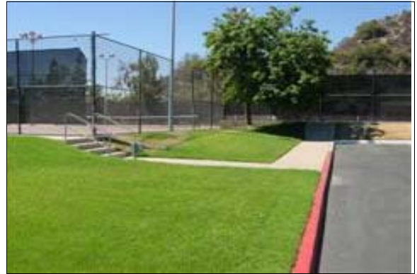
Exterior Stairs to the Tennis Courts

Finding: The handrails do not provide 12-inch extensions beyond the top and bottom treads.