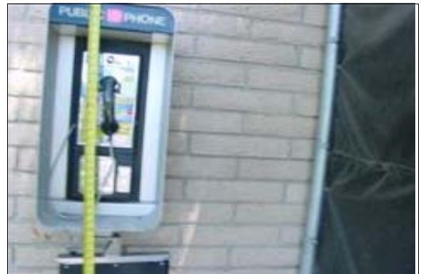
Pay Telephone Outside of the Restrooms

Full Rec: Contact the telephone company that owns the pay telephone regarding the height of all the operating devices on the telephone.