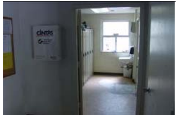
Unisex Restroom at the Maintenance Building

Full Rec: The restroom is designated accessible and should be made accessible for the facility. Post signage centered 60 inches above the ground surface on the latch side of the entrance door identifying the restroom as accessible upon completion of the following items (see CBC 1115B., ADAAG 4.1.2(7) and ADAAG 4.1.6(3)(e). Signage shall include Braille and raised lettering, the gender or unisex use symbol and the ISA symbol. Post Title 24 gender use signage on the door @ 60" o.c. a.f.f.