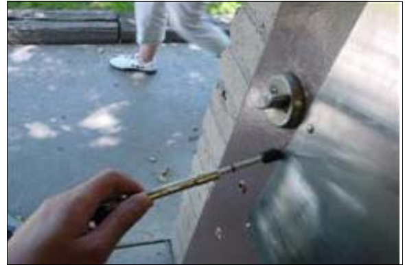
Men's Restroom at the Clubhouse

Full Rec: Adjust the closers on all exterior doors to a maximum door opening force of 5 pounds of force (see ADAAG 4.13.11 and CBC 1133B.2.5).