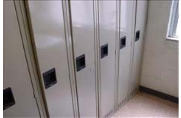
Unisex Restroom at the Maintenance Building

Full Rec: At least one locker or no less than one percent of the lockers in the restroom shall be made accessible for individuals with disabilities. Make certain that the accessible lockers are located on an accessible path of travel that is at least 36 inches in width (see CBC 1115B.6.4 and ADAAG 4.27).