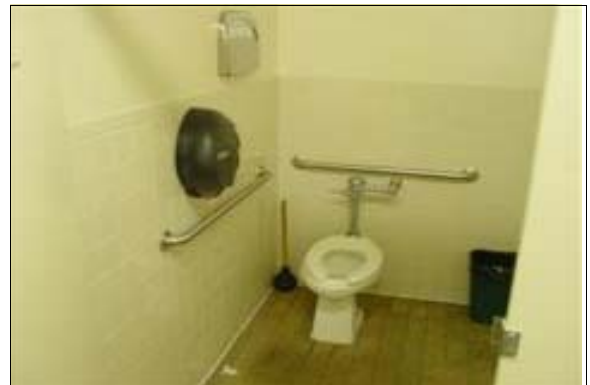
Men's Restroom at the Clubhouse