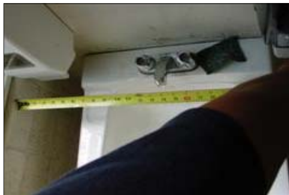
Unisex Restroom at the Maintenance Building

Finding: The distance from the center of the lavatory to the adjacent side wall in the restroom is less than 18 inches.