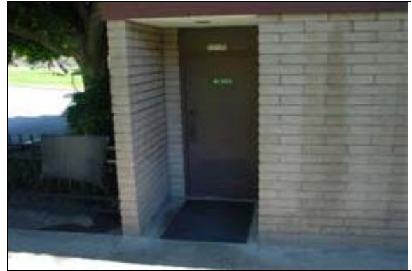
Women's Restroom at the Clubhouse

Full Rec: The restroom is designated accessible and should be made accessible for the facility. Post signage centered 60 inches above the ground surface on the latch side of the entrance door identifying the restroom as accessible upon completion of the following items (see CBC 1115B., ADAAG 4.1.2(7) and ADAAG 4.1.6(3)(e)). Signage shall include Braille and raised lettering, the gender or unisex use symbol and the ISA symbol. Post Title 24 gender use signage on the door @ 60" o.c. a.f.f.