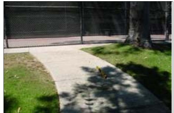
Path of Travel to the Tennis Courts

Full Rec: Resurface the path of travel to provide a level surface that does not exceed a slope greater than 5%. Cross slopes shall not exceed 2%.