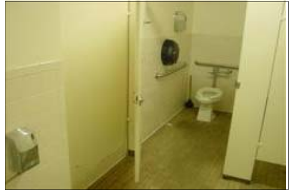
Men's Restroom at the Clubhouse

Full Rec: Remount the coat hook on the stall door designated to be accessible in the restroom to a maximum height of 48 inches above the floor surface.