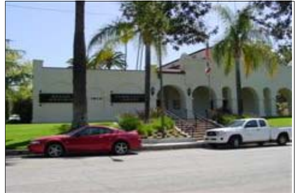
Accessible Route from the Public Right of Way

Full Rec: Provide at least one accessible route from the public right of way to the accessible entrance of the facility. Make certain to post signage indicating the direction to accessible building entrances at every major junction along the accessible route. Signs shall include the International Symbol of Accessibility.