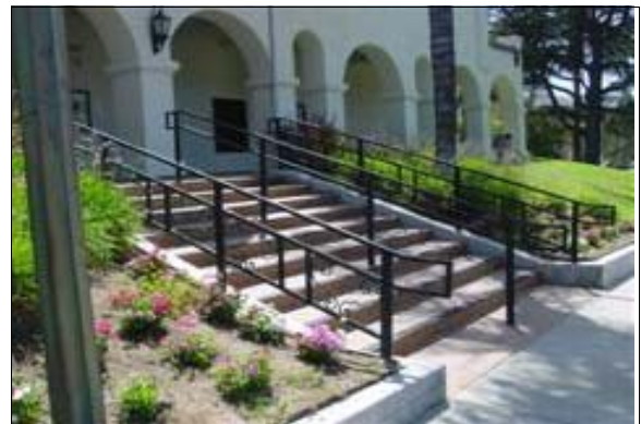
Path of Travel to the Main Entrance

Finding: There are only stairs on the path of travel to the primary entrance, preventing access to individuals with mobility impairments. There is no signage posted directing individuals with disabilities to the accessible entrance.