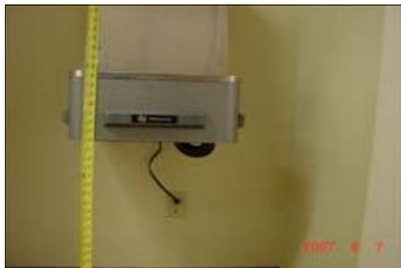
Drinking Fountain Next to the Restrooms

Finding: The drinking fountain is not a "high-low" design. The spout outlet height is greater than 36 inches.