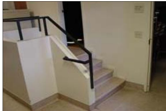
Interior Stairs to the Stage in the Verdugo Room

Full Rec: Install handrails on each side of stairway that provide a gripping surface between 1 1/4 to 1 7/8 inches with 12-inch top and bottom handrail extensions that extend beyond the top and bottom treads of the stairway which are parallel to the ground surface and return smoothly to the post or wall. Handrails shall be mounted at a height between 34 and 38 inches at a distance no less than 1 1/2 inches from the adjacent wall.