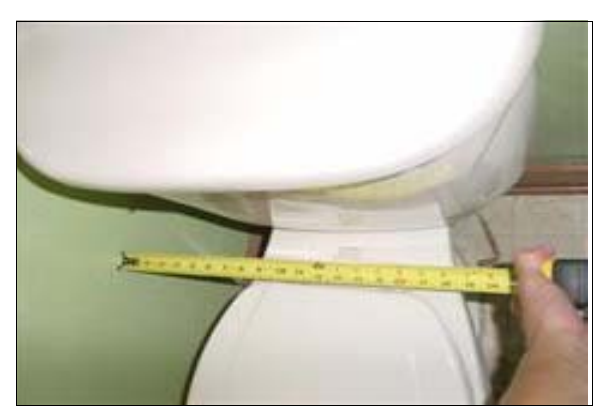
Unisex Restroom in the Museum

centerline of the toilet to the nearest side wall in the restroom is exactly 18 inches (see ADAAG Figure 28.