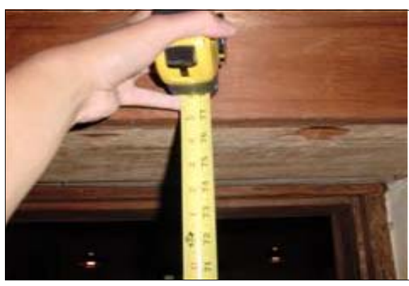
Interior Door to the Dining Area in the Museum

Citations: CBC 1133B.2.3.1; ADAAG 4.4.2; ADAAG 4.13