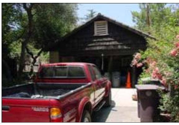
Path of Travel to the Maintenance Garage