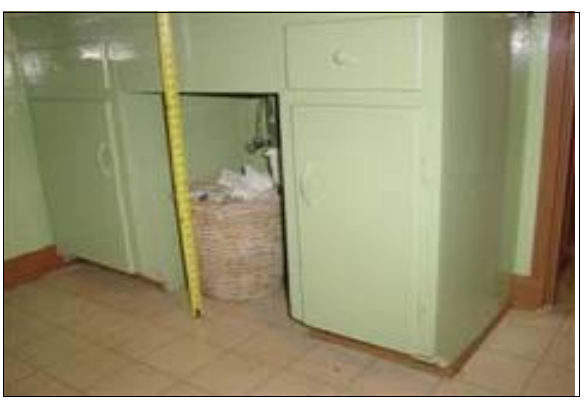
Unisex Restroom in the Museum