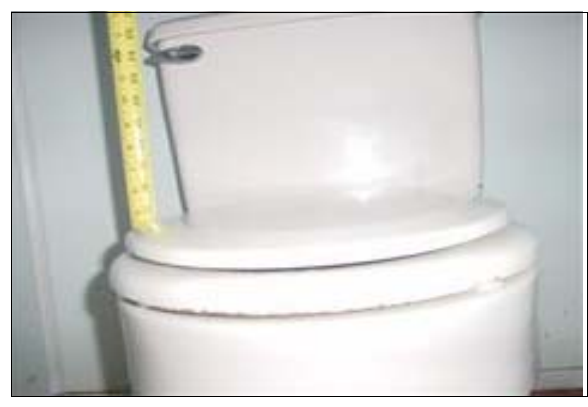
Unisex Restroom at the Rear of the Museum