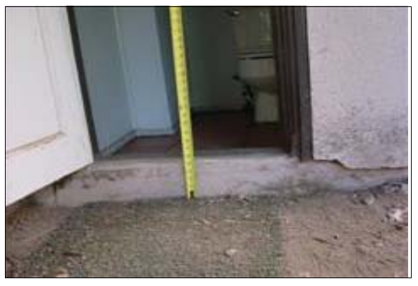
Path of Travel to the Restroom at the Rear of the Museum

Full Rec: Since programs, services and activities to staff and the public are provided in this location, those programs, services and activities are required to be made accessible. It is recommended that a ramp be installed or other means of vertical access.