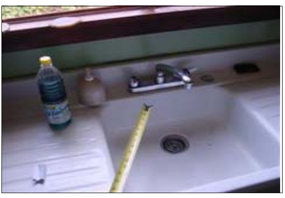
Sink in the Museum

Lever-operated, push-type, touch-type or electronically controlled mechanisms are acceptable elements (see ADAAG 4.19.5). If self-closing valves are used the faucet shall remain open for at least 10 seconds.