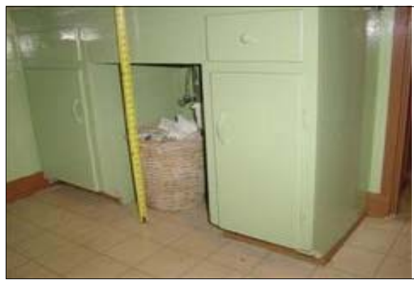
Unisex Restroom in the Museum

restroom to provide at least 29 inches of clear knee space between the finished floor and bottom of the lavatory apron. Make sure to provide at least 27 inches at 8 inches under the apron (see ADAAG 4.19.2).