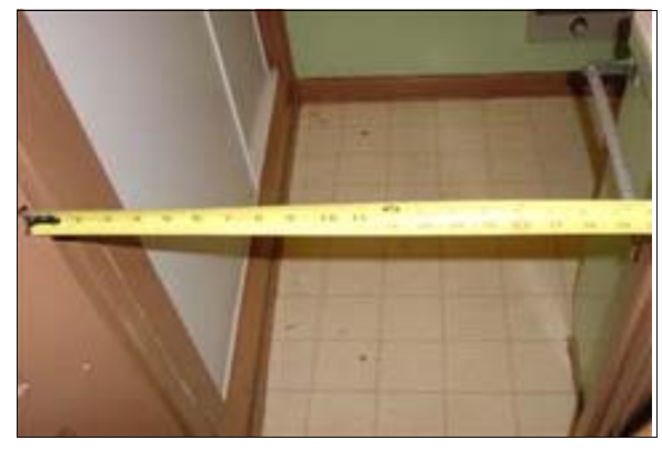
Unisex Restroom in the Museum

door is open 90 degrees (see ADAAG 4.13.5).