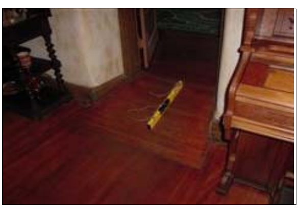
Interior Door to the Dining Area in the Museum

length in the direction of the door swing.