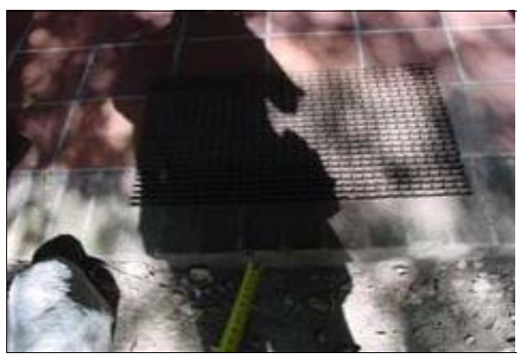
Path of Travel to the Museum

edges on all sides to prevent roll over.