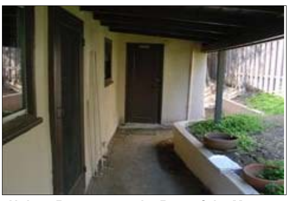
Unisex Restroom at the Rear of the Museum

Citations: CBC 1115B.5; ADAAG 4.1.6; ADAAG 4.1.2(7)); ADAAG 4.1.6(3)(e); ADAAG 4.30