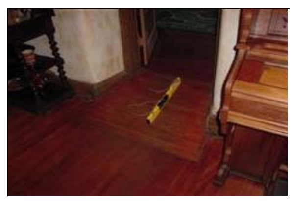
Interior Door to the Dining Area in the Museum

degrees (see CBC 1133B.2.3.1 and ADAAG 4.13.5).