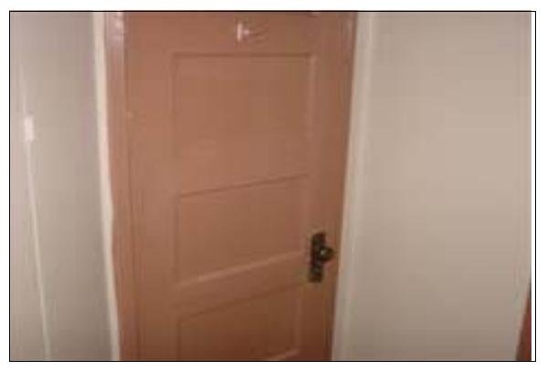
Unisex Restroom in the Museum

Title 24 gender use signage on the door @ 60" o.c. a.f.f.