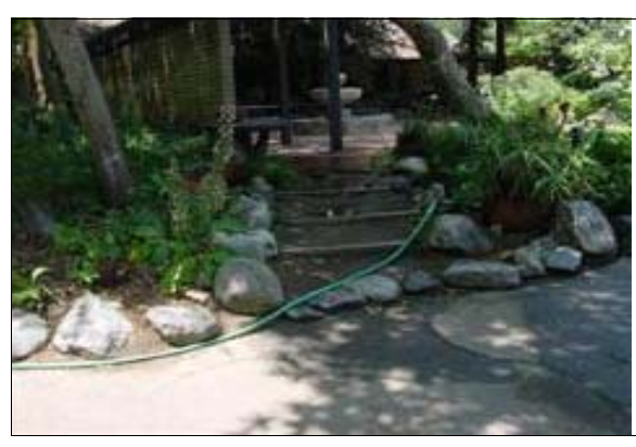
Path of Travel to the Museum