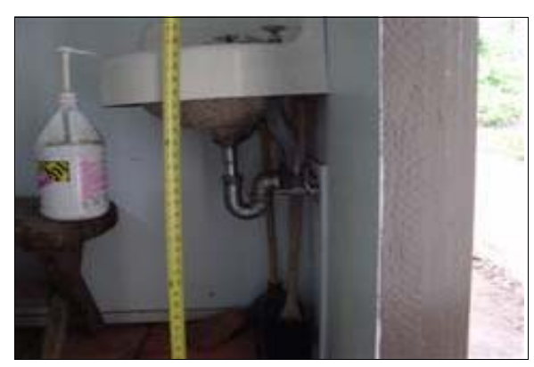
Unisex Restroom at the Rear of the Museum

Full Rec: Replace the lavatory designated to be accessible in the restroom to provide at least 29 inches of clear knee space between the finished floor and bottom of the lavatory apron. Make sure to provide at least 27 inches at 8 inches under the apron (see ADAAG 4.19.2).