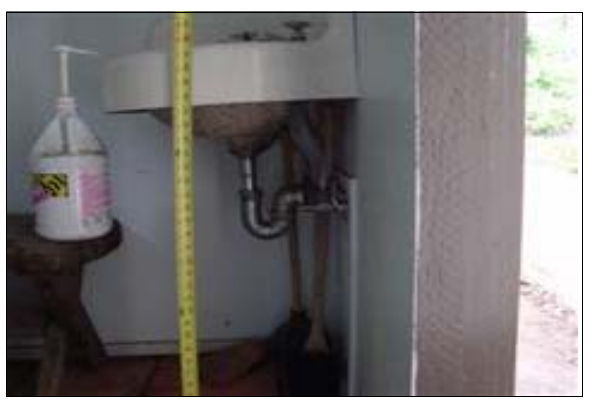
Unisex Restroom at the Rear of the Museum

Full Rec: Install faucet controls complying with ADAAG 4.19.5 on the lavatory designated to be accessible in the restroom. Lever-operated, push-type, touch-type or electronically controlled mechanisms are acceptable elements (see ADAAG 4.19.5). If self-closing valves are used the faucet shall remain open for at least 10 seconds.