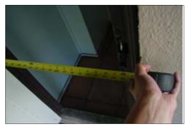
Unisex Restroom at the Rear of the Museum

a clear opening width of at least 32 inches when the door is open 90 degrees (see ADAAG 4.13.5).