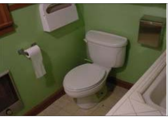
Unisex Restroom in the Museum