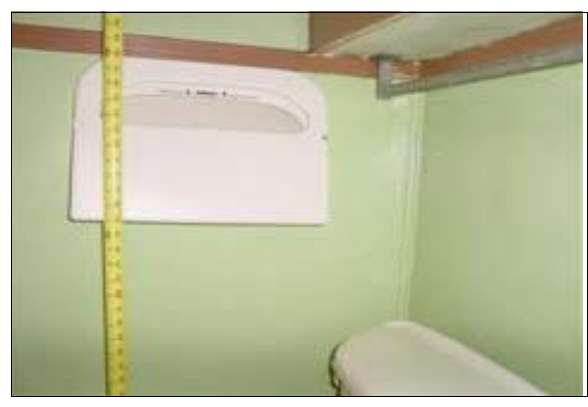
Unisex Restroom in the Museum