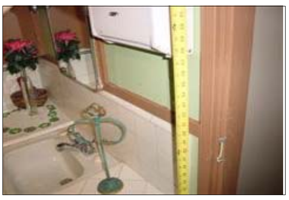
Unisex Restroom in the Museum