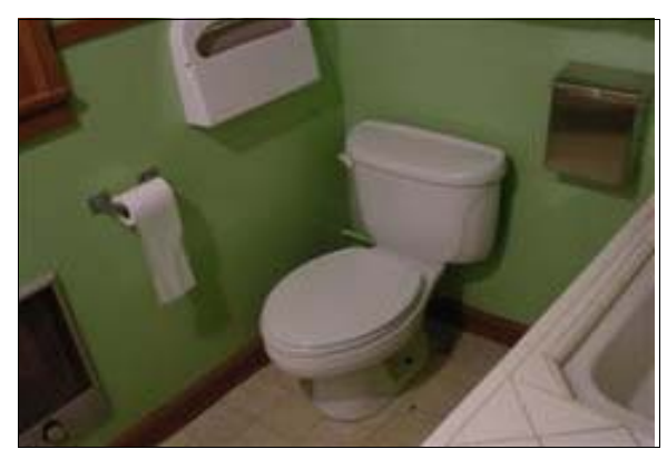
Unisex Restroom in the Museum

One or more walls may need to be moved to provide sufficient clear floor space to inscribe a 60-inch diameter turning radius in the restroom to accommodate an individual in a wheelchair.