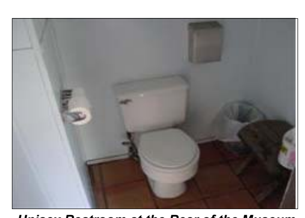
Unisex Restroom at the Rear of the Museum Citations: CBC 1115B.8; ADAAG 4.17.6; ADAAG 4.26.3

Minimum Quantity: 1 Maximum Quantity at least 250 pounds and shall be less than the allowable Minimum Estimated Cost: $531.00 Maximum Estimated Cost: $531.00