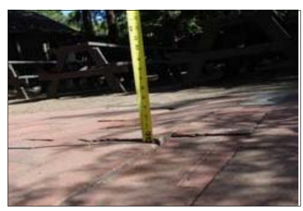
Path of Travel at the Outdoor Dining Area Citations: CBC 1133B.7.4; ADAAG 4.3.8; ADAAG 4.5.2

Minimum Quantity: 1 Maximum Quantity 1 Minimum Estimated Cost: $1,440.00 Maximum Estimated Cost: