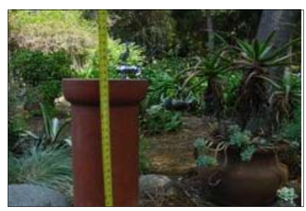
Path of Travel to the Drinking Fountain