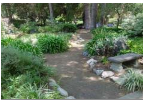
Path of Travel Throughout the Park

surface. No protruding objects are permitted on the accessible path of travel and slopes shall not exceed 5% in the direction of travel.