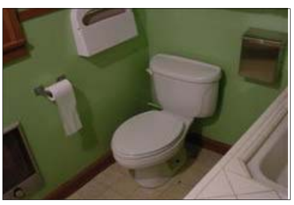
Unisex Restroom in the Museum