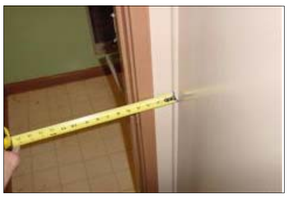
Unisex Restroom in the Museum

Citations: ADAAG 4.13.6; CBC 1133B.2.4.2