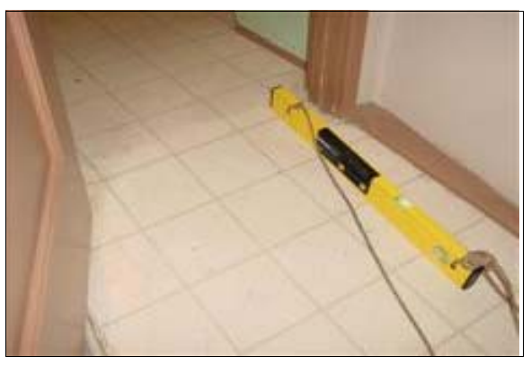
Unisex Restroom in the Museum

length in the direction of the door swing.