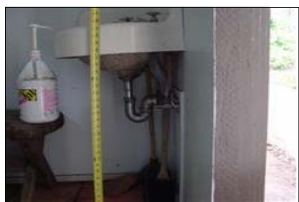
Unisex Restroom at the Rear of the Museum

18 inches. Make sure to provide at least 30 inches in width and 48 inch length of clear floor space to allow an accessible forward approach (see ADAAG 4.19.3).