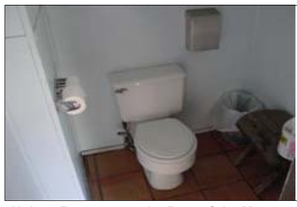
Unisex Restroom at the Rear of the Museum