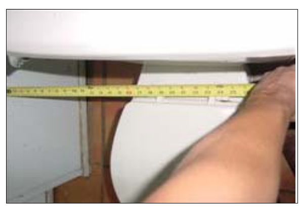
Unisex Restroom at the Rear of the Museum

Full Rec: Relocate the toilet so that the distance from the centerline of the toilet to the nearest side wall in the restroom is exactly 18 inches (see ADAAG Figure 28.