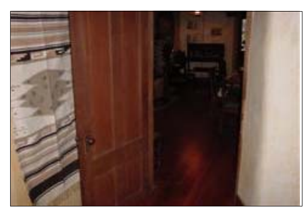
Interior Doors in the Museum