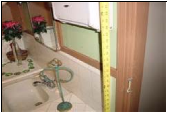
Unisex Restroom in the Museum

Full Rec: Relocate the paper towel dispenser in the restroom to a maximum height of 40 inches for all the controls and operating mechanisms (see CBC 1115B.9.2).