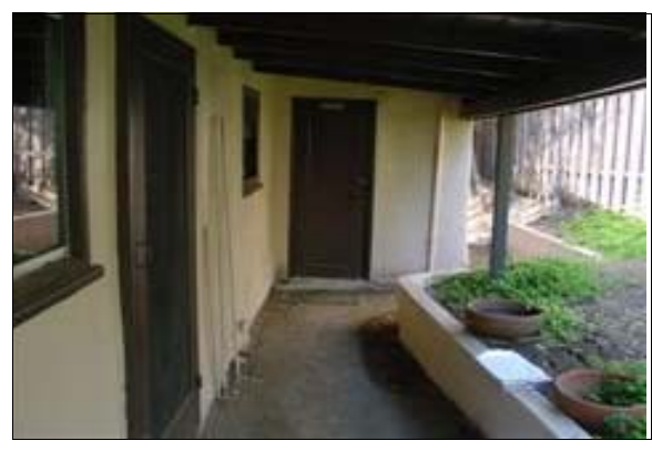
Unisex Restroom at the Rear of the Museum