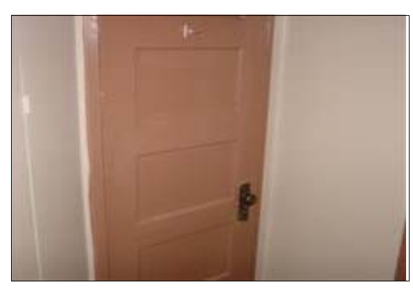
Unisex Restroom in the Museum