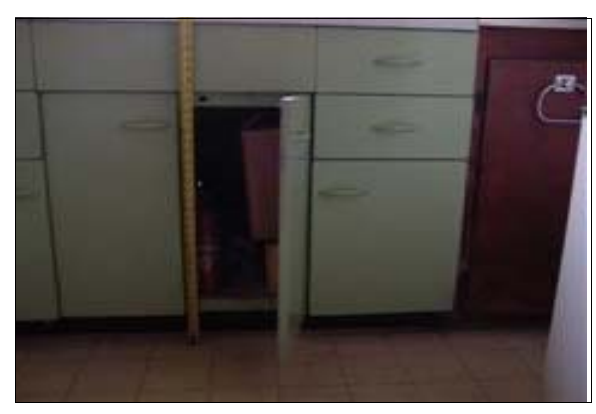
Sink in the Museum

designated to be accessible in the room to protect against contact (see ADAAG 4.19.4). Make certain there are no sharp or abrasive surfaces under the sink.