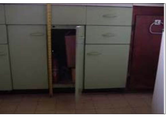
Sink in the Museum

minimum of nine inches clear toe space (see ADAAG 4.19.2). If neither clear floor space and knee and toe clearance can be provided, remove the sink cabinet and Maximum Estimated Cost: replace with an accessible wall-mounted sink unit.