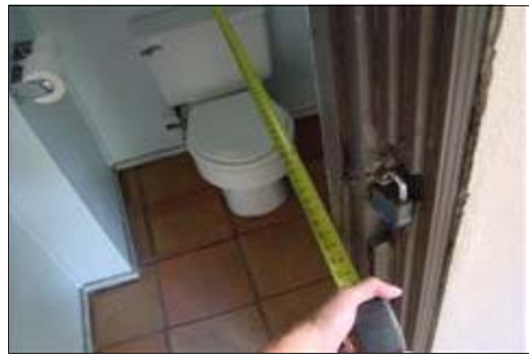
Unisex Restroom at the Rear of the Museum

One or more walls may need to be moved to provide sufficient clear floor space to inscribe a 60-inch diameter turning radius in the restroom to accommodate an individual in a wheelchair.