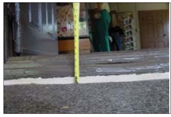
Path of Travel to the Museum

Citations: CBC 1114B.1.2; CBC 1133B.7.4; ADAAG 4.3.8