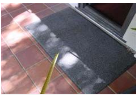
Path of Travel to the Museum

edges on all sides to prevent roll over.