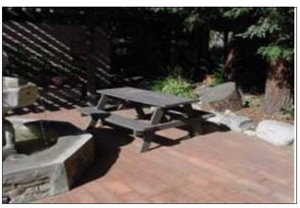
Path of Travel to the Outdoor Dining Area