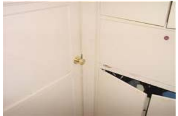
Interior Doors in the Caretaker's House

Finding: There is less than 18 inches of latch side clearance from the pull side of the interior entrance door.