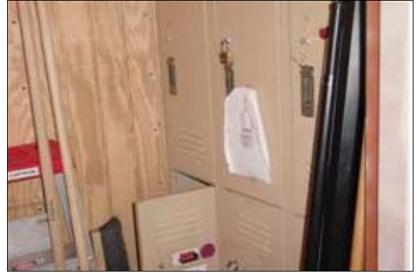
Skate Park Operations Office

Full Rec: When an individual with a disability has need for the locker service, modify a locker as needed or provide equivalent facilitation upon request.