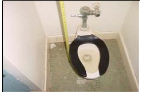
Men's Restroom in the High School Locker Room at Stengel Field

Full Rec: Remove or modify the toilet in the stall designated to be accessible in the restroom so that the seat height is between 17 inches and 19 inches above the finished floor (see ADAAG 4.16.3).