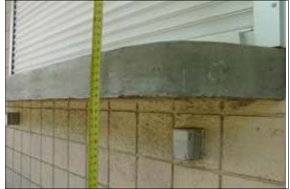
Skate Park Operations Office

Full Rec: Lower at least a 36 inch wide portion of the reception counter to a maximum height between 28 and 34 inches (see CBC 1122B.4).