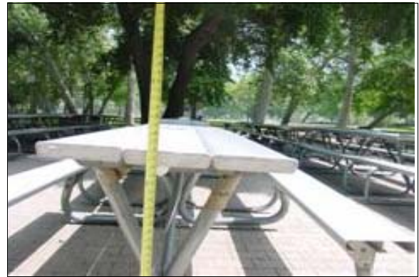
Outdoor Dining Area Next to the Food Service Building

Citations: CBC 1122B.3; ADAAG 4.32.2; ADAAG 4.32.5(2)