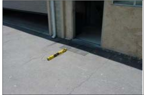
Path of Travel to the Maintenance Building

Full Rec: Securely fasten the mats or replace with a mat that grips to the underlying floor surface to provide a firm, stable, continuous and relatively smooth path of travel surface (see CBC 1124B.3 and ADAAG 4.5.3). Mats along the primary path of travel shall provide beveled edges on all sides to prevent roll over.