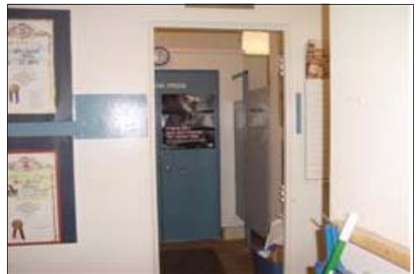
Men's Restroom in the High School Locker Room at Stengel Field

Full Rec: Widen the entrance doorway to the restroom to provide a clear opening width of at least 32 inches when the door is open 90 degrees (see ADAAG 4.13.5).