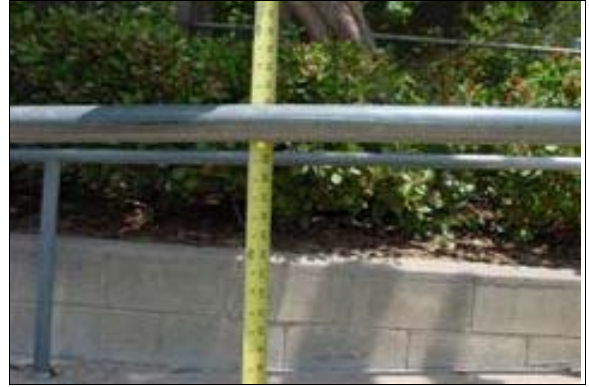
Exterior Ramp to Stengel Field

Finding: The handrails are mounted at a height less than 34 inches. There are no 12-inch extensions beyond the top and bottom of the ramp.