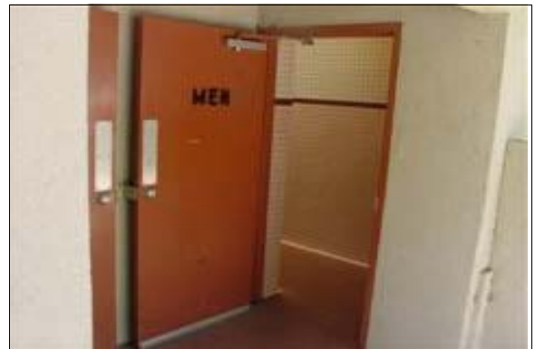
Men's Restroom at Stengel Field

Full Rec: The restroom is designated accessible and should be made accessible for the facility. Post signage centered 60 inches above the ground surface on the latch side of the entrance door identifying the restroom as accessible upon completion of the following items (see CBC 1115B., ADAAG 4.1.2(7) and ADAAG 4.1.6(3)(e)). Signage shall include Braille and raised lettering, the gender or unisex use symbol and the ISA symbol. Post Title 24 gender use signage on the door @ 60" o.c. a.f.f.