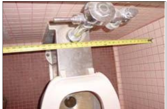
Men's Restroom at Stengel Field

Finding: The distance from the center of the toilet to the nearest side wall in the stall designated to be accessible in the restroom is greater than 18 inches.