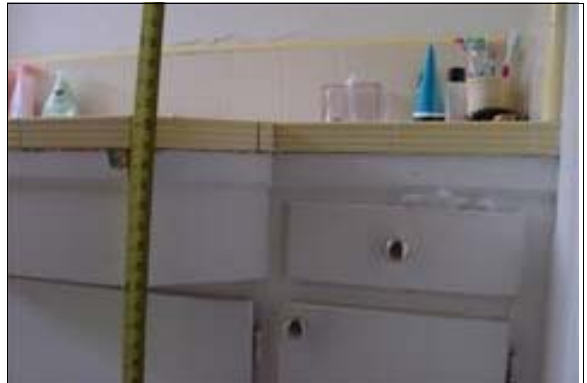
Unisex Restroom in the Caretaker's House

Finding: The lavatory in the restroom is in an enclosed cabinet, thereby preventing an accessible forward approach.