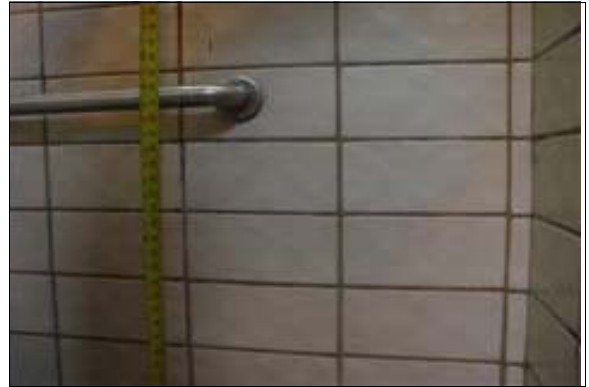
Men's South Restroom

Finding: The height of the back grab bar in the stall designated to be accessible of the restroom is greater than 33 inches above the finished floor.