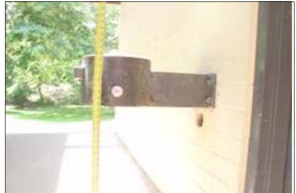
Drinking Fountain at the North Restrooms

Full Rec: Fifty percent of the drinking fountains on primary paths of travel shall be accessible (see CBC 1117B.1 and ADAAG 4.15). Install a "high-low" fountain design to comply with both state and federal requirements and install a side rail or wing wall next to each side of the fountain. The height of the spout outlet shall not exceed 36 inches in height.