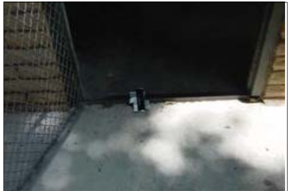
Food Service Building

Finding: The height of the threshold at the entrance door is greater than 1/2 inch.