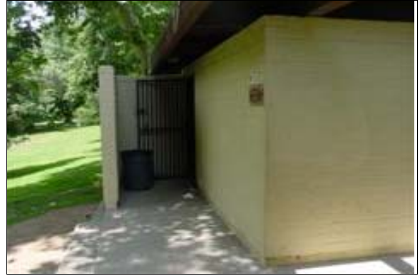
Men's North Restrooms

Full Rec: The restroom is designated accessible and should be made accessible for the facility. Post signage centered 60 inches above the ground surface on the latch side of the entrance door identifying the restroom as accessible upon completion of the following items (see CBC 1115B., ADAAG 4.1.2(7) and ADAAG 4.1.6(3)(e)). Signage shall include Braille and raised lettering, the gender or unisex use symbol and the ISA symbol. Post Title 24 gender use signage on the door @ 60" o.c. a.f.f.