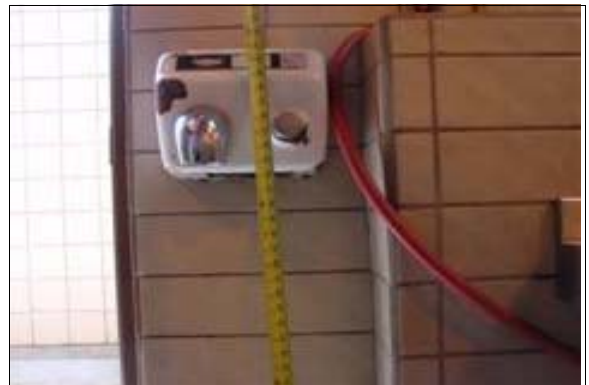
Women's South Restroom

Finding: The height of the controls and operating mechanisms for the hand dryer in the restroom is greater than 40 inches in height.