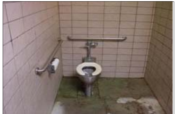
Men's South Restroom

Finding: The flush control on the toilet in the stall designated to be accessible in the restroom is not on the wide (approach) side of the toilet.