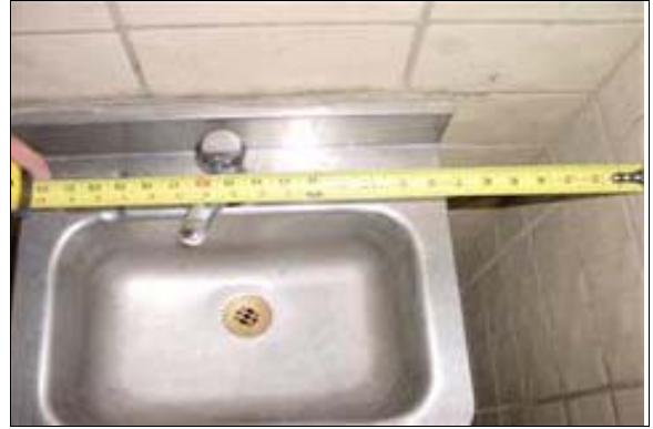
Men's North Restrooms

Finding: The distance from the center of the lavatory to the adjacent side wall in the restroom is less than 18 inches.