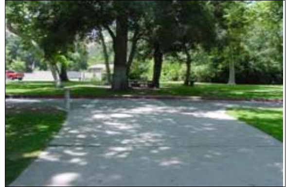
Path of Travel to the Outdoor Dining Area

Full Rec: Provide at least one accessible route from the public right of way to the accessible entrance of the facility. Make certain to post signage indicating the direction to accessible building entrances at every major junction along the accessible route. Signs shall include the International Symbol of Accessibility.