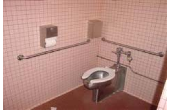
Women's Restroom at Stengel Field

Full Rec: Relocate the flush control on the toilet in the stall designated to be accessible in the restroom so that it is on the wide (approach) side of the toilet area (see ADAAG 4.16.5). Flush controls shall be hand-operated or automatic mechanisms.