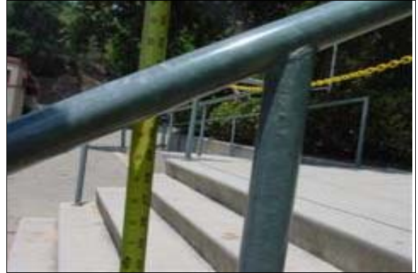
Exterior Stairs to Stengel Field

Finding: The handrails are mounted at a height less than 34 inches above the nosing of the treads.