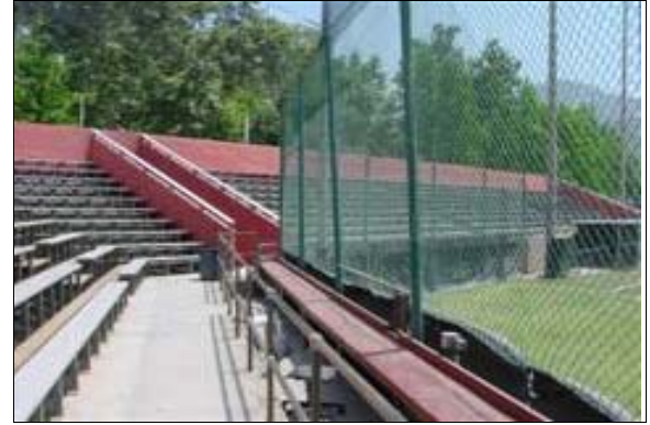
Stengel Field Stadium

Full Rec: Post signage at the ticket counter indicating the availability and location of accessible seating areas (see CBC 1104B.3.4.1).