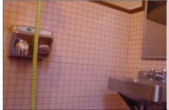
Women's Restroom at Stengel Field

Full Rec: Relocate the hand dryer in the restroom to a maximum height of 40 inches for all the controls and operating mechanisms (see CBC 1115B.9.2).