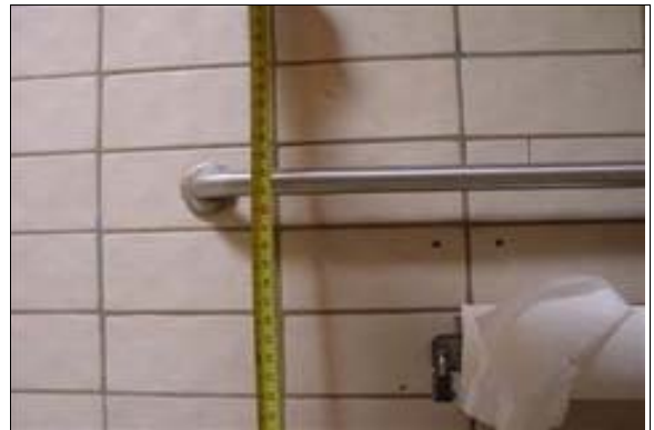
Women's North Restrooms

Finding: The height of the back grab bar in the stall designated to be accessible of the restroom is less than 33 inches above the finished floor. The height of the side grab bar in the stall designated to be accessible of the restroom is greater than 33 inches above the finished floor.