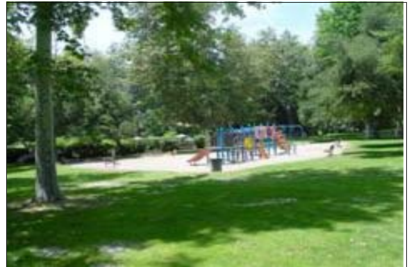
Play Equipment at the North End of the Park

Finding: The path of travel to the play area consists of grass, making the area nonaccessible to individuals with mobility impairments. The surface beneath the play area is sand, making the area nonaccessible to individuals with mobility impairments.