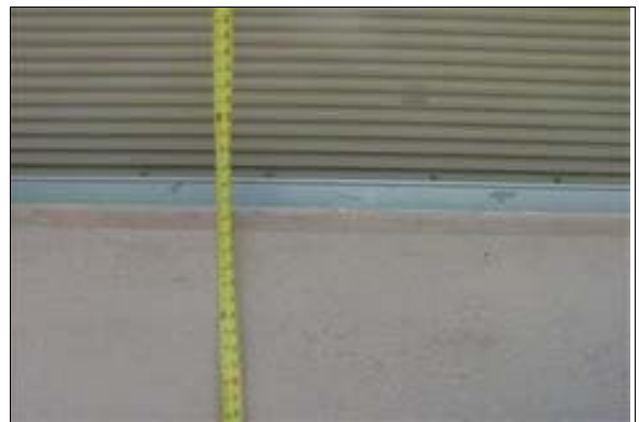
Stengel Field Stadium

Finding: The height of the concession counter at the Stengel Field Stadium is greater than 36 inches.