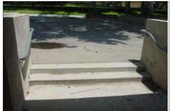
Exterior Stairs to the Restrooms at Stengel Field

Full Rec: Affix detectable contrasting striping to each tread of the stairway that clearly contrasts in color from the tread and is at least 2 inches in width placed no more than 1 inch from the tread nose or landing.