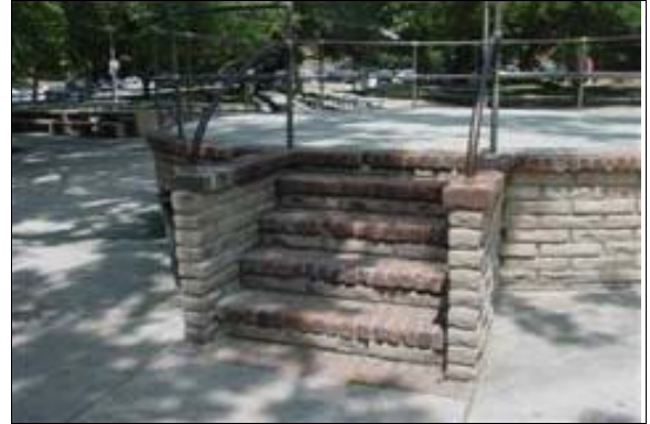
Exterior Stairs to the Outdoor Stage

Full Rec: Install an exterior stairway with a minimum width of 48 inches (see CBC 1006.2).