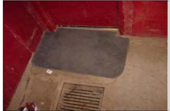
Path of Travel to the Locker Rooms at Stengel Field

Full Rec: Securely fasten the mats or replace with a mat that grips to the underlying floor surface to provide a firm, stable, continuous and relatively smooth path of travel surface (see CBC 1124B.3 and ADAAG 4.5.3). Mats along the primary path of travel shall provide beveled edges on all sides to prevent roll over.