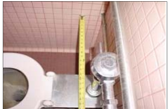
Women's Restroom at Stengel Field

Full Rec: Relocate the toilet or stall side wall so that the distance from the centerline of the toilet to the nearest side wall in the stall designated to be accessible in the restroom is exactly 18 inches (see ADAAG Figure 28).