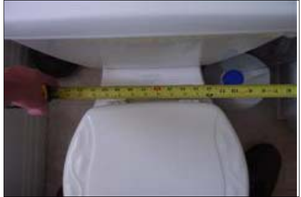
Unisex Restroom in the Caretaker's House

Finding: The distance from the center of the toilet to the nearest side wall in the restroom is less than 18 inches.