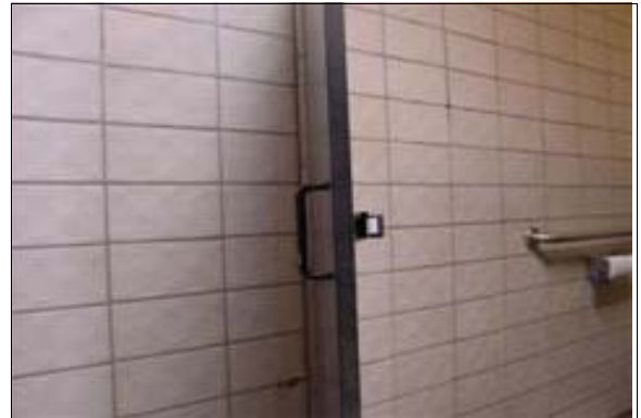
Men's South Restroom

Full Rec: Install a loop or U-shaped handle immediately below the latch hardware on the door to the stall designated to be accessible in the restroom (see CBC 1115B.7.1.3 and ADAAG 4.13.9). Lever-operated or push-type mechanisms may also be used. The latch shall be flip-over style, sliding or other hardware not requiring grasping or twisting.