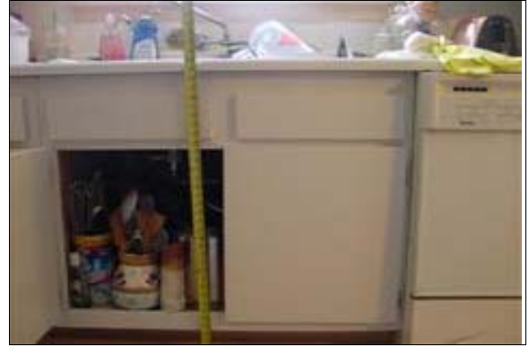
Sink in the Caretaker's House

Full Rec: Insulate or otherwise configure pipes under the sink designated to be accessible in the room to protect against contact (see ADAAG 4.19.4). Make certain there are no sharp or abrasive surfaces under the sink.