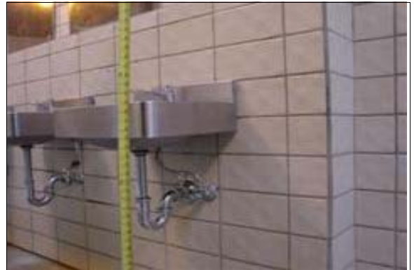
Women's South Restroom

Finding: The pipes under the lavatory in the restroom do not provide protection against contact.