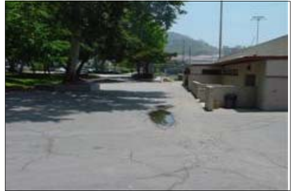
Path of Travel to Stengel Field

Full Rec: Stripe a crosswalk not less than 48 inches wide on the path of travel to the accessible entrance of the facility. Provide a level surface that does not exceed a slope greater than 5%. Cross slopes shall not exceed 2%. Detectable warnings should be placed at the entrance and exit of the crosswalk.