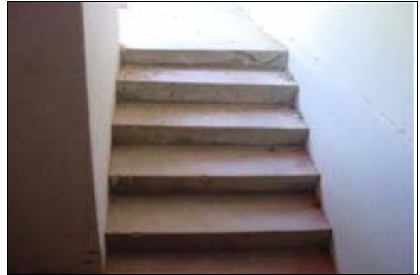
Exterior Stairs to the Locker Rooms at Stengel Field

Full Rec: Install an exterior stairway with a minimum width of 48 inches (see CBC 1006.2).