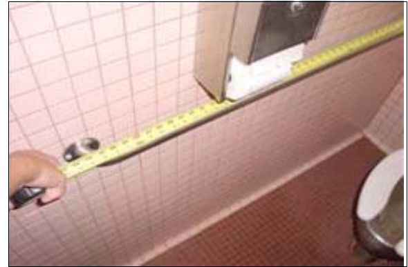
Women's Restroom at Stengel Field

Full Rec: The front end of the grab bar shall extend at least 54 inches from the back wall and the back end of the grab bar shall be mounted within 12 inches from the back wall. Grab bars must be able to support a point load of at least 250 pounds and shall be less than the allowable shear stress of the grab bar material.