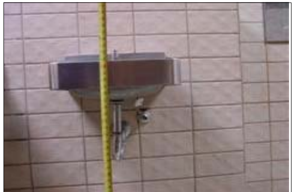
Men's South Restroom

Finding: The pipes under the lavatory in the restroom do not provide protection against contact.