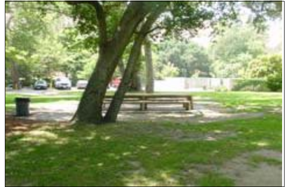
Outdoor Dining Area Next to the Maintenance Building

Full Rec: Modify or replace one of the tables in the outdoor dining area to provide knee clearance of at least 27 inches in height, 30 inches in width and 19 inches in depth (see CBC 1122B.3, ADAAG 4.32.2 and ADAAG Figure 45). The table top height shall not exceed 34 inches above the finished floor.