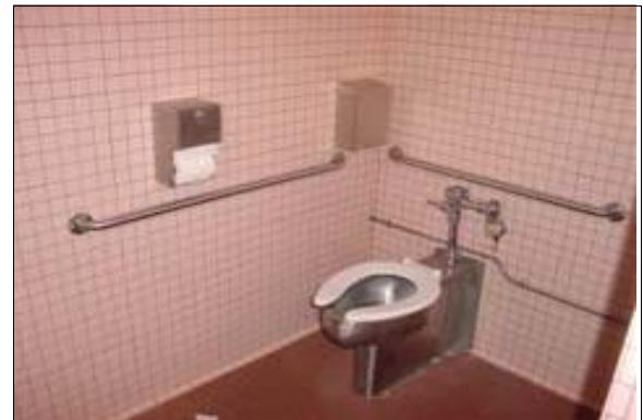
Women's Restroom at Stengel Field

Full Rec: Remount the toilet paper dispenser in the stall designated to be accessible in the restroom so that it does not interfere with the use of the side grab bar (see ADAAG 4.16.6 and Figure 29(b)). Toilet paper dispensers must allow continuous paper flow.