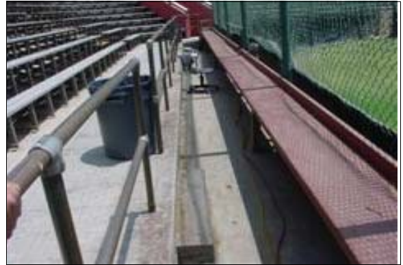
Stengel Field Stadium

Finding: The press box at the stadium is stair-access only and is not accessible to individuals with mobility impairments.