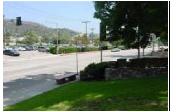
Accessible Route from the Public Right of Way

Citations: CBC 1114B.1.2; CBC 1117B.5.7; CBC 1127B.3; ADAAG 4.1.2(7); ADAAG 4.3.2; ADAAG 4.14.1