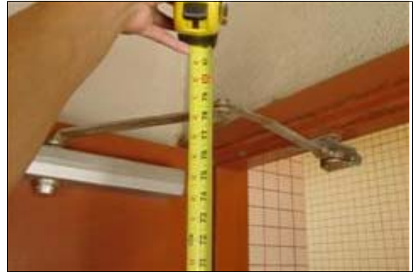
Men's Restroom at Stengel Field

Full Rec: Replace the door closing device with a device that fits above the door casing and does not protrude into the primary path of travel.