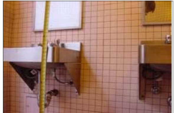
Men's Restroom at Stengel Field

Full Rec: Lower the mirror in the restroom so that the bottom edge of the reflecting surface is no higher than 40 inches above the finished floor and the topmost portion of the reflecting surface extends at least 74 inches above the finished floor (see ADAAG A4.19.6). A single, full-length mirror is recommended since it can accommodate all people. Make certain to provide a minimum clear floor space in front of the mirror of 30 inches in width and 48 inches in length.