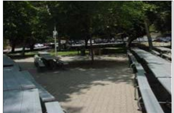
Open Tree Wells

Full Rec: Install edge protection on each side of the open tree well consisting of 3-inch high guide curb above the surface of the path of travel (see CBC 1133B.7.1 and ADAAG 4.3.8).