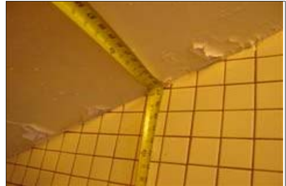
Men's Restroom at Stengel Field