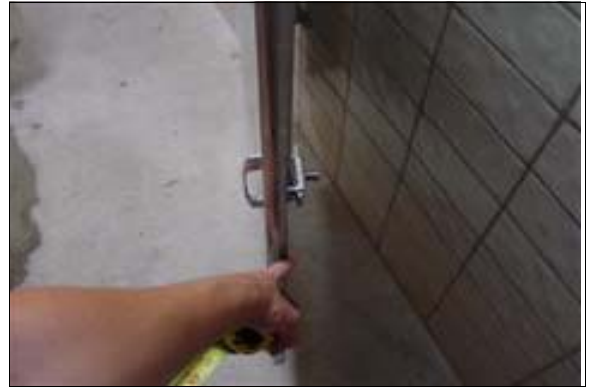
Women's North Restrooms

Finding: The door to the stall designated to be accessible in the restroom does not close automatically or have accessible hardware.