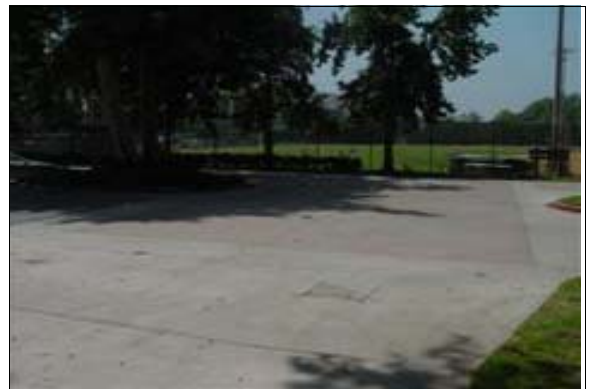
Parking Lot Next to the Skate Park Operations Office

Finding: There is no crosswalk provided on the path of travel from the accessible parking space to the facility. The required accessible route crosses a vehicular way.