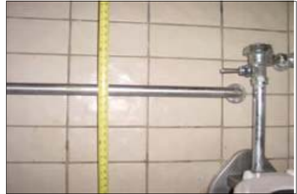
Men's North Restrooms