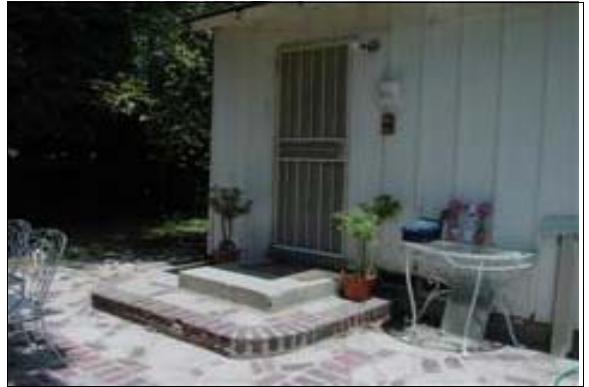
Caretaker's House (Rear Entrance)

Finding: The clear opening width of the door is less than 32 inches.