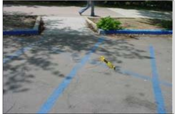
Parking Lot Next to the Skate Park Operations Office

Finding: The surface of the accessible parking space, at the left, and the access aisle has a slope greater than 2%.