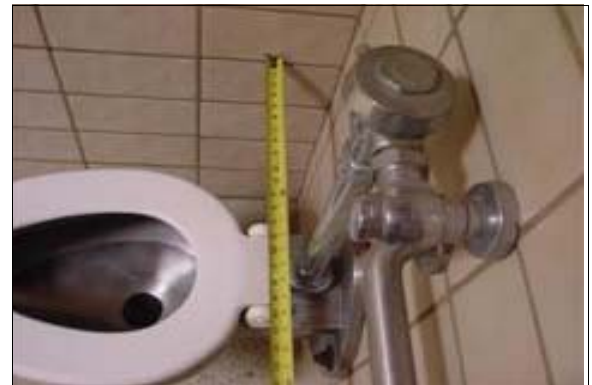
Women's North Restrooms

Full Rec: Relocate the toilet or stall side wall so that the distance from the centerline of the toilet to the nearest side wall in the stall designated to be accessible in the restroom is exactly 18 inches (see ADAAG Figure 28).