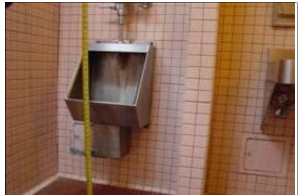
Men's Restroom at Stengel Field

Full Rec: Replace the urinal designated to be accessible in the restroom with a wall-mounted or stall-type tapered, elongated rim unit complying with ADAAG 4.18.2. The height of the rim surface of the urinal designated to be accessible shall not exceed 17 inches above the finished floor and the flush control valve shall not exceed a height of 44 inches above the finished floor.