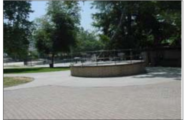
Path of Travel to the Outdoor Stage