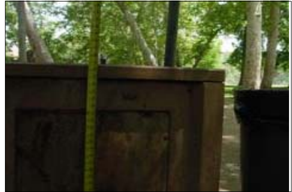
Drinking Fountains at the Outdoor Dining Area Next to the Food Service Building

Full Rec: Install a 48-inch wide path to the picnic tables in the outdoor dining area that provides a smooth, stable, firm and slip resistant surface. Provide a maneuvering space sufficient to provide a 60-inch diameter turning radius adjacent to at least one of the picnic tables in the outdoor dining area.