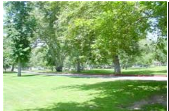
Outdoor Dining Area at the North End of the Park

Citations: ADAAG 5.8; ADAAG A4.2.5; ADAAG A4.2.6