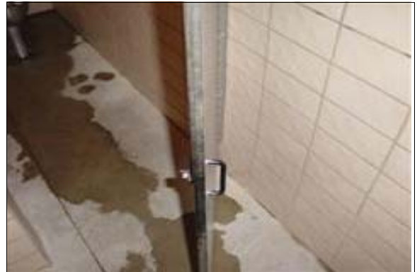
Women's South Restroom

Full Rec: Install a loop or U-shaped handle immediately below the latch hardware on the door to the stall designated to be accessible in the restroom (see CBC 1115B.7.1.3 and ADAAG 4.13.9). Lever-operated or push-type mechanisms may also be used. The latch shall be flip-over style, sliding or other hardware not requiring grasping or twisting.