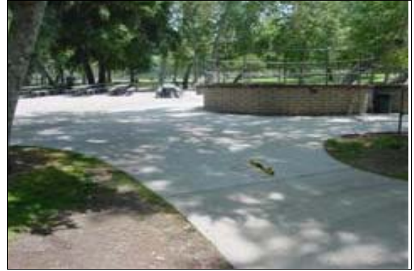
Path of Travel to the Outdoor Dining Area

Full Rec: Resurface the path of travel to provide a level surface that does not exceed a slope greater than 5%. Cross slopes shall not exceed 2%.