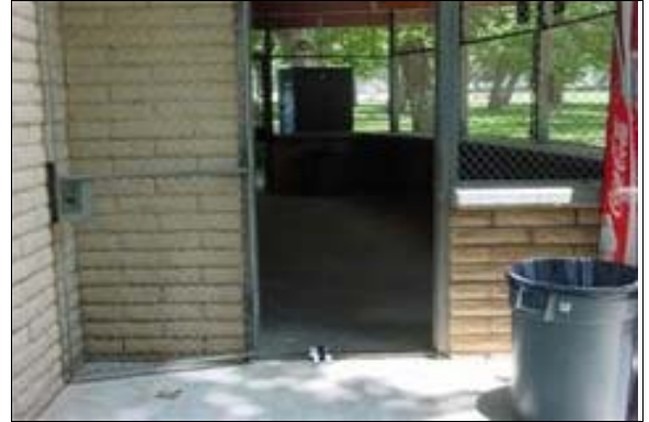
Food Service Building

Full Rec: The International Symbol of Accessibility shall be the standard used to identify facilities that are accessible to and usable by physically disabled persons (see CBC 1117B.5.1). All building entrances that are accessible to and usable by persons with disabilities shall be identified with an ISA symbol (see CBC 1117B.5.7).