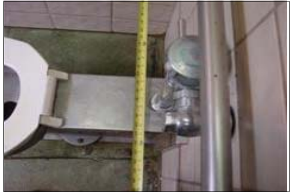
Men's South Restroom

Finding: The distance from the center of the toilet to the nearest side wall in the stall designated to be accessible in the restroom is greater than 18 inches.