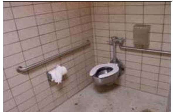
Women's North Restrooms

Full Rec: The front end of the grab bar shall extend at least 54 inches from the back wall and the back end of the grab bar shall be mounted within 12 inches from the back wall. Grab bars must be able to support a point load of at least 250 pounds and shall be less than the allowable shear stress of the grab bar material.