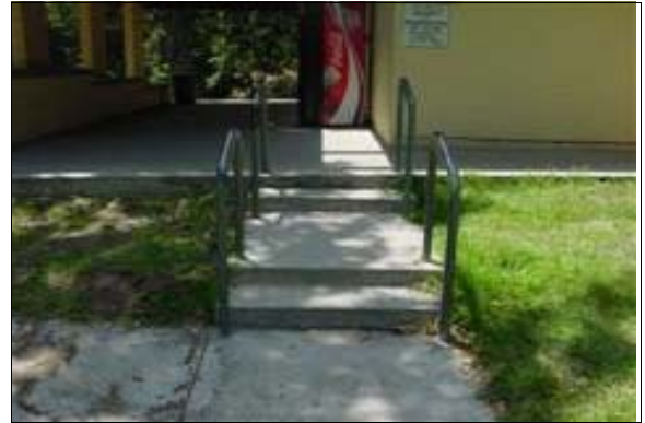
Exterior Stairs to the North Restrooms

Full Rec: Affix detectable contrasting striping to each tread of the stairway that clearly contrasts in color from the tread and is at least 2 inches in width placed no more than 1 inch from the tread nose or landing.