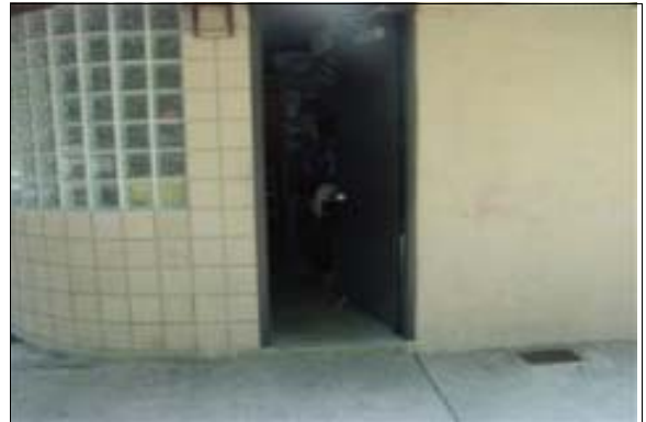
Skate Park Operations Office

Finding: The main entrance does not have accessible signage mounted on the wall adjacent to the latch side of the door.