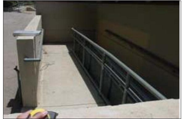
Path of Travel to the Restrooms at Stengel Field

Full Rec: Modify the exterior primary path of travel by extending the width of the concrete walkway to at least 48 inches (see CBC 1118B.2 and ADAAG 4.3.3). Since the accessible route is less than 60 inches in width, provide passing spaces at least 60 inches by 60 inches at reasonable intervals every 200 feet.