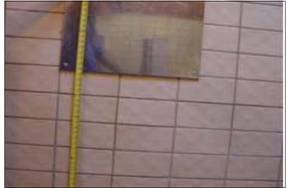
Women's South Restroom

Finding: The bottom edge of the reflecting surface of the mirror in the restroom is greater than 40 inches above the finished floor.