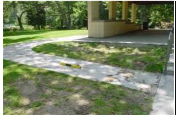
Path of Travel to the North Restrooms

Citations: CBC 1133B.7.1.3; CBC 1133B.7.3; ADAAG 4.3.7