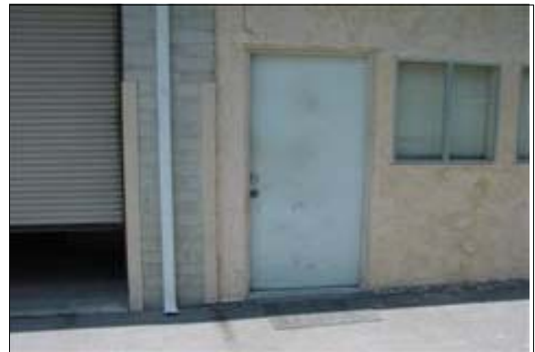
Path of Travel to the Maintenance Building and Caretaker's House

Full Rec: Stripe a crosswalk not less than 48 inches wide on the path of travel to the accessible entrance of the facility. Provide a level surface that does not exceed a slope greater than 5%. Cross slopes shall not exceed 2%. Detectable warnings should be placed at the entrance and exit of the crosswalk.