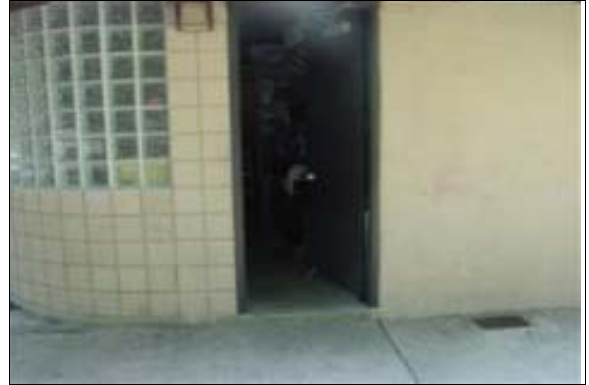
Path of Travel to the Skate Park Operations Office

Finding: There is a step on the primary path of travel to Skate Park Operations Office, preventing access to individuals with mobility impairments.