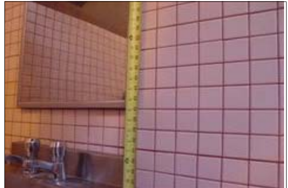
Women's Restroom at Stengel Field

Finding: The bottom edge of the reflecting surface of the mirror in the restroom is greater than 40 inches above the finished floor.