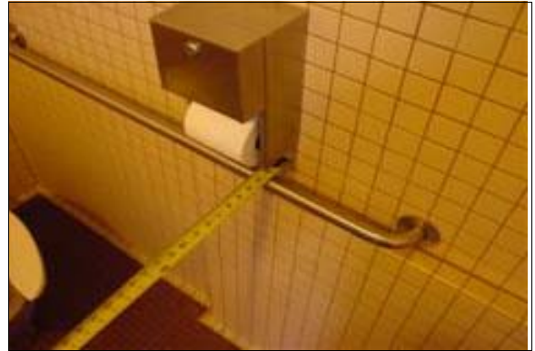
Men's Restroom at Stengel Field

Finding: The toilet paper dispenser in the stall designated to be accessible in the restroom interferes with the use of the side grab bar.