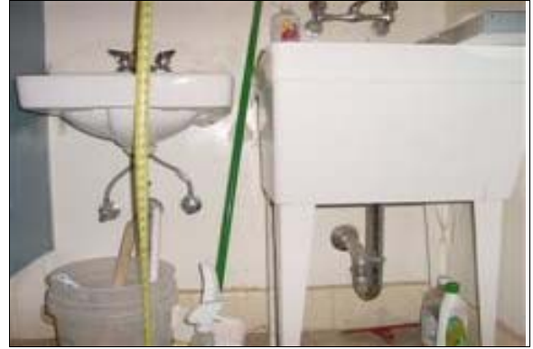
Men's Restroom in the High School Locker Room at Stengel Field

Full Rec: Insulate or otherwise configure pipes under the lavatory designated to be accessible in the restroom to protect against contact (see ADAAG 4.19.4). Make certain there are no sharp or abrasive surfaces under the lavatory.