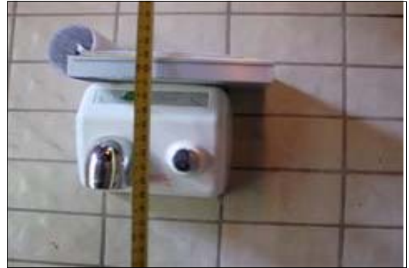
Men's North Restrooms

Full Rec: Relocate the hand dryer in the restroom to a maximum height of 40 inches for all the controls and operating mechanisms (see CBC 1115B.9.2).