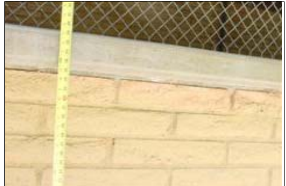
Food Service Building

Finding: The height of the concession counter at the Food Service Building is greater than 36 inches.