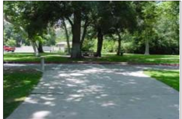
Path of Travel to the Outdoor Dining Area

Full Rec: Bevel the area or resurface the area to provide a smooth and level path of travel (see CBC 1133B.7.4 and ADAAG 4.3.8 and ADAAG 4.5.2).