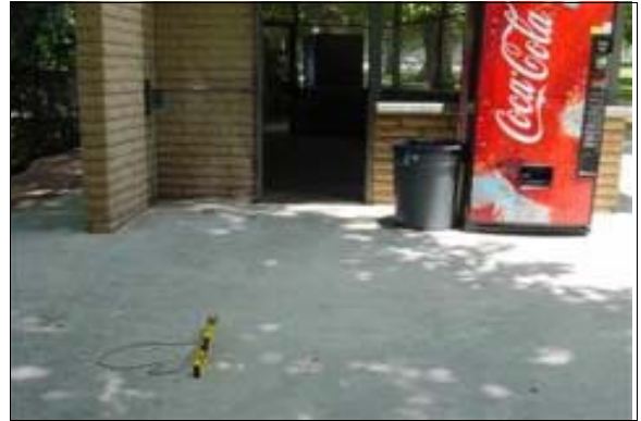
Path of Travel to the Food Service Building

Finding: There are slopes greater than 5% on the primary path of travel to the Food Service Building.