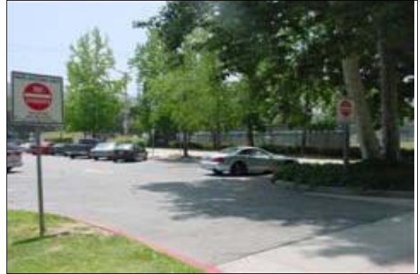
Parking Lot Next to the Skate Park Operations Office

Finding: There is no warning signage posted at the entrance to the parking lot regarding unauthorized use of accessible parking spaces in the parking lot.