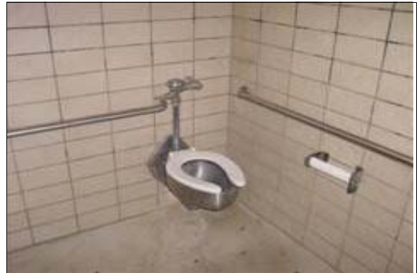
Men's North Restrooms

Full Rec: Install a door with appropriate accessible door hardware on the stall designated to be accessible in the restroom (see CBC 1115B.7.1.3 and ADAAG 4.13.9).