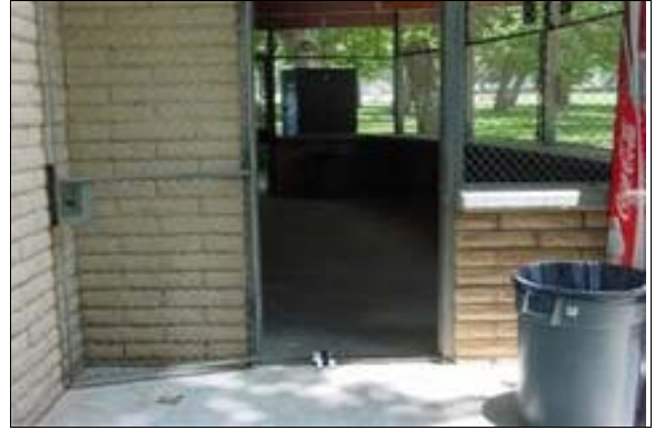
Food Service Building

Finding: The exterior entrance door does not provide accessible hardware.