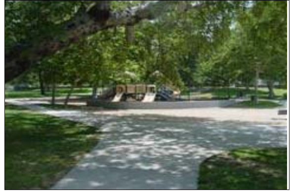
Play Area Next to the Skate Park

Finding: The surface at the play area is sand, making the area nonaccessible to individuals with mobility impairments.