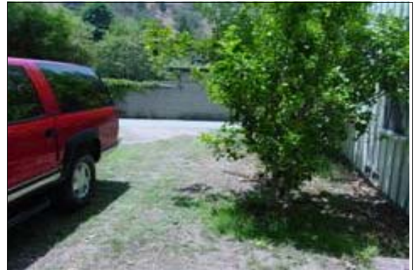
Path of Travel to the Caretaker's House

Full Rec: Install an accessible route to where programs, services and activities are provided (see CBC 1114B.1.2 and ADAAG 4.3.2). The minimum width of the path of travel shall be 48 inches with a firm, stable and slip-resistant surface. No protruding objects are permitted on the accessible path of travel and slopes shall not exceed 5% in the direction of travel.