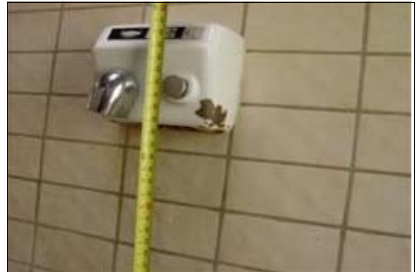
Women's North Restrooms

Full Rec: Relocate the hand dryer in the restroom to a maximum height of 40 inches for all the controls and operating mechanisms (see CBC 1115B.9.2).