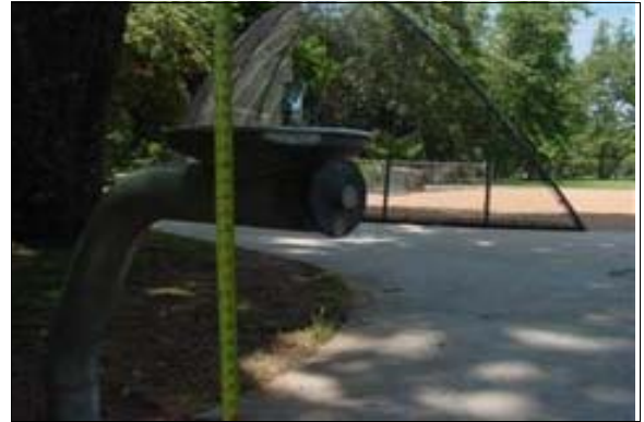
Drinking Fountain at the Baseball Field

Full Rec: Fifty percent of the drinking fountains on primary paths of travel shall be accessible (see CBC 1117B.1 and ADAAG 4.15). Install a "high-low" fountain design to comply with both state and federal requirements and install a side rail or wing wall next to each side of the fountain.