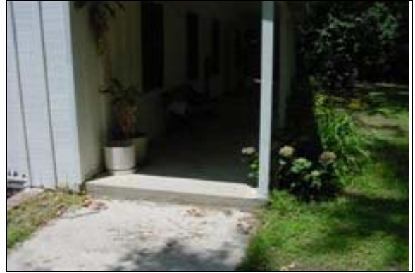
Path of Travel to the Caretaker's House

Finding: There is a step on the primary path of travel to the main entrance of the Caretaker's House, preventing access to individuals with mobility impairments.