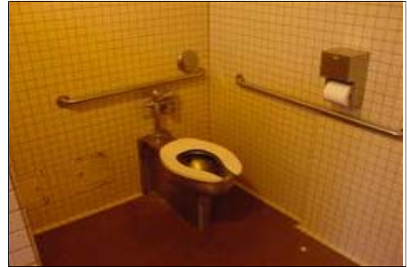
Men's Restroom at Stengel Field

Full Rec: Install a barrier, where there is less than 80 inches of clear vertical headroom, to warn blind or visually impaired individuals. A planter or a permanent piece of furniture may be used (see CBC 1121B.2 and ADAAG 4.4.2).