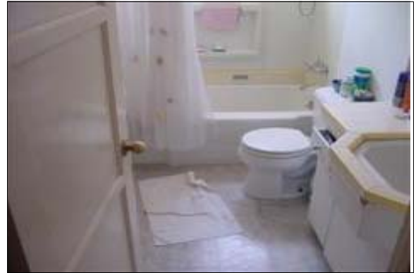
Unisex Restroom in the Caretaker's House

Full Rec: Consult a design professional to modify the restroom. One or more walls may need to be moved to provide sufficient clear floor space to inscribe a 60-inch diameter turning radius in the restroom to accommodate an individual in a wheelchair.