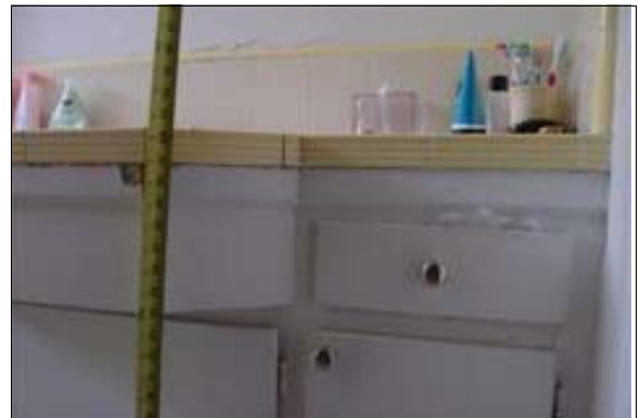
Unisex Restroom in the Caretaker's House

Full Rec: Insulate or otherwise configure pipes under the lavatory designated to be accessible in the restroom to protect against contact (see ADAAG 4.19.4). Make certain there are no sharp or abrasive surfaces under the lavatory.