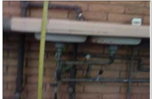
Sink in the Food Service Building

Full Rec: Relocate the sink designated to be accessible in the Food Service Building to provide a maximum counter surface height of no greater than 34 inches above the finished floor (see ADAAG 4.19.2).