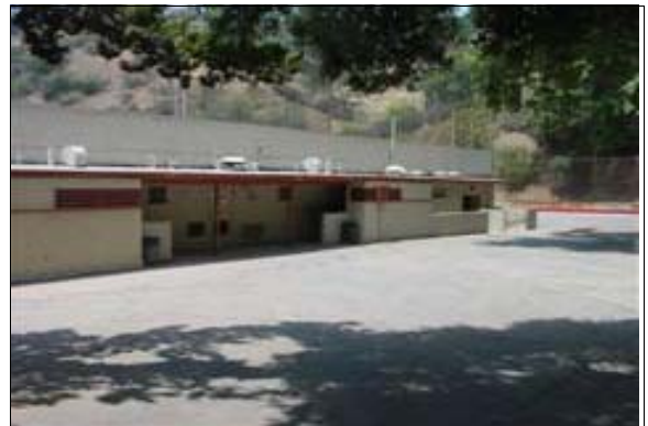
Path of Travel to the Locker Room and Restrooms at Stengel Field

Finding: There is no crosswalk provided on the path of travel to the locker room and restrooms at Stengel Field. The required accessible route crosses a vehicular way.