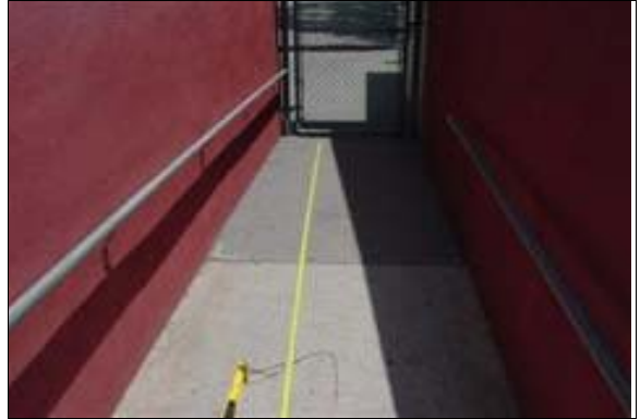
Entrance Gate to the Stengel Field Stadium (Right)

Finding: There is less than 24 inches of clearance on the latch side of the exterior entrance gate.