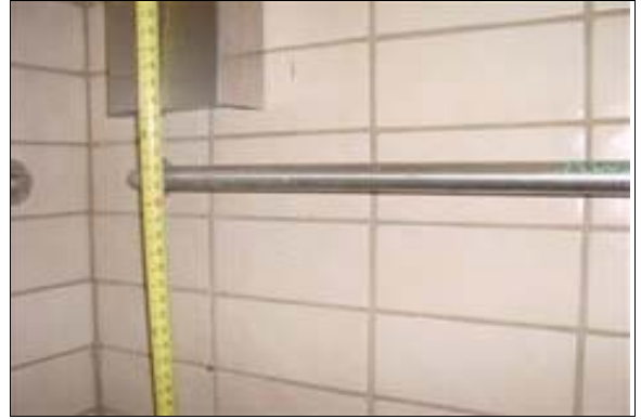
Women's South Restroom

Finding: The height of the side and back grab bar in the stall designated to be accessible of the restroom is greater than 33 inches above the finished floor.