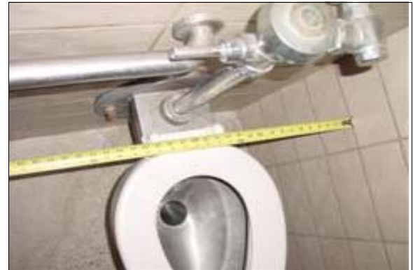
Men's North Restrooms