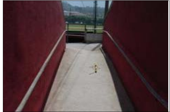
Exterior Ramp to the Stengel Field Stadium (Right)

Full Rec: Modify the run of the concrete ramp to provide a slope no greater than 8.33% with a cross slope not exceeding 2% (see CBC 1133B.5.3 and ADAAG 4.8.2).