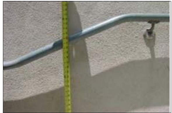
Exterior Stairs to the Restrooms at Stengel Field

Full Rec: Remount the handrails on the stairway so that the gripping surface of the handrails are at a consistent height between 34 inches and 38 inches above the stair nosings.