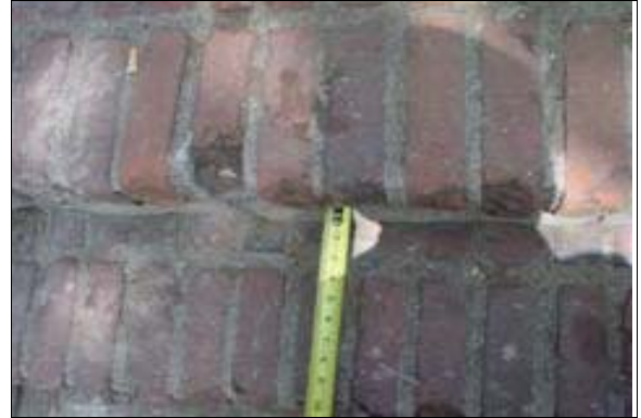
Exterior Stairs to the Outdoor Stage

Full Rec: Modify the nosings on the stairway so that the nosings are smooth and do not project more than 1/2 inch (see CBC 1006.2.2 and ADAAG 4.9.3). The radius of the curvature at the leading edge of the tread shall not exceed 1 1/2 inches.