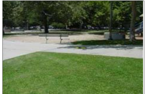
Path of Travel to the Play Equipment

Citations: CBC 1133B.7.1.3; CBC 1133B.7.3; ADAAG 4.3.7