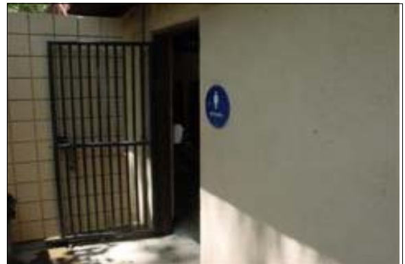
Women's South Restroom

Full Rec: The restroom is designated accessible and should be made accessible for the facility. Post signage centered 60 inches above the ground surface on the latch side of the entrance door identifying the restroom as accessible upon completion of the following items (see CBC 1115B., ADAAG 4.1.2(7) and ADAAG 4.1.6(3)(e)). Signage shall include Braille and raised lettering, the gender or unisex use symbol and the ISA symbol. Post Title 24 gender use signage on the door @ 60" o.c. a.f.f.