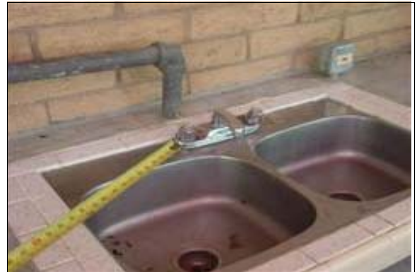
Sink in the Food Service Building

Full Rec: Install faucet controls complying with ADAAG 4.19.5 on the sink designated to be accessible in the Food Service Building. Lever-operated, push-type, touch-type or electronically controlled mechanisms are acceptable elements (see ADAAG 4.19.5). If self-closing valves are used the faucet shall remain open for at least 10 seconds.