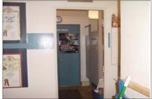
Men's Restroom in the High School Locker Room at Stengel Field

Full Rec: The restroom is designated accessible and should be made accessible for the facility. Post signage centered 60 inches above the ground surface on the latch side of the entrance door identifying the restroom as accessible upon completion of the following items (see CBC 1115B., ADAAG 4.1.2(7) and ADAAG 4.1.6(3)(e)). Signage shall include Braille and raised lettering, the gender or unisex use symbol and the ISA symbol. Post Title 24 gender use signage on the door @ 60" o.c. a.f.f.