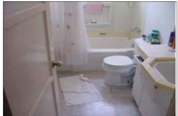
Unisex Restroom in the Caretaker's House

Full Rec: Replace the door hardware mounted on the restroom complying with ADAAG 4.13.9. Make certain accessible door hardware is mounted no higher than 48 inches above the finished floor.