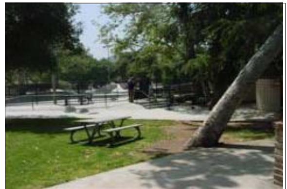
Path of Travel to the Skate Park

Full Rec: Since programs, services and activities to staff and the public (volunteers, etc.) are provided in this location, those programs, services and activities are required to be made accessible. It is recommended that a ramp be installed or other means of vertical access.