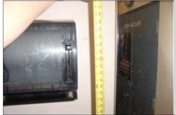
Men's Restroom in the High School Locker Room at Stengel Field

Full Rec: Relocate the paper towel dispenser in the restroom to a maximum height of 40 inches for all the controls and operating mechanisms (see CBC 1115B.9.2).