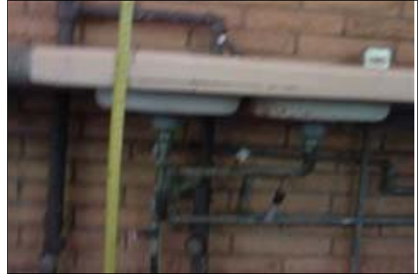
Sink in the Food Service Building

Full Rec: Insulate or otherwise configure pipes under the sink designated to be accessible in the Food Service Building to protect against contact (see ADAAG 4.19.4). Make certain there are no sharp or abrasive surfaces under the sink.