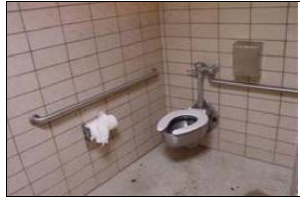
Women's North Restrooms

Full Rec: Relocate the flush control on the toilet in the stall designated to be accessible in the restroom so that it is on the wide (approach) side of the toilet area (see ADAAG 4.16.5). Flush controls shall be hand-operated or automatic mechanisms.