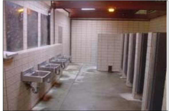
Men's South Restroom

Full Rec: Create an accessible 36-inch wide alternate stall in addition to the required accessible standard stall in the multiple accommodation restroom. The accessible 36-inch wide alternate stall shall include an outward swinging, self-closing door and parallel side grab bars and shall provide at least 66 inches in length for a stall with a wall-mounted toilet or at least 69 inches in length for a stall with a floor-mounted toilet.