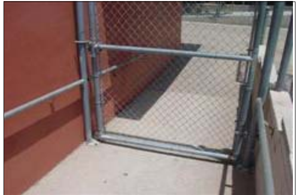
Entrance Gate to the Stengel Field Stadium (Left)

Finding: There is less than 24 inches of clearance on the latch side of the exterior entrance gate.