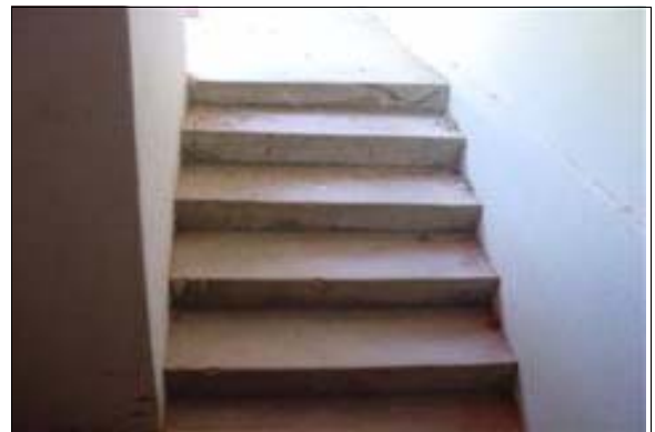
Exterior Stairs to the Locker Rooms at Stengel Field

Full Rec: Install pipe rail handrails on each side of stairway that provide a gripping surface between 1 1/4 to 1 7/8 inches with 12-inch top and bottom handrail extensions that extend beyond the top and bottom treads of the stairway which are parallel to the floor surface. Handrails shall be mounted at a height between 34 and 38 inches at a distance no less than 1 1/2 inches from the adjacent wall.