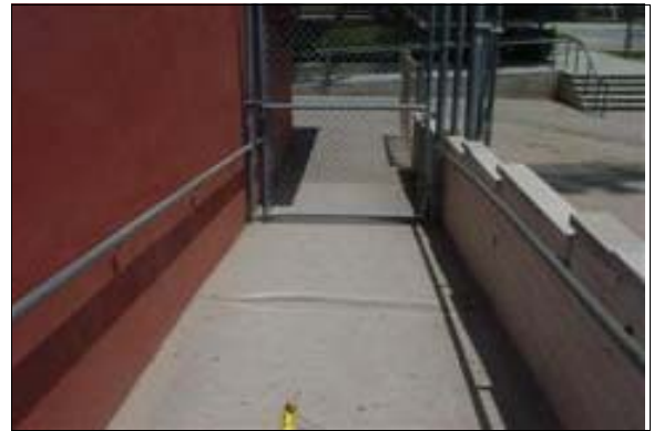
Exterior Ramp to the Stengel Field Stadium (Left)

Full Rec: Replace the handrails on each side of the ramp to provide a height between 34 inches and 38 inches. The gripping surface shall be smooth and free from interruptions. The handrails shall provide 12-inch extensions, extending beyond the top and bottom of the ramp, that are parallel to the ground surface and return smoothly to the post or wall.