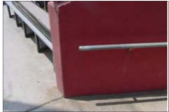
Exterior Ramp to the Stengel Field Stadium (Right)

Full Rec: Weld pipe extensions on the handrails of the ramp so that they continue 12 inches beyond the end of the ramp parallel to the ground surface and return smoothly to the post or wall (see CBC 1133B.5.5 and ADAAG 4.8.5).