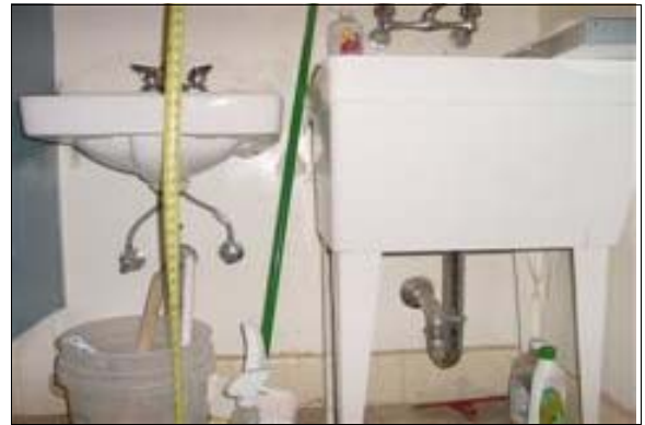
Men's Restroom in the High School Locker Room at Stengel Field

Full Rec: Relocate the lavatory to provide a centerline of at least 18 inches. Make sure to provide at least 30 inches in width and 48 inch length of clear floor space to allow an accessible forward approach (see ADAAG 4.19.3).