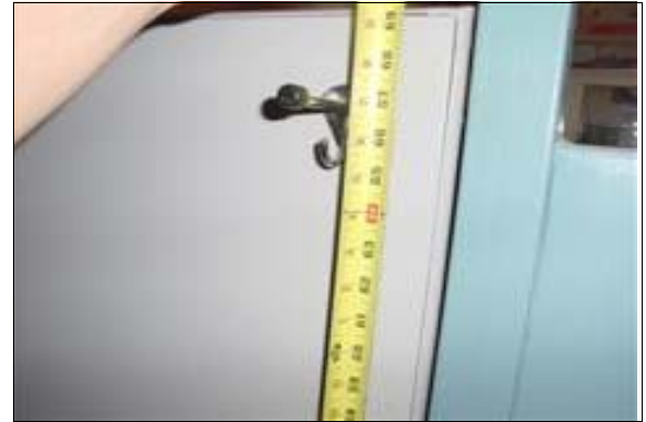
Men's Restroom in the High School Locker Room at Stengel Field

Full Rec: Remount the coat hook on the stall door designated to be accessible in the restroom to a maximum height of 48 inches above the floor surface.