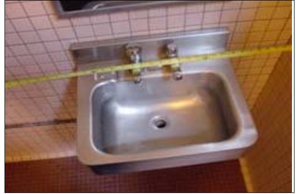
Women's Restroom at Stengel Field

Finding: The distance from the center of the lavatory to the adjacent side wall in the restroom is less than 18 inches.