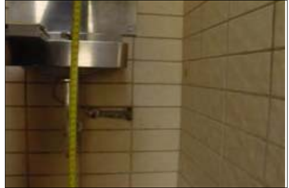
Women's North Restrooms

Full Rec: Insulate or otherwise configure pipes under the lavatory designated to be accessible in the restroom to protect against contact (see ADAAG 4.19.4). Make certain there are no sharp or abrasive surfaces under the lavatory.