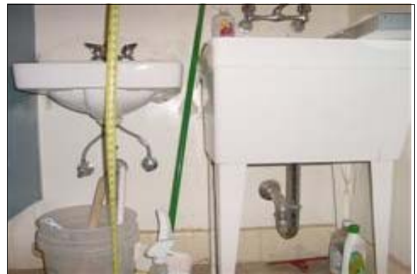
Men's Restroom in the High School Locker Room at Stengel Field

Full Rec: Install faucet controls complying with ADAAG 4.19.5 on the lavatory designated to be accessible in the restroom. Lever-operated, push-type, touch-type or electronically controlled mechanisms are acceptable elements (see ADAAG 4.19.5). If self-closing valves are used the faucet shall remain open for at least 10 seconds.