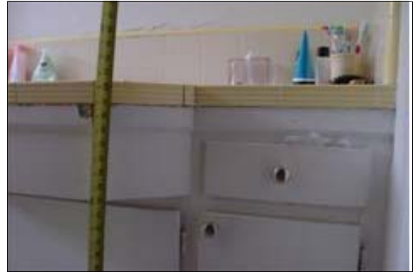
Unisex Restroom in the Caretaker's House

Full Rec: Install faucet controls complying with ADAAG 4.19.5 on the lavatory designated to be accessible in the restroom. Lever-operated, push-type, touch-type or electronically controlled mechanisms are acceptable elements (see ADAAG 4.19.5). If self-closing valves are used the faucet shall remain open for at least 10 seconds.