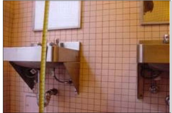
Men's Restroom at Stengel Field

Full Rec: Insulate or otherwise configure pipes under the lavatory designated to be accessible in the restroom to protect against contact (see ADAAG 4.19.4). Make certain there are no sharp or abrasive surfaces under the lavatory.