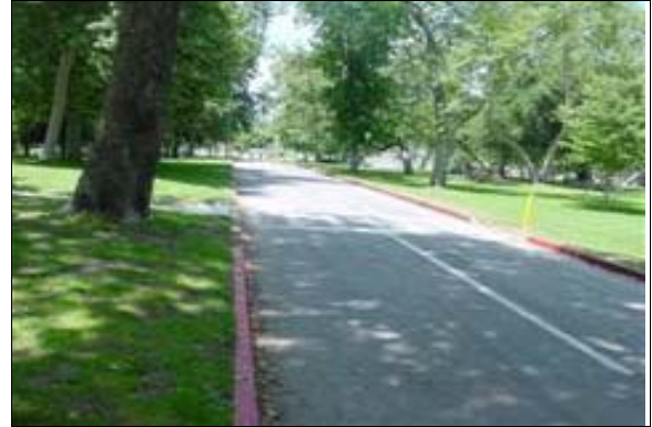
Path of Travel to the North Restrooms