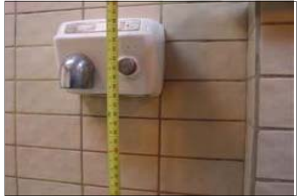
Men's South Restroom

Finding: The height of the controls and operating mechanisms for the hand dryer in the restroom is greater than 40 inches in height.