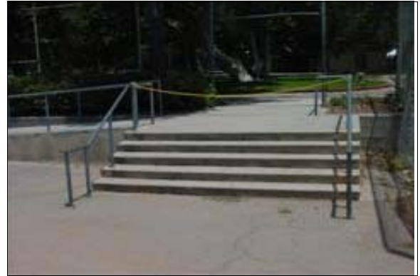
Exterior Stairs to Stengel Field

Full Rec: Affix detectable contrasting striping to each tread of the stairway that clearly contrasts in color from the tread and is at least 2 inches in width placed no more than 1 inch from the tread nose or landing.