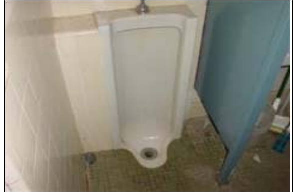
Men's Restroom in the High School Locker Room at Stengel Field

Finding: The urinal in the restroom is floor mounted and does not provide a tapered, elongated rim. The flush control valve on the urinal is greater than 44 inches above the finished floor.