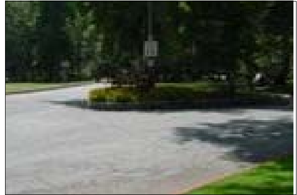
Accessible Route from the Public Right of Way

Full Rec: Stripe a crosswalk not less than 48 inches wide on the path of travel to the accessible entrance of the facility. Provide a level surface that does not exceed a slope greater than 5%. Cross slopes shall not exceed 2%. Detectable warnings should be placed at the entrance and exit of the crosswalk.