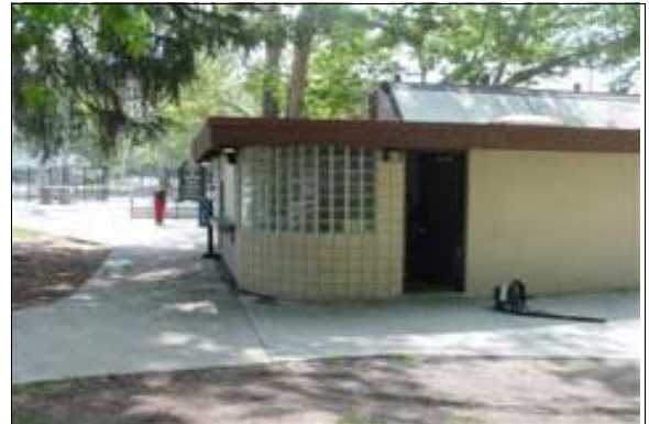
Skate Park Operations Office

Full Rec: Provide signage at the reception counter that states: "Assistance Is Available, Please Contact an Employee." The sign should contain the International Symbol of Accessibility.