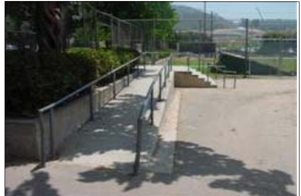
Exterior Ramp to Stengel Field

Finding: The ramp is not bounded by a wall or fence, thus not providing any edge protection to prevent individuals from slipping off the ramp.