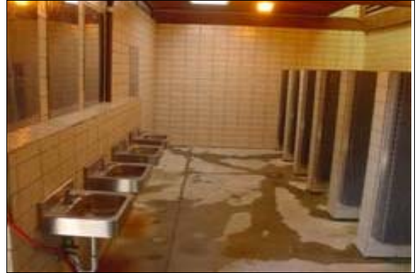
Women's South Restroom

Full Rec: Create an accessible 36-inch wide alternate stall in addition to the required accessible standard stall in the multiple accommodation restroom. The accessible 36-inch wide alternate stall shall include an outward swinging, self-closing door and parallel side grab bars and shall provide at least 66 inches in length for a stall with a wall-mounted toilet or at least 69 inches in length for a stall with a floor-mounted toilet.