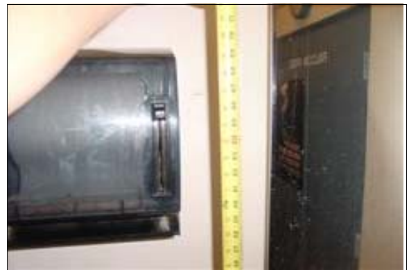
Men's Restroom in the High School Locker Room at Stengel Field