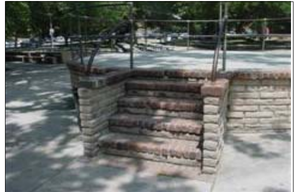
Exterior Stairs to the Outdoor Stage

Full Rec: Install pipe rail handrails on each side of stairway that provide a gripping surface between 1 1/4 to 1 7/8 inches with 12-inch top and bottom handrail extensions that extend beyond the top and bottom treads of the stairway which are parallel to the floor surface. Handrails shall be mounted at a height between 34 and 38 inches at a distance no less than 1 1/2 inches from the adjacent wall.