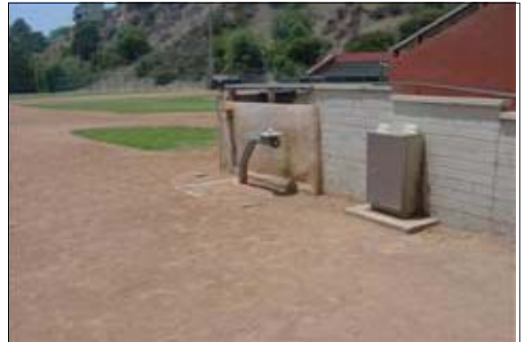
Path of Travel to the Drinking Fountain at Stengel Field

Finding: The path of travel to the drinking fountain at Stengel Field is dirt, preventing access to individuals with mobility impairments.