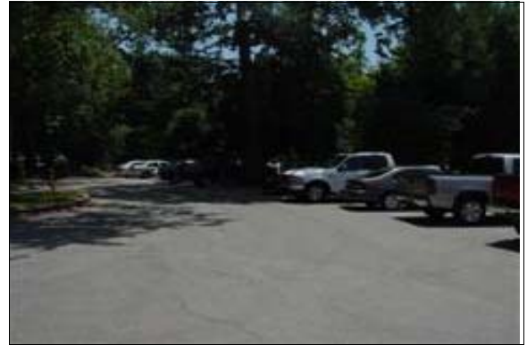
Parking Lot Outside of the Maintenance Building

Full Rec: One out of the 11 total number of marked parking spaces is required to be designated exclusively for accessible parking, as required by CBC 1129B and ADAAG. Create one van-accessible parking space measuring at least 108 inches wide and 216 inches long with an access aisle measuring at least 96 inches wide (8 feet) located on the passenger side (right side) of the parking space (see CBC 1129B). Add the words NO PARKING in 12 inch high white letters at the entrance to the accessible parking access aisle.