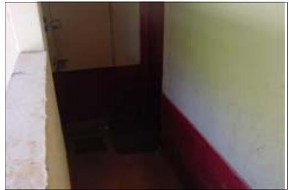
Path of Travel to the Locker Rooms at Stengel Field

Full Rec: Since programs, services and activities to staff and the public (volunteers, etc.) are provided in this location, those programs, services and activities are required to be made accessible. It is recommended that a ramp be installed or other means of vertical access.