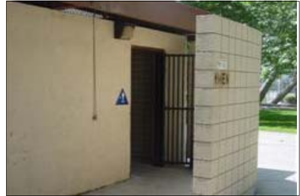
Men's South Restroom

Full Rec: The restroom is designated accessible and should be made accessible for the facility. Post signage centered 60 inches above the ground surface on the latch side of the entrance door identifying the restroom as accessible upon completion of the following items (see CBC 1115B., ADAAG 4.1.2(7) and ADAAG 4.1.6(3)(e)). Signage shall include Braille and raised lettering, the gender or unisex use symbol and the ISA symbol. Post Title 24 gender use signage on the door @ 60" o.c. a.f.f.