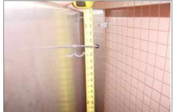
Women's Restroom at Stengel Field