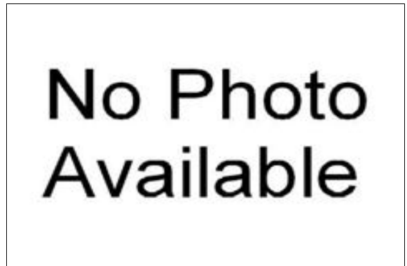
Parking Lot at Stengel Field

Finding: Each designated accessible parking space required in the parking lot shall provide a post-mounted sign showing the International Symbol of Accessibility.