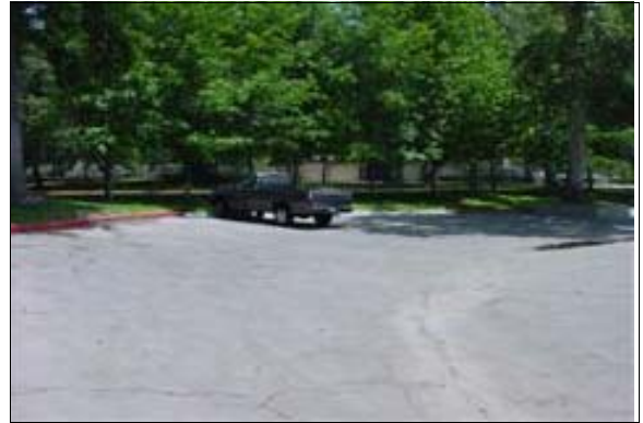
Parking Lot at Stengel Field

Finding: Parking is provided off-street to the employees at Stengel Field, though no marked spaces are provided. The parking lot can provide approximately three parking spaces.