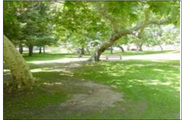
Outdoor Dining Area at the North End of the Park

Citations: CBC 1122B.3; ADAAG 4.32.2; ADAAG 4.32.5(2)