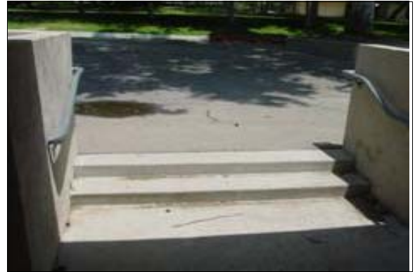
Exterior Stairs to the Restrooms at Stengel Field

Full Rec: Provide one intermediate handrail for each 88 inches of stairway width. Space intermediate handrails equally across the entire width of the stairway.