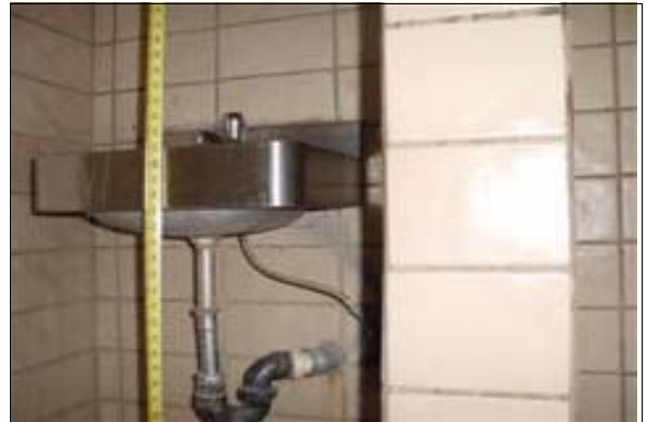
Men's North Restrooms

Finding: The pipes under the lavatory in the restroom do not provide protection against contact.