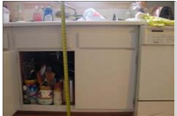
Sink in the Caretaker's House

Finding: The sink in the kitchen is in an enclosed cabinet, thereby preventing an accessible forward approach. The height of the counter surface of the sink is greater than 34 inches above the finished floor.