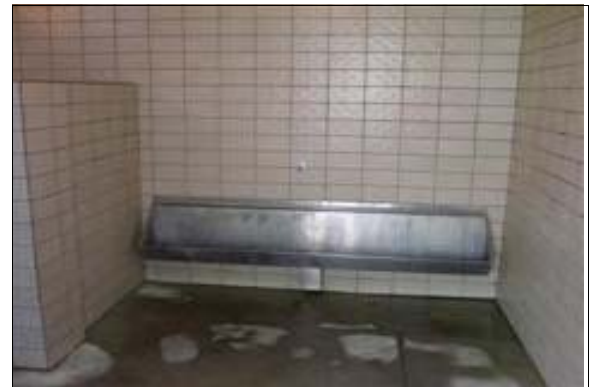
Men's South Restroom

Full Rec: Replace the urinal designated to be accessible in the restroom with a wall-mounted or stall-type tapered, elongated rim unit complying with ADAAG 4.18.2. The height of the rim surface of the urinal designated to be accessible shall not exceed 17 inches above the finished floor and the flush control valve shall not exceed a height of 44 inches above the finished floor.