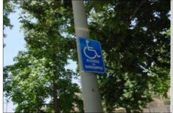
Parking Lot Next to the Skate Park Operations Office

Full Rec: Install a permanently posted reflectorized sign measuring 70 square inches that includes an ISA symbol adjacent to and visible from the accessible parking space (see CBC 1129B.5). The bottom edge of the sign must be mounted 80 inches from the ground surface so that it cannot be obscured by a parked vehicle (see CBC 1129B.5). The "van-accessible" parking space shall provide an additional sign marked "van-accessible" mounted below the sign (see CBC 1129B.5 and ADAAG 4.6.4).