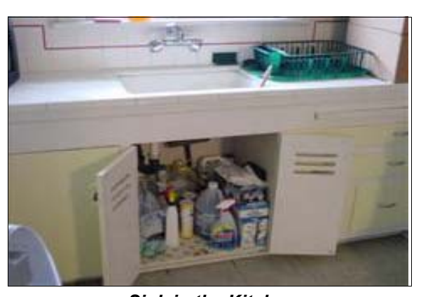
Sink in the Kitchen

the sink for an accessible forward approach and shall provide at least 27 inches clear knee space and a minimum of nine inches clear toe space (see ADAAG 4.19.2). If neither clear floor space and knee and toe clearance can be provided, remove the sink cabinet and replace with an accessible wall-mounted sink unit.