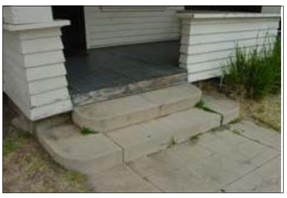
Exterior Stairs to the Main Entrance

height between 4 and 7 inches (see CBC 1006.3).