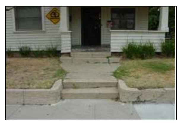
Exterior Stairs to the Main Entrance