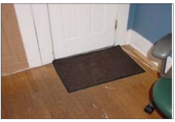
Path of Travel to the Rear Entrance

edges on all sides to prevent roll over.