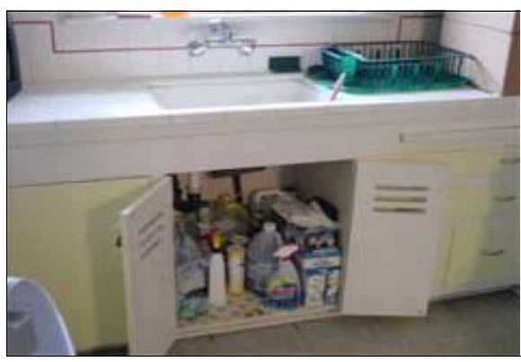
Sink in the Kitchen

designated to be accessible in the room to protect against contact (see ADAAG 4.19.4). Make certain there are no sharp or abrasive surfaces under the sink.