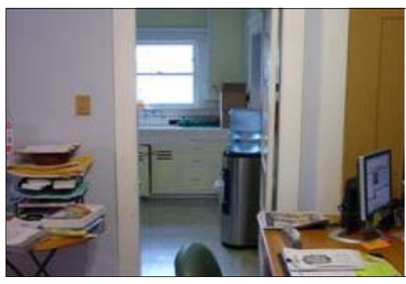
Interior Door to the Kitchen

degrees (see CBC 1133B.2.3.1 and ADAAG 4.13.5).