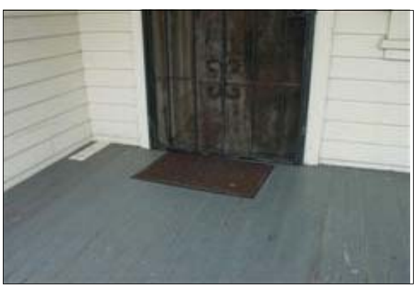
Path of Travel to the Main Entrance

edges on all sides to prevent roll over.