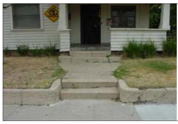
Exterior Stairs to the Main Entrance

Citations: CBC 1006.16.1; CBC 11133B.4.4; ADAAG 4.9.5