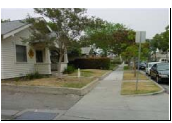
Accessible Route from the Public Right of Way

Citations: CBC 1114B.1.2; CBC 1117B.5.7; CBC 1127B.3; ADAAG 4.1.2(7); ADAAG 4.3.2; ADAAG 4.14.1