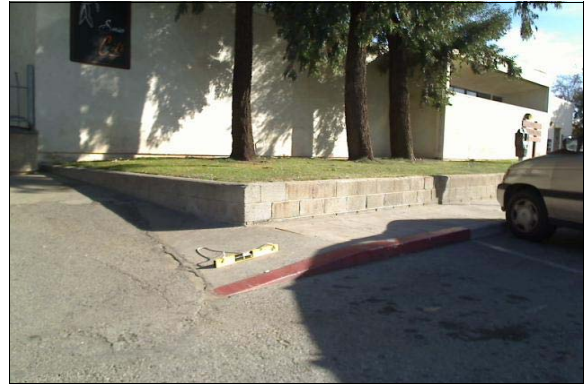
Curb Ramp in front of the Adult Recreation Center

Full Rec: Replace the curb ramp with a compliant curb ramp that is at least 48 inches in width, slopes no greater than 8.33%, cross slopes no greater than 2%, and has a level top and bottom landing.