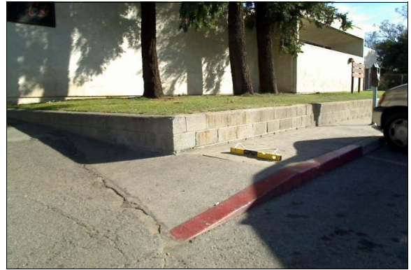
Curb Ramp in front of the Adult Recreation Center

Full Rec: Provide a grooved border at least 12 inches wide along the top of the curb ramp and install a compliant detectable warning surface of truncated domes.