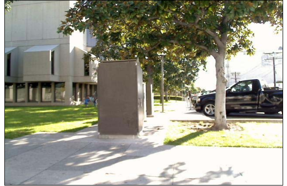
Accessible Route from the Public Right of Way

Finding: There is no accessible route from the public right of way to the parking lot or to the accessible parking spaces.