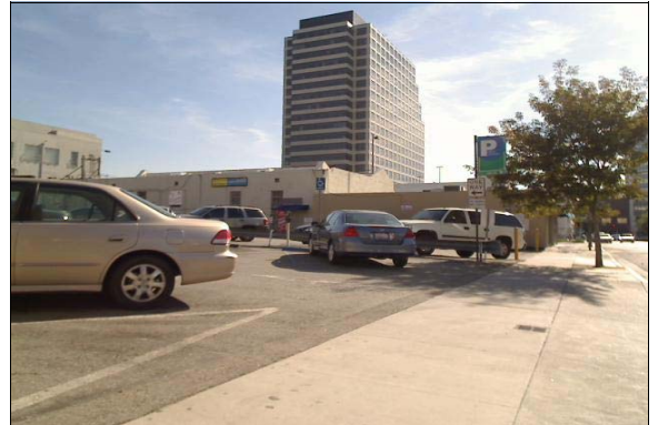
Accessible Route from the Public Right of Way

Finding: There is no accessible route from the public right of way to the parking lot or to the accessible parking space.