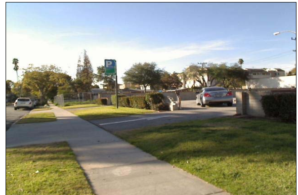
Accessible Route from the Public Right of Way

Finding: There is no accessible route from the public right of way to the parking lot or to the accessible parking space.