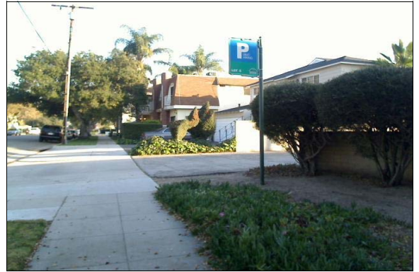
Accessible Route from the Public Right of Way

Finding: There is no accessible route from the public right of way to the parking lot or to the accessible parking space.