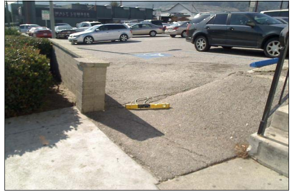
Accessible Route from the Public Right of Way

Finding: There is no directional signage to the accessible entrance from the public right of way.